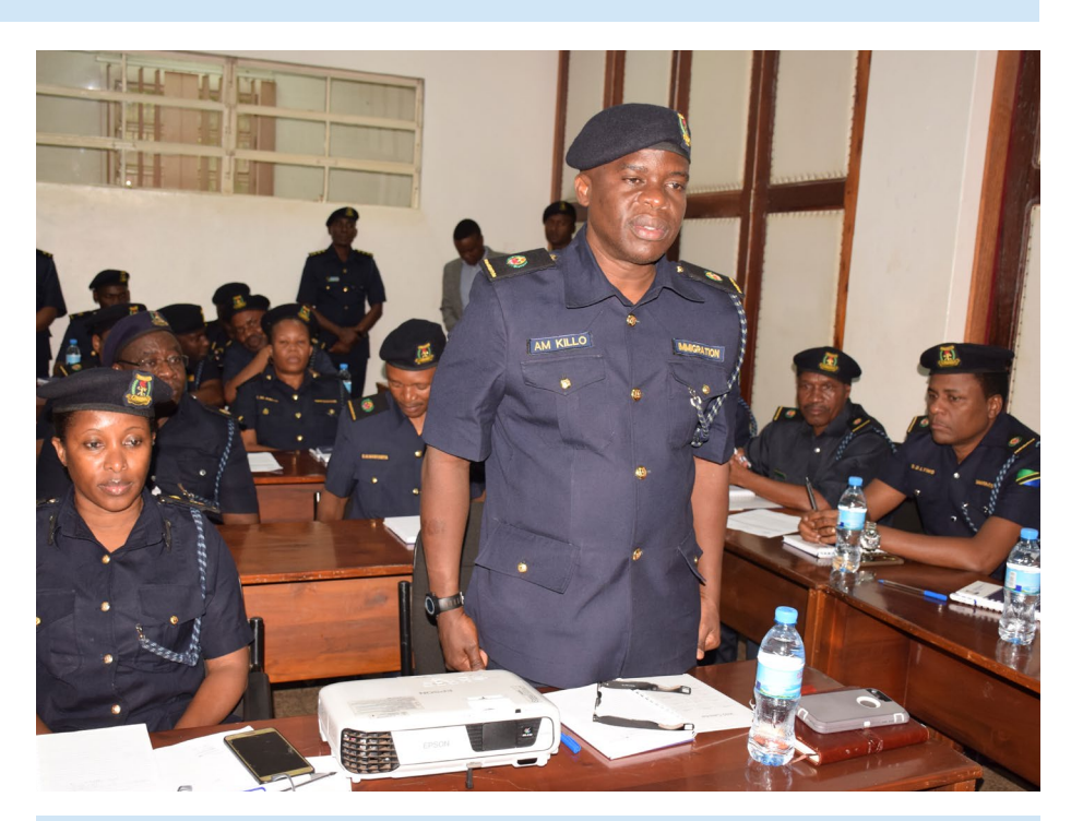
IOM Tanzania in partnership with the Tanzania Immigration Service Department has kicked off a series of training for Immigration Officials from the Southern Regions of Mtwara, Ruvuma and Lindi. The training will Strengthen Community Engagement and Policing and Integrated Border Management.

The series of training is part of the 'Strengthening Community Engagement and Policing and Integrated Border Management' project which is funded by the Germany Federal Foreign Office