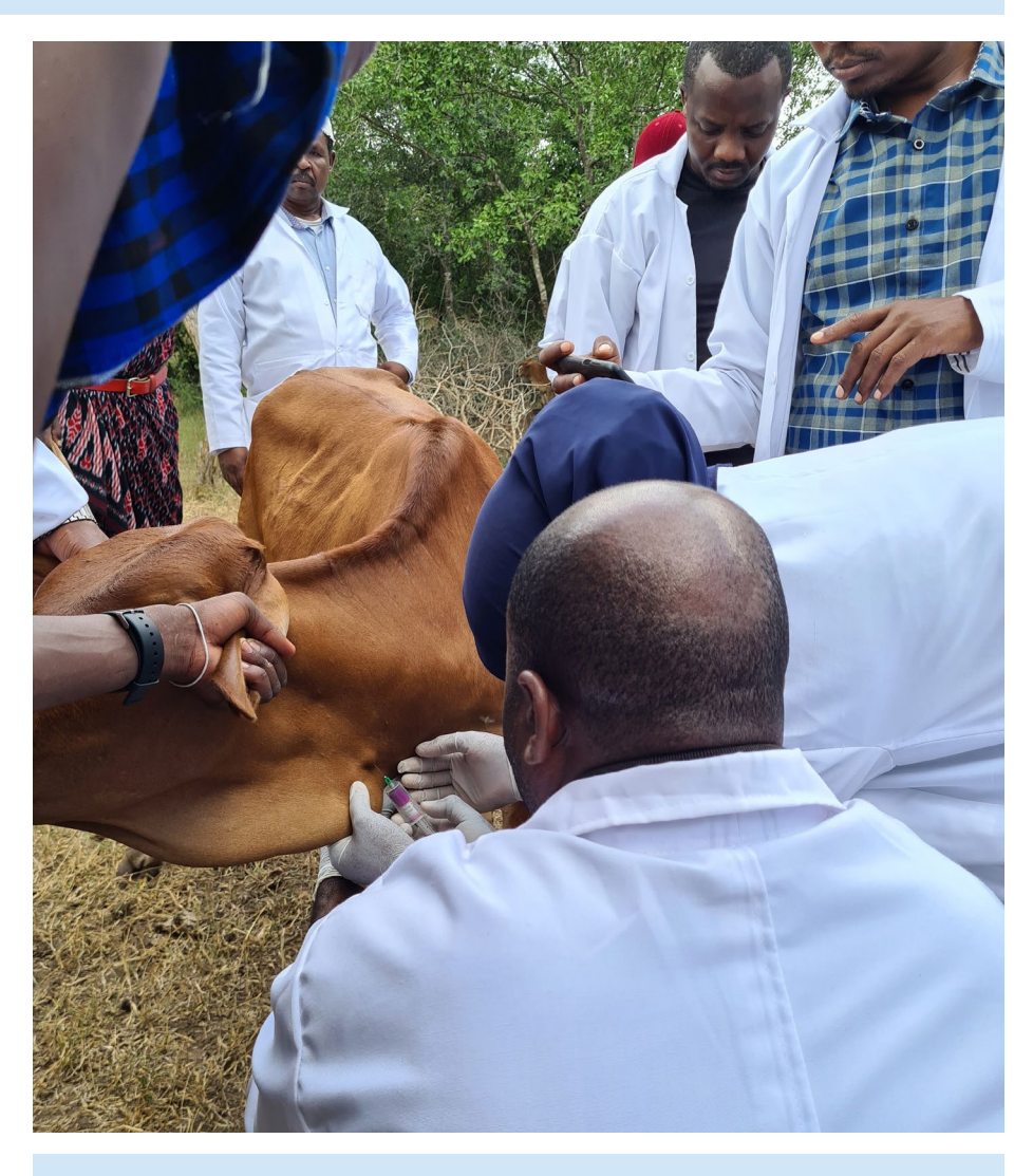
In-Service Applied Veterinary Epidemiology Training (ISAVET) trainees practice collecting blood samples from livestock.

Prof. Nonga thanked FAO for their continued support to the sector. He urged the trainees to take advantage of the opportunity to improve the quality of their work, particularly in disease detection and response.