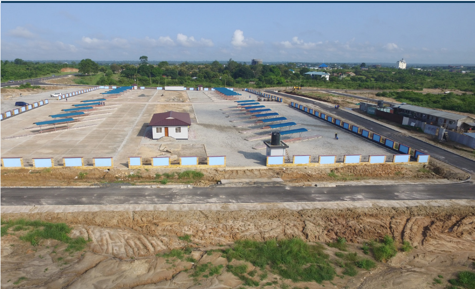
The new Kibaha Town Council bus terminal current is in the final stages of construction.

Kibaha Town Council (KTC) is constructing a modern bus terminal to serve approximately 600 buses, 1,500 minibuses and up to 96,000 passengers per day. This new terminal is a solution to the people of Kibaha's outcry for the service as the old Mailimoja roadside stand that they previously used was demolished to give way to the expansion of the main Dar-Chalinze highway.