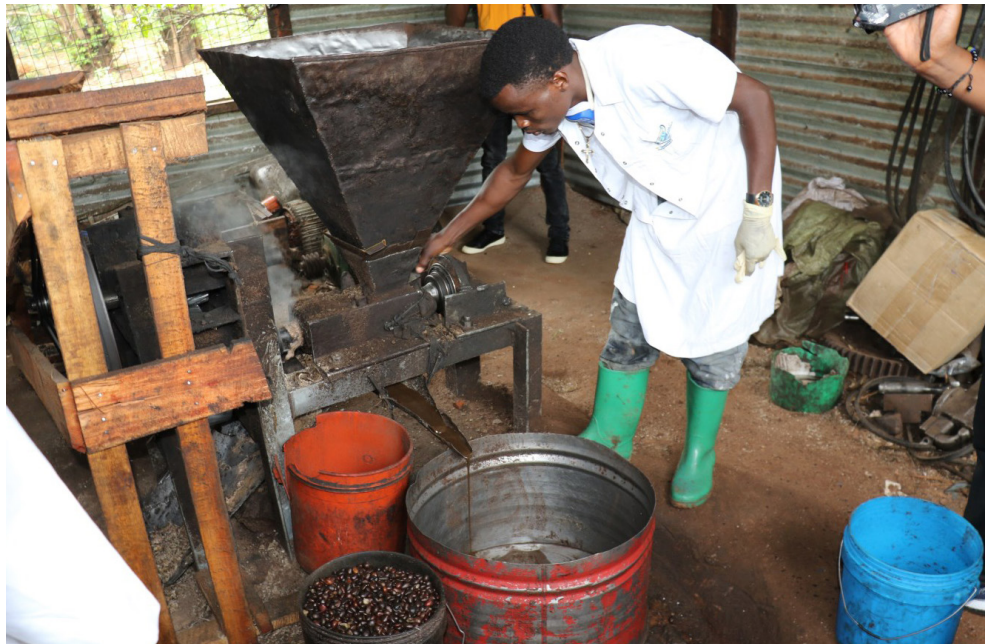
One of the beneficiaries from the UN's previous joint programme in Kigoma Town shows the visiting delegation how he extracts oil from the pine nuts.