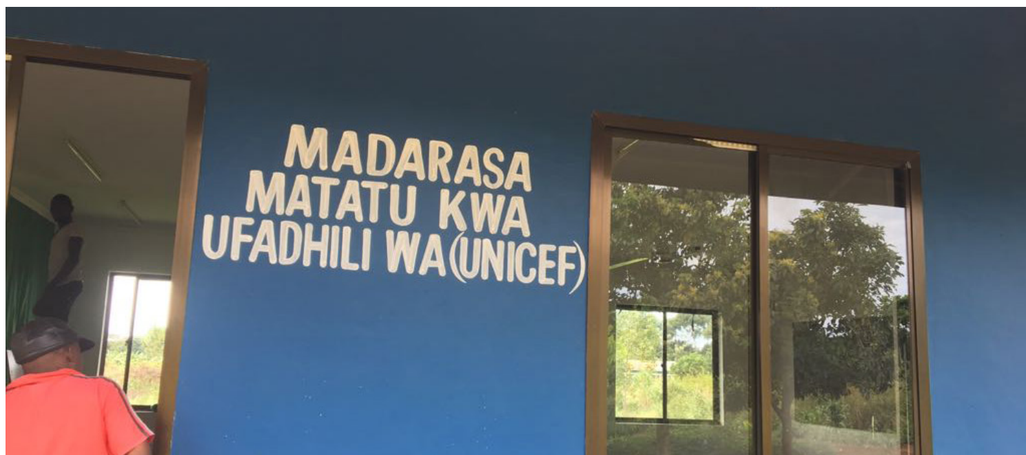
One of the classrooms that UNICEF renovated following the September 2016 Kagera earthquake.