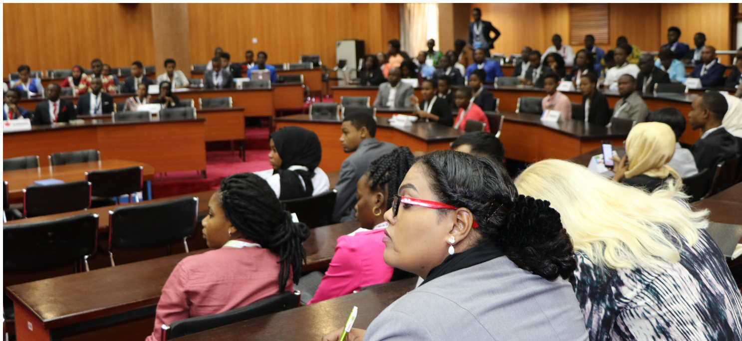
International and Tanzanian delegates follow the opening ceremony of the Tanzania International Model UN (TIMUN) 2018 that took place in Dodoma.

Tanzania International Model United Nations (TIMUN) is an annual youth meeting which brings together over 200 participants from United Nations member countries on a general assembly to discuss chosen topics and themes.