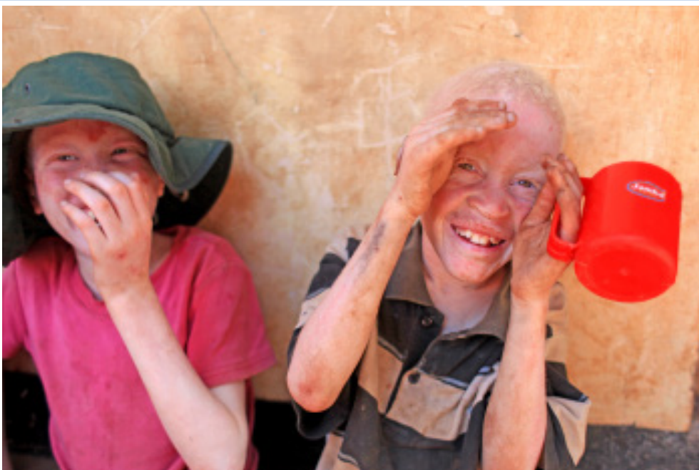
Two children smile joyfully during one of the missions to support vulnerable children.

The earthquake completely destroyed 840 houses while more than 1,270 houses were left seriously damaged rendering thousands of people homeless and many students, including those of Mugeza Mseto Special Needs Primary School, with-