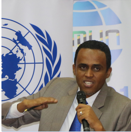
Member of Parliament for Nzega Urban Constituency, Hon. Hussein Bashe, addressing youth at TIMUN 2018 on creativity and how young people can use innovation to implement the Global Goals.