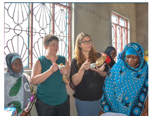
The Members of Parliament from Sweden taste some food made by the women entrepreneur's group.

its members are women engaged in seaweed farming and value addition, making products such as soap, body cream, juice and cake.