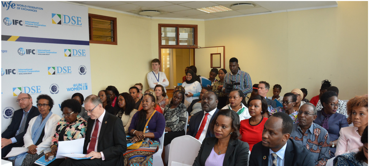
Development partners, government officials, UN officials, the private sector and other stakeholders at the Ring the Bell for Gender Equality event at the Dar Stock Exchange on Women's Day.