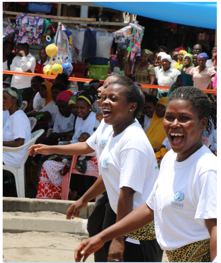
Entertainers performing during Women's Day commemorations at Mchikichini market in Ilala district, Dar es Salaam.