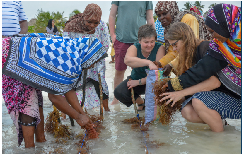
Members of Parliament from Sweden meet with women seaweed farmers who show them firsthand how they harvest seaweed.