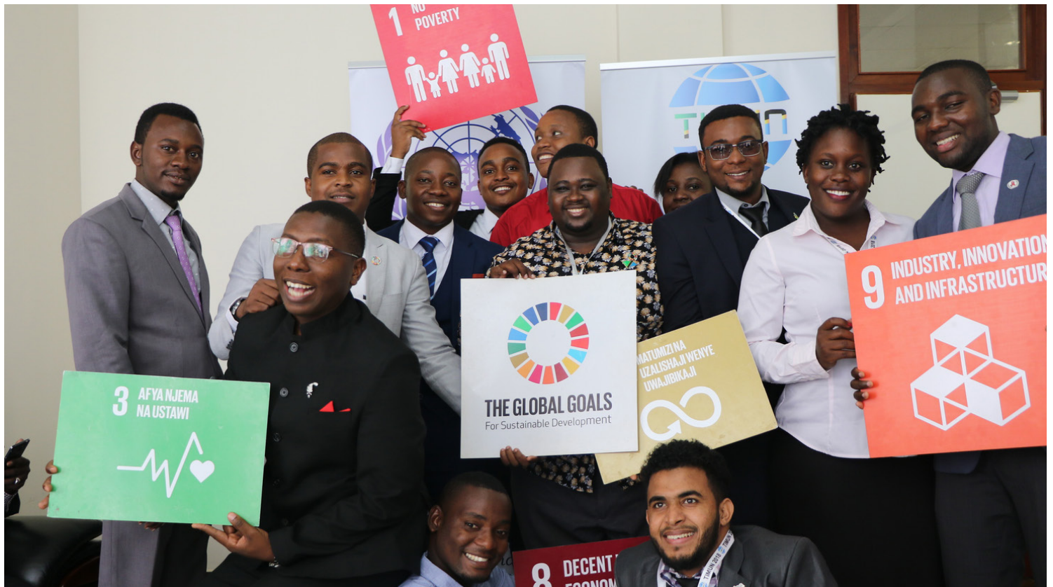
Global Goals Youth Champions who have been advocating for and doing their part to implement the Global Goals in Tanzania since TIMUN 2016.

-Calls on all member states to ensure equal empowerment in possession of resources and all assets in relation to gender parity.