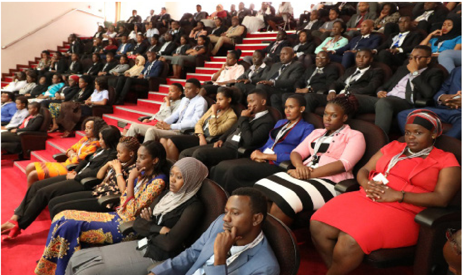
TIMUN 2018 participants attending one of the budget sessions at the National Assembly. They were invited by the Deputy Minister of State in the Prime Minister's Office, Hon. Antony Mavunde.