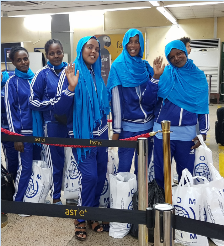
The six Ethiopians girls that were taken from prison arrive at the airport. IOM was able to return them safely to their homes in Ethiopia.

In March, the United Nations Migration Agency (IOM) in Tanzania conducted a nationality verification mission for Ethiopian irregular migrants detained in six Tanzanian prisons, namely, Bukoba Prison, Kitengule Prison, Butimba Prison, Maweni Prison, Kigononi Prison and Keko Prison.