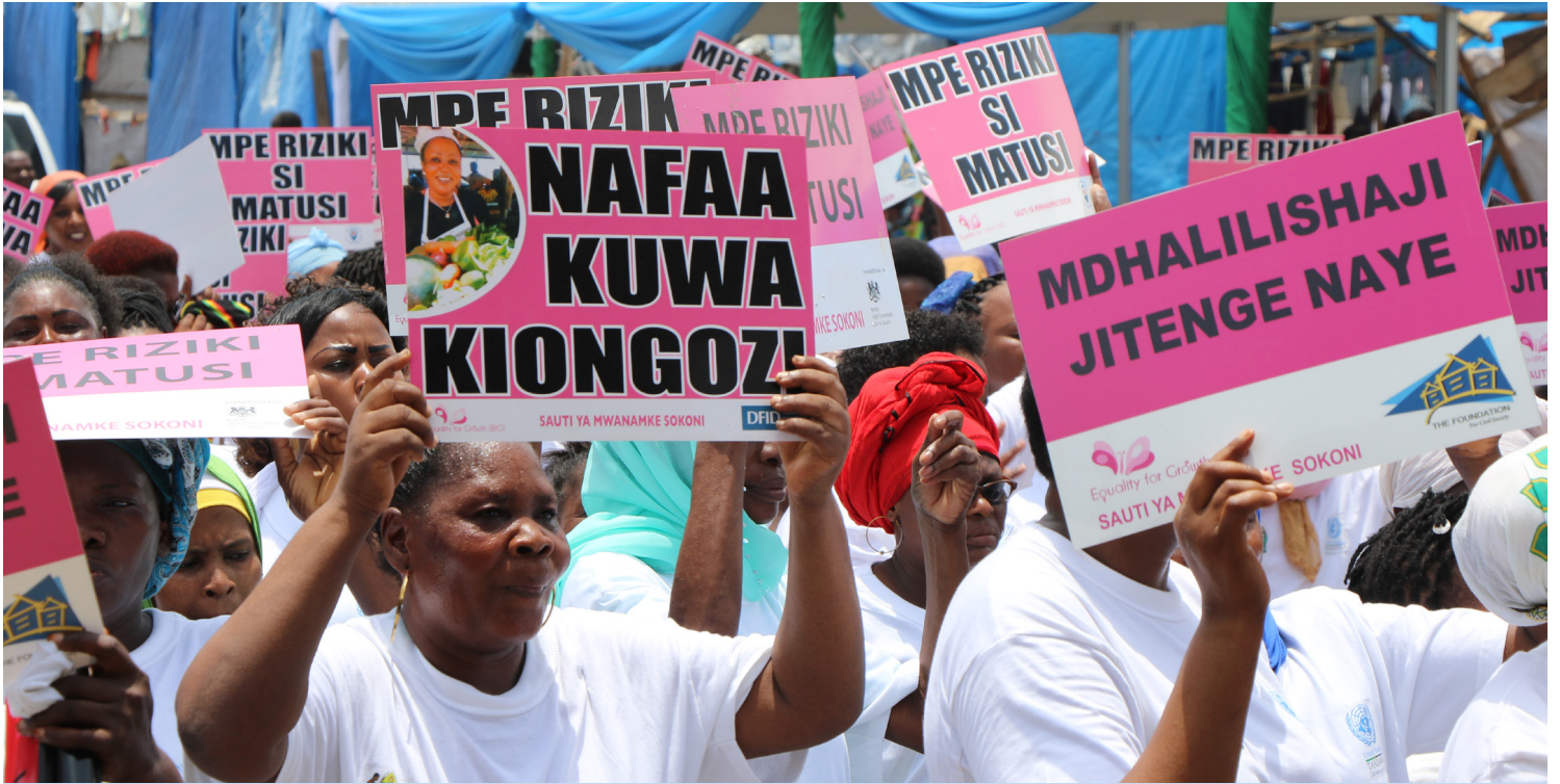
Women traders from Mchikichini market in Ilala district, Dar es Salaam celebrate International Women's Day. UN Women has been supporting female traders in local markets all over Dar es Salaam since 2015.