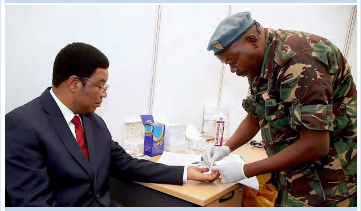
The Prime Minister of the United Republic of Tanzania, Hon. Majaliwa Kassim Majaliwa leading the HIV testing campaign in Dodoma during the launch of the 'Furaha yangu' campaign.

In June, the Prime Minister of the United Republic of Tanzania. Hon. Kassim Majaliwa Majaliwa, launched a nationwide HIV testing campaign in Dodoma. Dubbed 'Furaha yangu', literally meaning "My happiness", the campaign is meant to encourage all Tanzanians, especially men and youth to go for testing and start early treatment if found to be HIV positive. The Premier, urged people to participate in the campaign and said that the government is attempting to attain the global set goal of 90-90-90 by 2020. This would mean that by 2020, 90 per cent of all people living with HIV know their status, 90 per cent of those diagnosed are receiving treatment and 90 per cent of those receiving treatment have viral suppression.