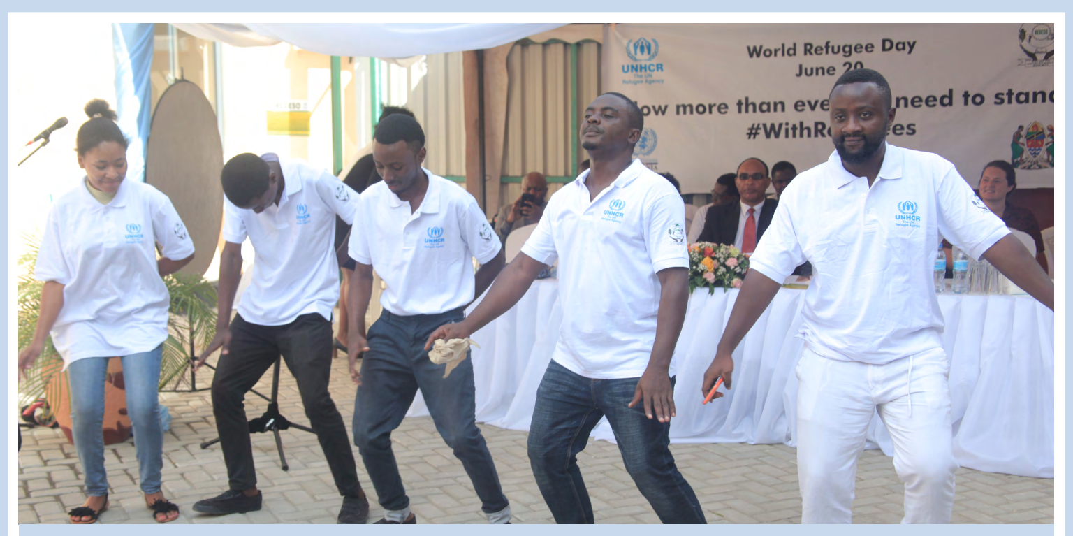
A congolese youth group provides entertainment on WRD commemorations in Dar es Salaam.

and UN officials, including those from Refugee Services Department of the Ministry of Home Affairs.