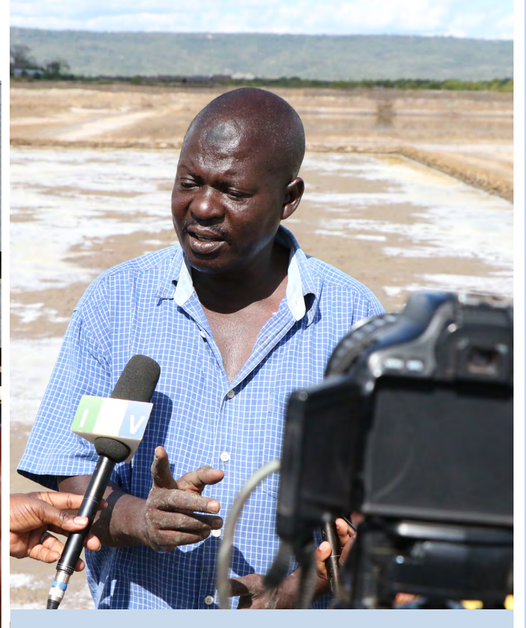
A salt producer from Lindi region speaks to the media about the support he received from UNICEF. He was given training and equipment to ensure his salt had adequate iodine levels.