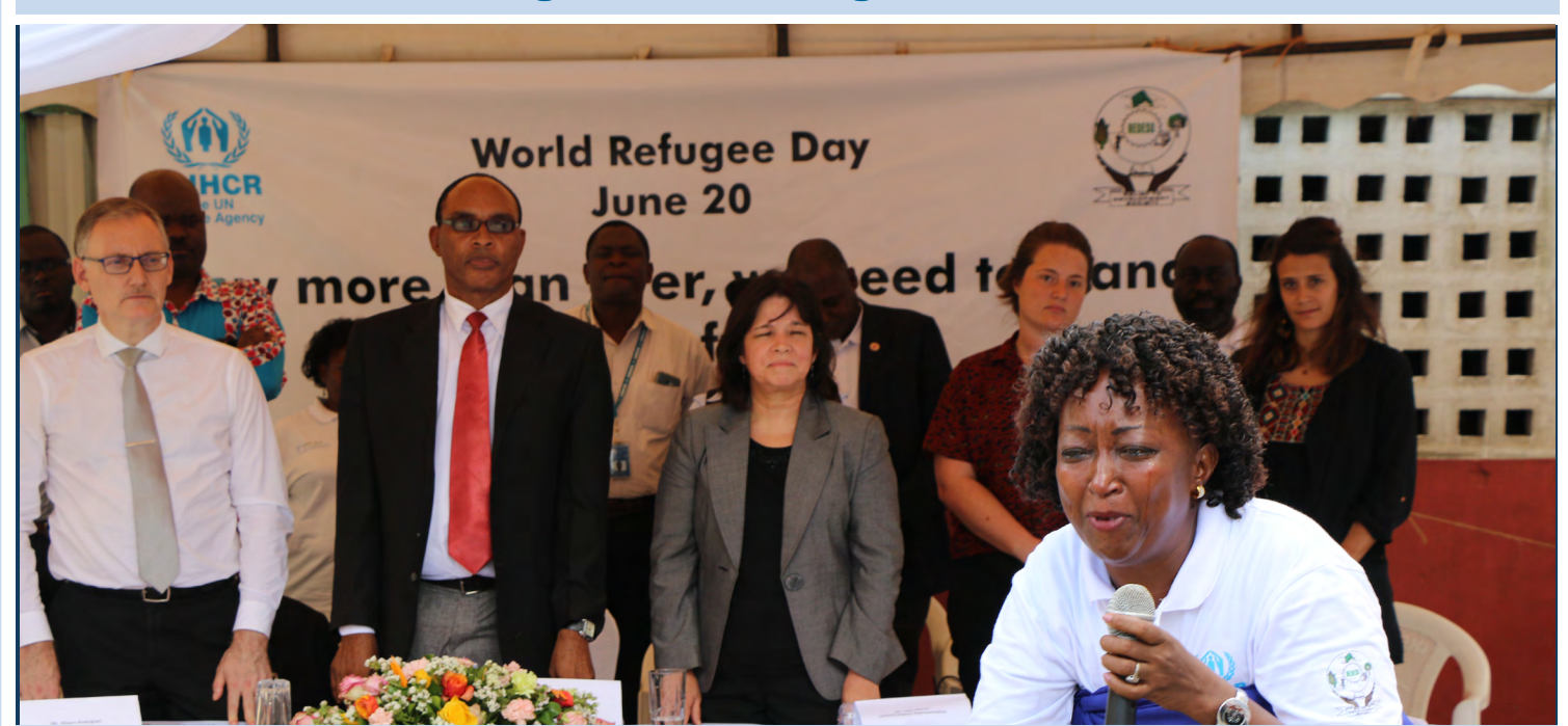
An urban refugee tells her story during WRD commemorations in Dar es Salaam.

Music, dance, art, sports, drama, etc.-these are some of the activities that people in the three refugee camps (Mtendeli, Nduta and Nyarugusu) in Kigoma region as well as in Dar es Salaam engaged