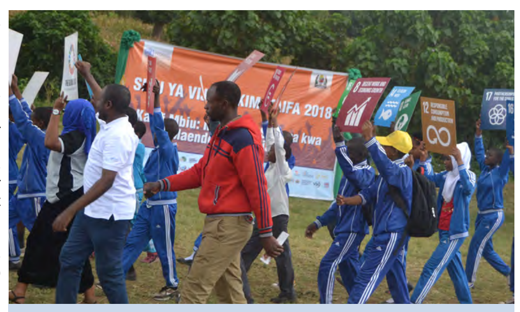
A procession of youth advocate for the Global Goals during International Youth Day celebrations in Tengeru, Arusha. Government and UN officials emphasized that youth participation in development is crucial for achievement of national and international development agendas including the SDGs.

He urged employers and all workplaces to ensure safety for their young workers by ensuring a safe work environment. He also urged youth workers to observe laws and regulations and called for the identification of young workers at risk through research.