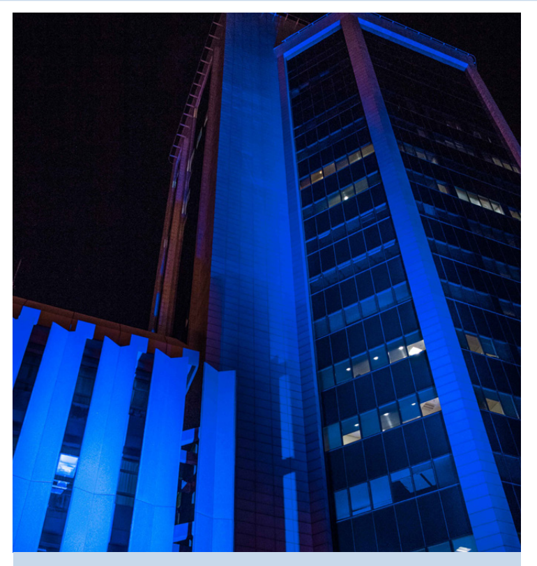
Bank of Tanzania (BoT) went blue in support of UNICEF Tanzania to commemorate World Children's Day. On the 27th of November, UNICEF Tanzania held an #ActivateTalk at the BoT to give children and #ChangeMakers a platform to amplify their voices and advocate for children rights.