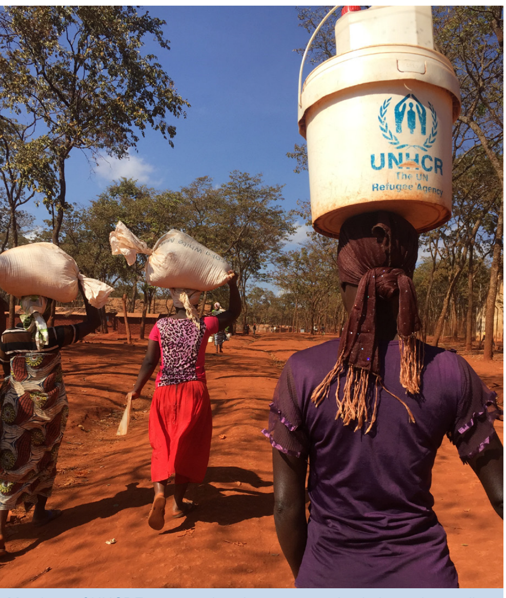
Members of UNCDF-supported savings groups take their goods to sell at the Nyarugusu common market.

Allied Democratic Force (ADF) fighters, ambushed a contingent from the UN Stabilization Mission in DRC (MONUSCO), at its Company Operating Base in Semuliki in the Beni area of North Kivu. A protracted