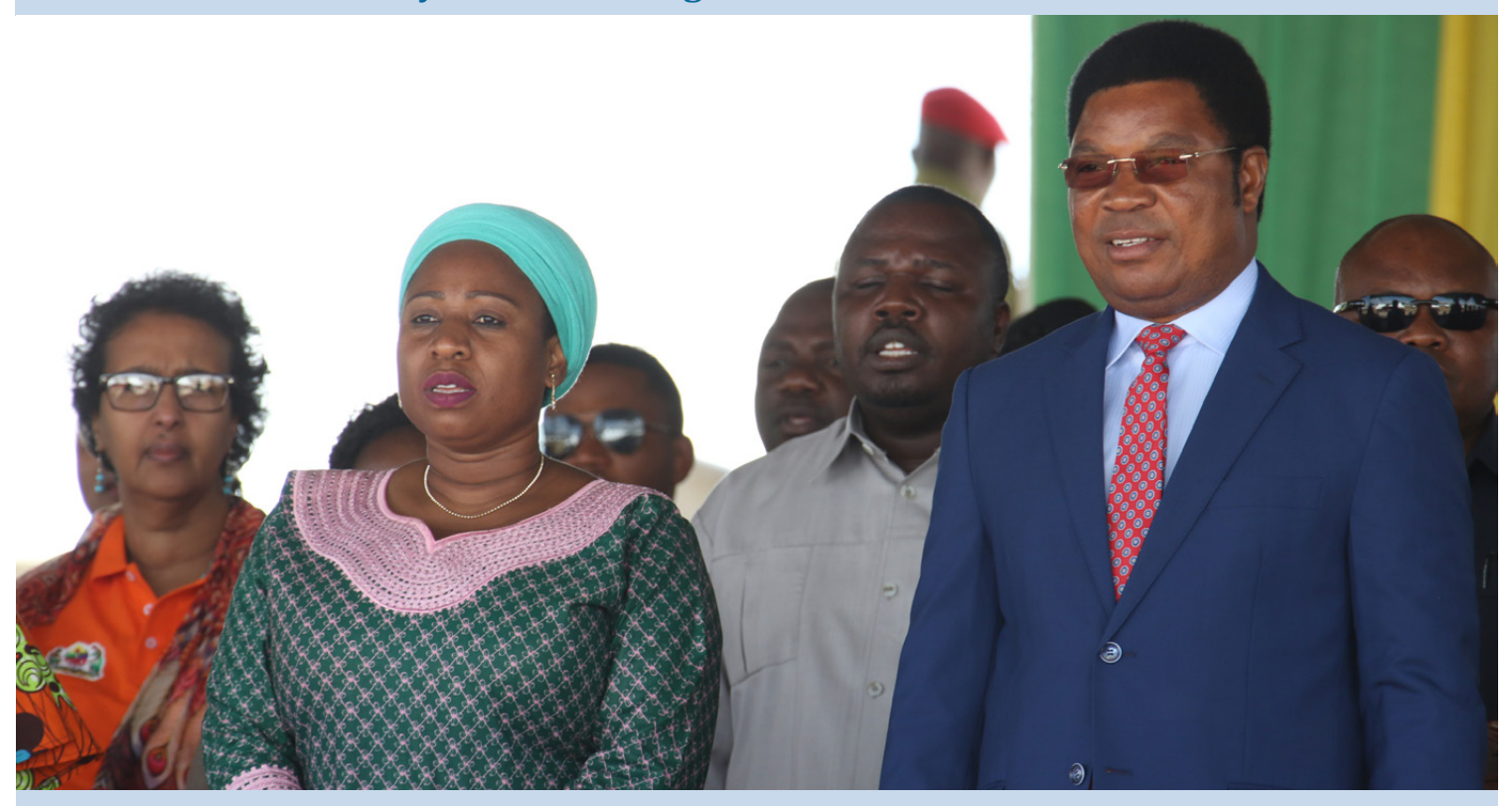
The Prime Minister of the United Republic of Tanzania, Hon. Kassim Majaliwa Majaliwa (right) and the Minister of Health, Community Development, Gender, Seniors and Children, Hon. Ummy Mwalimu (left) at the launch of 16 Days of Activism Against Gender-Based Violence. The campaign was launched in Dodoma at Jamhuri National Stadium..

not only for the police and the by their husband or partner; with towards protecting the rights of courts of law but also for the men 33.4 percent suffering violence women. They now believe that it in communities such as those in the 12-months preceding the is every woman's right to live their found in Kigoma.