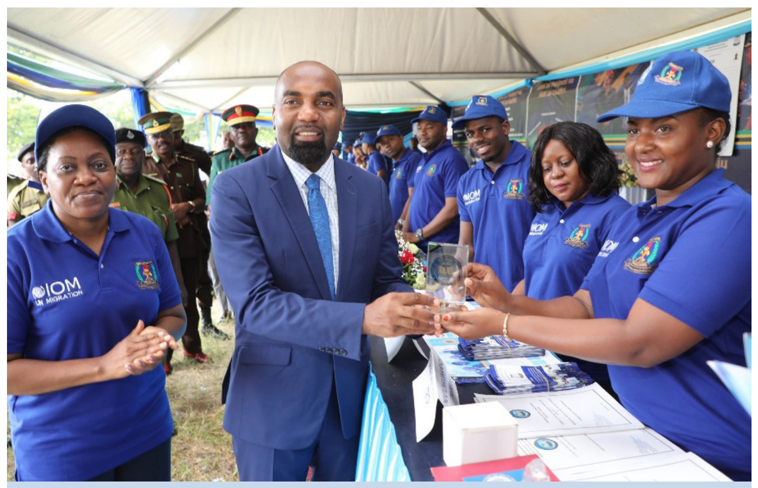
The Deputy Minister for Home Affairs, Hon. Eng. Hamadi Masauni, was the guest of honor at the climax of International Migrant's Day commemorations. He spoke about efforts that the Ministry of Home Affairs has made to improve immigration services and urged parents to take care of their children to protect them from falling prey to human trafficking.

International Organization IOM Migration (IOM) joined the government of the and commemorating Migrants Day on 18 December with the IOM African Capacity 2018 at Mnazi Mmoja Grounds in Dar es Salaam. This year's theme was: "Migration with Dignity."