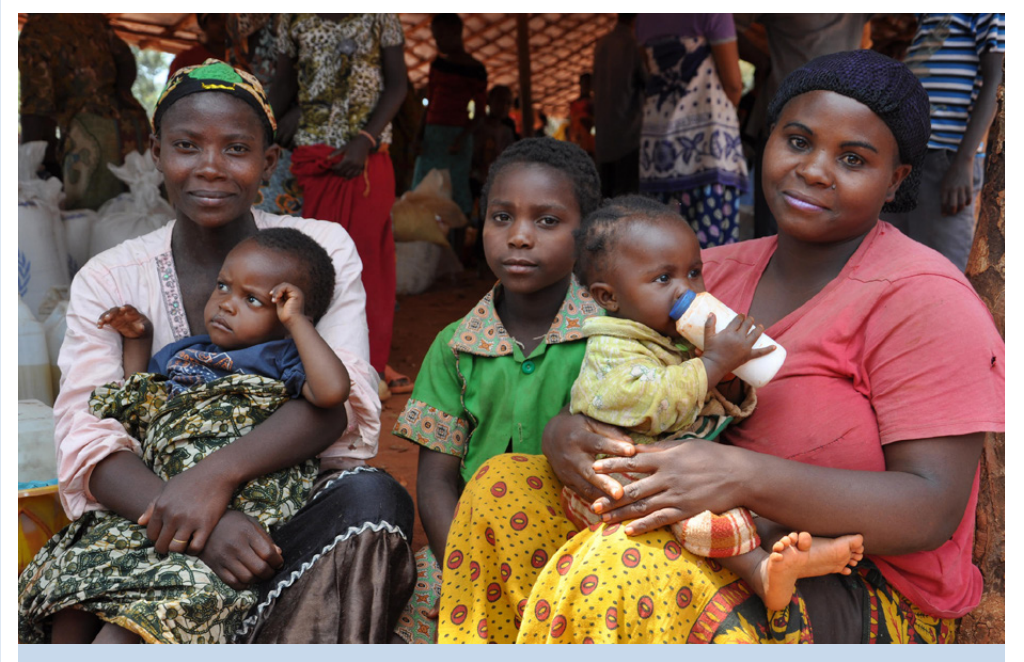
Germany's €3.25 million contribution to WFP will provide life-saving food assistance for over 290,000 refugees currently being hosted in Kigoma region.

In December, the World Food the Government and people of Programme (WFP) welcomed a €3.25 million contribution from Country Tanzania in 2018-19.