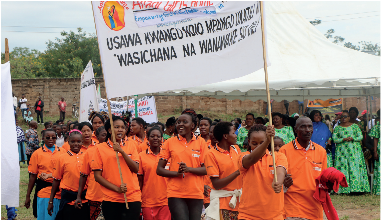
Amani Girls Home, a local NGO that works to empower girls for sustainable development, take part in a march for gender equality during International Women's Day Commemorations in Mwanza. The sign their holding reads: 'Equality is a deal for me, Violence against girls and women is not a deal'.