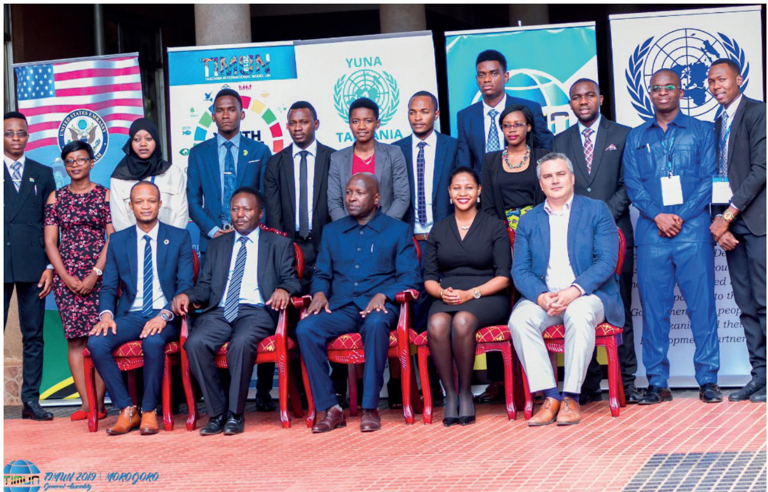
Development partners, Government officials and the Tanzania International Model United Nations (TIMUN) organizing committee during the closing ceremony of the event.

This year over 200 national and international youth attended the annual assimilation of the United Nations General Assembly dubbed Tanzania International Model United Nations (TIMUN) which took place in Morogoro in late April.