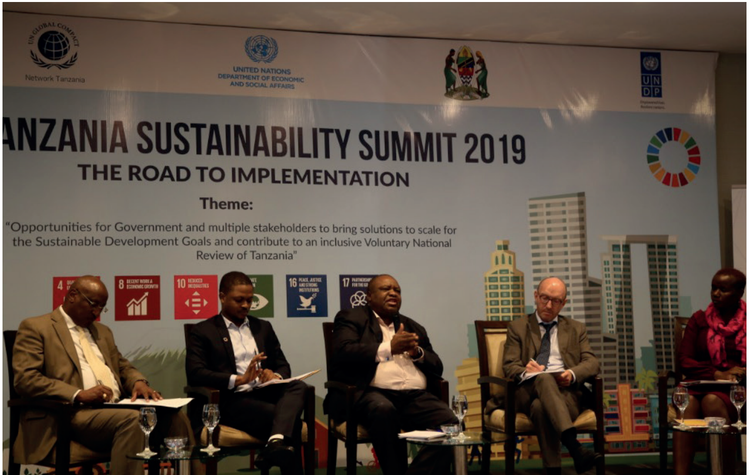
Panelist discussion on the global goals between representatives from private Sector, development partners, civil society, youth and research organizations.