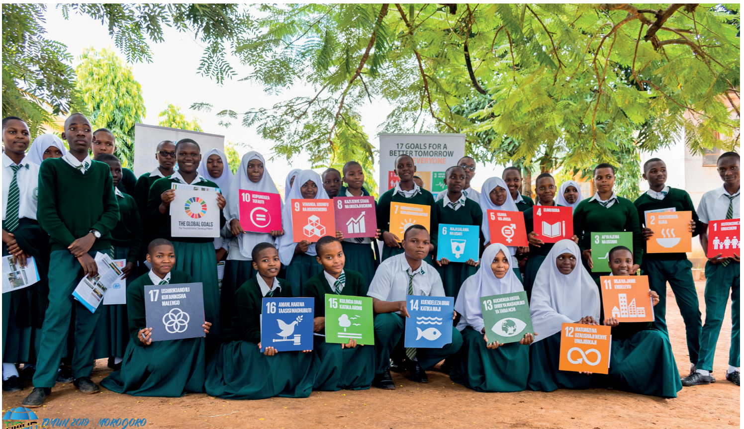
As part of this year's Tanzania International Model United Nations (TIMUN), delegates conducted SDGs outreach for Morogoro Secondary School.