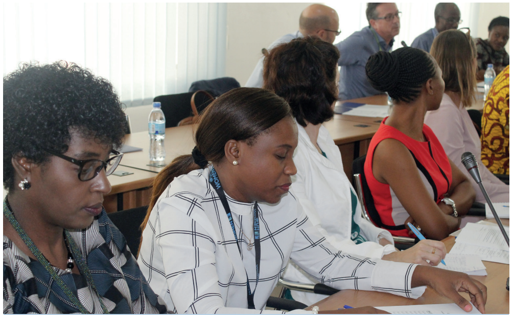
UN Officials participating at the Economic Growth and Employment Outcome Group partnership meeting.

Some 40 participants attended the meeting, including the Embassy of Sweden who supports the Outcome Group