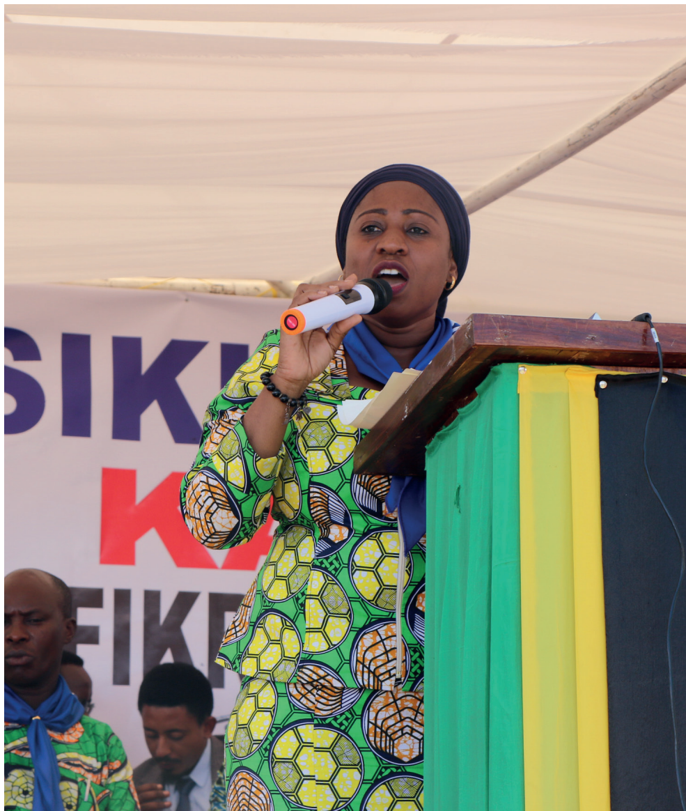
Minister of Health, Community Development, Gender, Senior and Children; Hon. Umy Mwalimu making remarks during International Women's Day Commemorations in Mwanza. She directed all local government authorities to ensure that they provide women's groups with more sizeable loans to promote women's economic empowerment.

- Ms. Hodan Addou, UN Women Country Representative