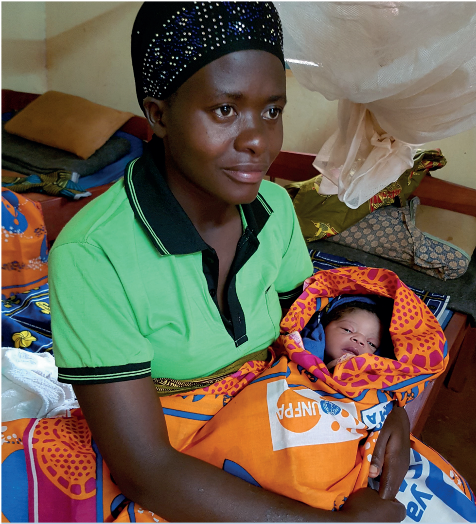
One of the women who delivered her baby at Nyarugusu health centre which is supported by the United Nations Population Fund (UNFPA) in Kigoma.