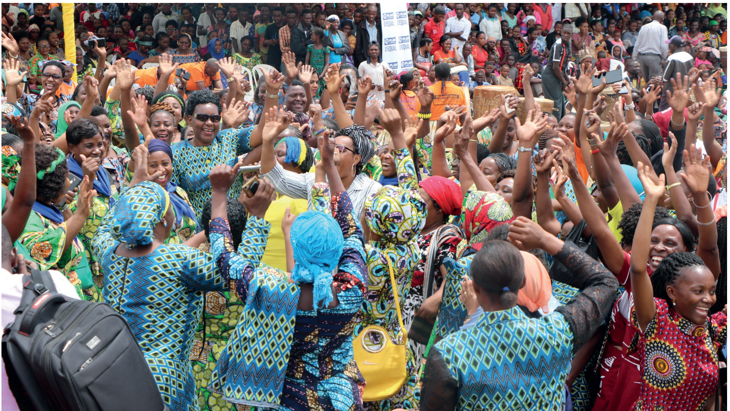
International Women's Day commemorations in Mwanza brought communities together to celebrate women and their contributions to the development of Tanzania. This year's theme was Change Mindset to Achieve Equality for Sustainable Development .