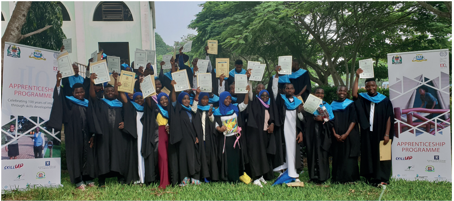
The 2017/2018 Apprenticeship graduates at the State University of Zanzibar (SUZA) on Graduation Day.

In late April, the 52 Apprentices enrolled into the Zanzibar Quality Apprenticeship programme in 2017 graduated at the State University of Zanzibar (SUZA). Out of the 52 graduates, 24 received a certificate in Front Desk Operations, 16 in Food Production and Bakery, and 12 in Housekeeping Operations. The graduates are set for more gainful employment as 33 of them have already secured jobs at various hotels and resorts even before graduating.