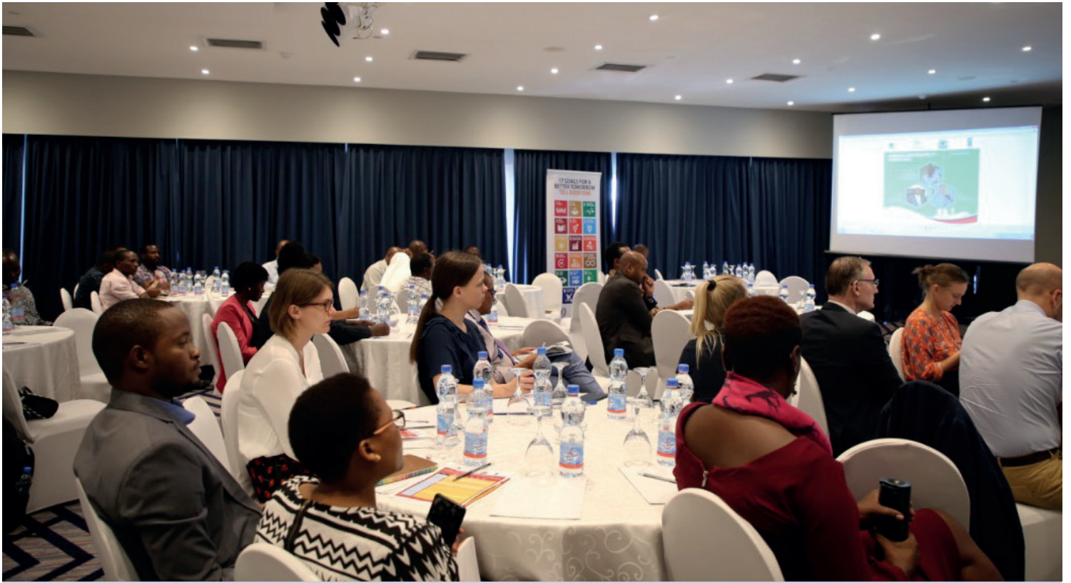
Delegates from Private Sector, Civil Society, youth institutions, development partners at the VNR workshop.