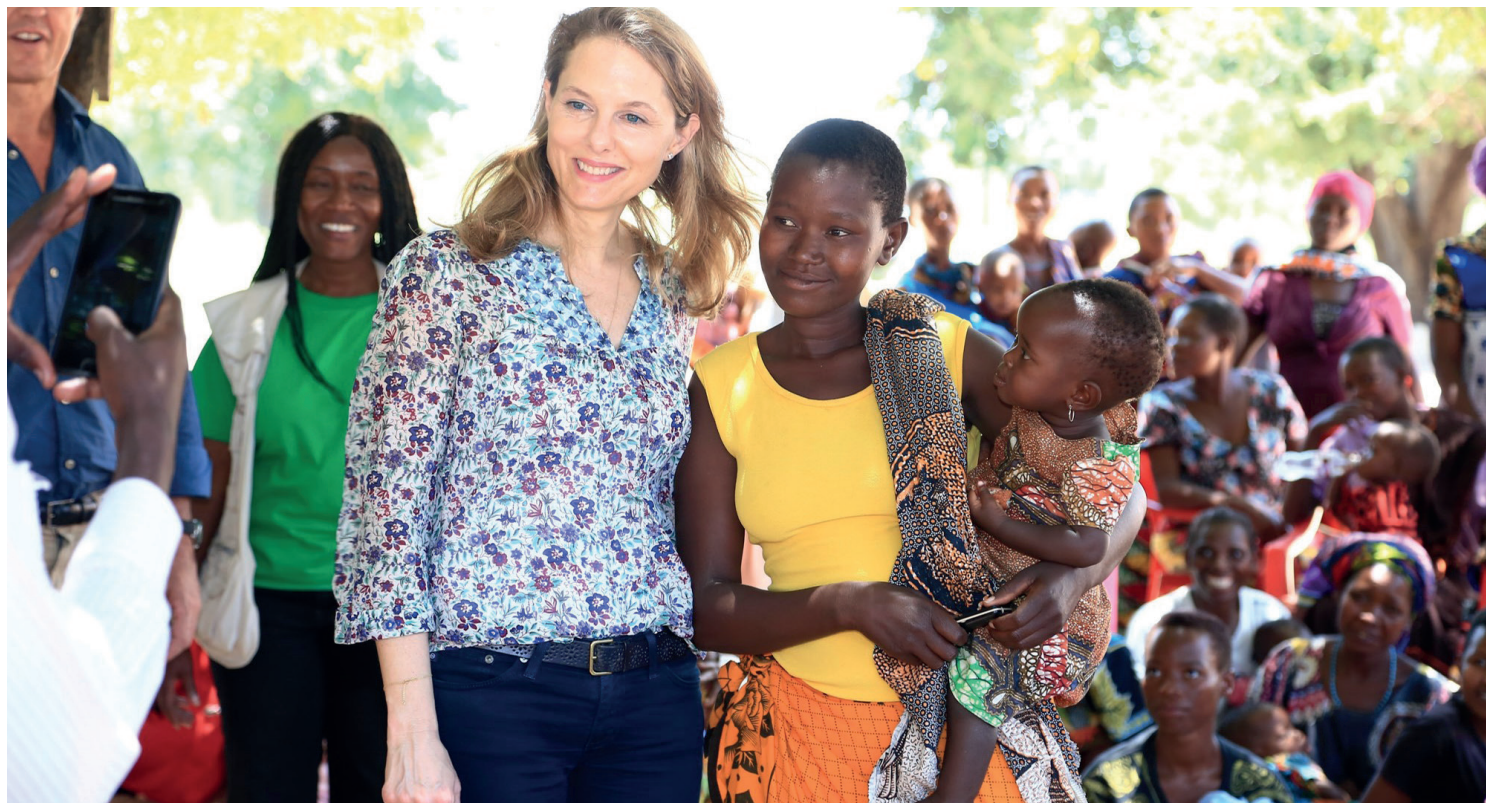
World Food Programme (WFP) Special Advisor, Her Royal Highness Princess Sarah Zeid (left), visiting beneficiaries of the European Union funded 'Boresha Lishe' Nutrition project in Dodoma.

In late March, the World Food Programme (WFP) hosted a visit from Her Royal Highness (HRH) Princess Sarah Zeid of Jordan. Princess Sarah is special adviser on maternal health for WFP and an advocate for good nutrition in a child's first 1000 days.