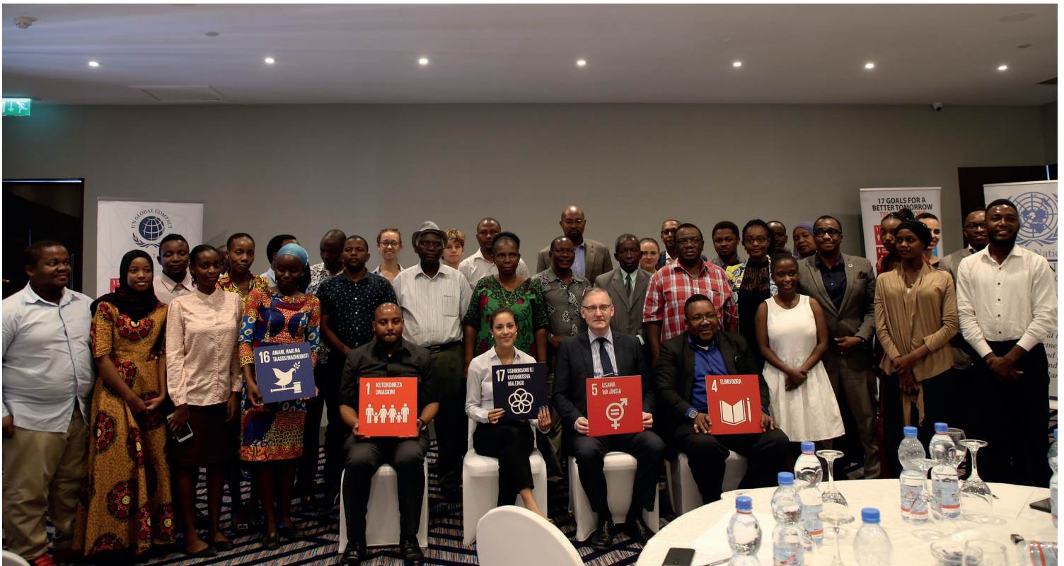
Government, and UN officials take a group photo with the stakeholders from civil society during the Voluntary National Review (VNR) consultation that took place in Zanzibar in March.