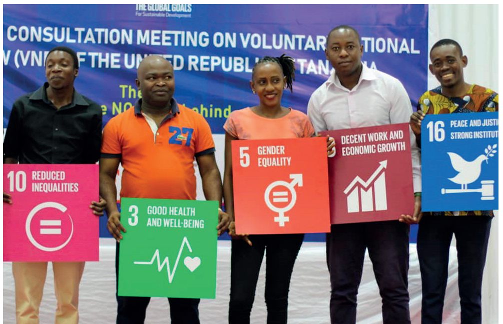
The Voluntary National Review (VNR) Youth Consultation on SDGs brought together young people to get their inputs on SDGs implementation.

The consultation was organized by the United Nations Population Fund (UNFPA) in collaboration with the United