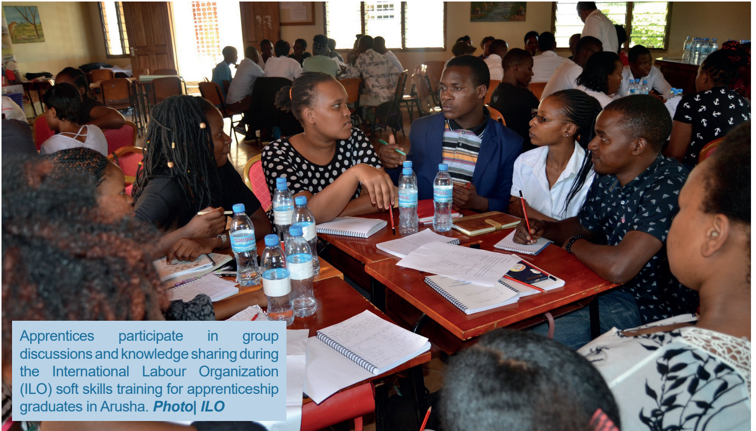
Apprentices participate in group discussions and knowledge sharing during the International Labour Organization (ILO) soft skills training for apprenticeship graduates in Arusha.

The International Labour Organization (ILO) in collaboration with the Ministry of tourism and Natural Resources, the National College of Tourism (NCT), Hotel Association of Tanzania (HAT) and the Association of Tanzania Employers (ATE) conducted a follow up soft skills training workshop in Arusha in late March. The workshop is part of ILO'S drive to strengthen skills development and increase access to the job market amongst Tanzania's youth. It's also an initiative that aims to contribute towards systematic interventions to improve existing capacities of people and institutions by providing tools and experience through direct involvement.