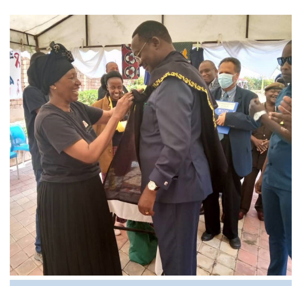
Hon. George Simbachawene, Minister of Home Affairs receiving a gift from the products made by the victims of Human trafficking.

The international community, including IOM, considers Trafficking in Persons as one of the grossest violations of human rights. It is therefore of utmost importance to take actions and respond to it effectively.