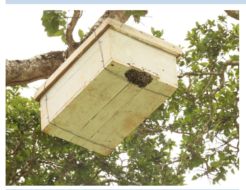
Improved fabricated beehives in Hija's plot with bee-catching hives.

part of the areabased Kigoma loint Programme (KJP), the Food and Agriculture Organization of the United Nations (FAO) recently conducted a training on 'improved beekeeping and modern beehives fabrication' to farmers and carpenters. training The aimed orienting farmers with a better understanding on how to integrate beekeeping in Climate Smart Agriculture Natural Resource and Management/conservation.