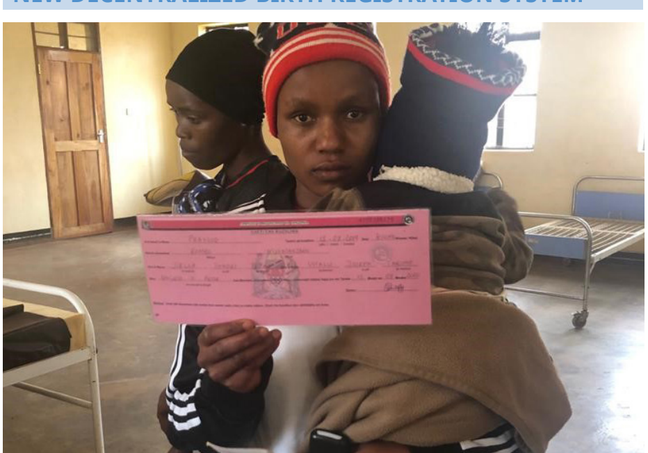
Since the Government, UNICEF and other partners launched the decentralized birth registration system in 2013, more than 5 million children have been registered.

a significant moment for Tanzania as the country managed to reach a total of 5 million children through the simplified birth registration system. The system was launched in 2013 by the Government of Tanzania in partnership with UNICEF; Tigo and with funding from the Canadian Government.