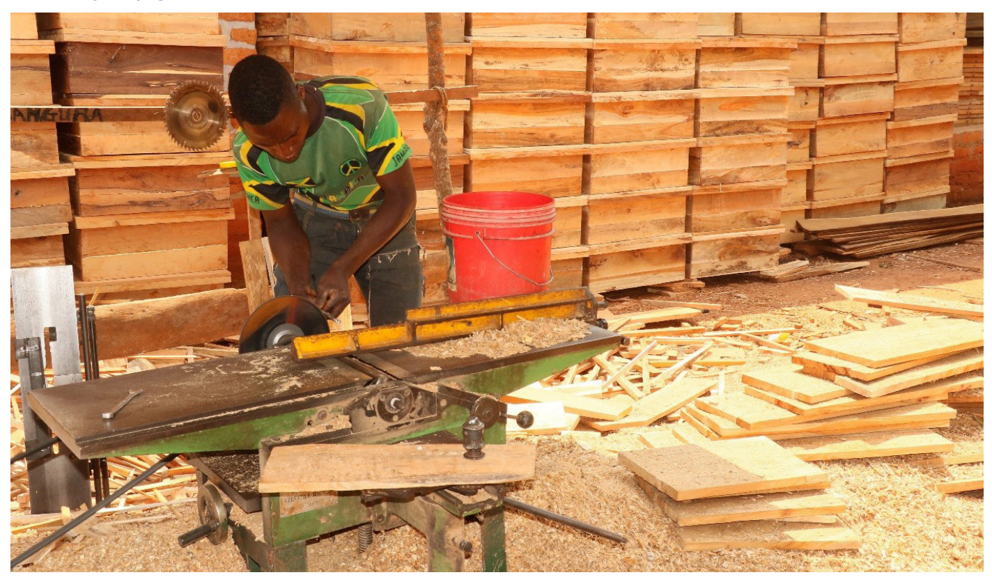
Improved fabricated beehives in Hija's plot with bee-catching hives.