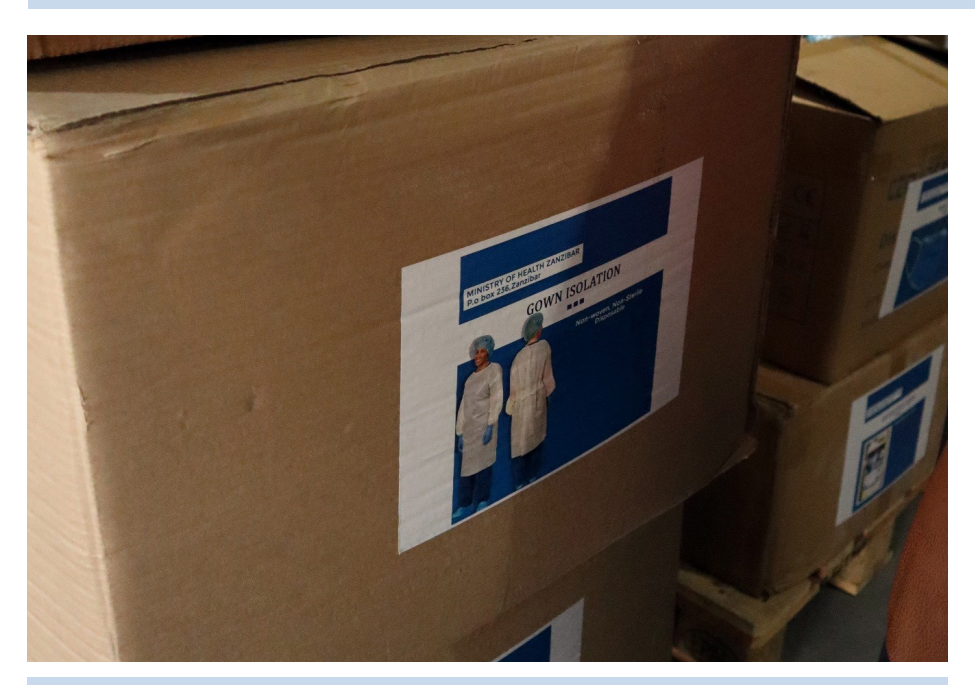
Some of the Personal Protective Equipment (PPE) that was handed over to the Government of Zanzibar by UNFPA through support from Global Affairs Canada to ensure that frontline health workers are protected as they deliver essential health services.

To support the Revolutionary Government of Zanzibar to maintain uninterrupted essential and lifesaving reproductive, maternal, newborn, child and adolescent health (RMNCAH) services and information and to ensure that frontline health workers are protected as they deliver these services – UNFPA Tanzania has handed over 300 Personal Protective Equipment (PPE) kits.