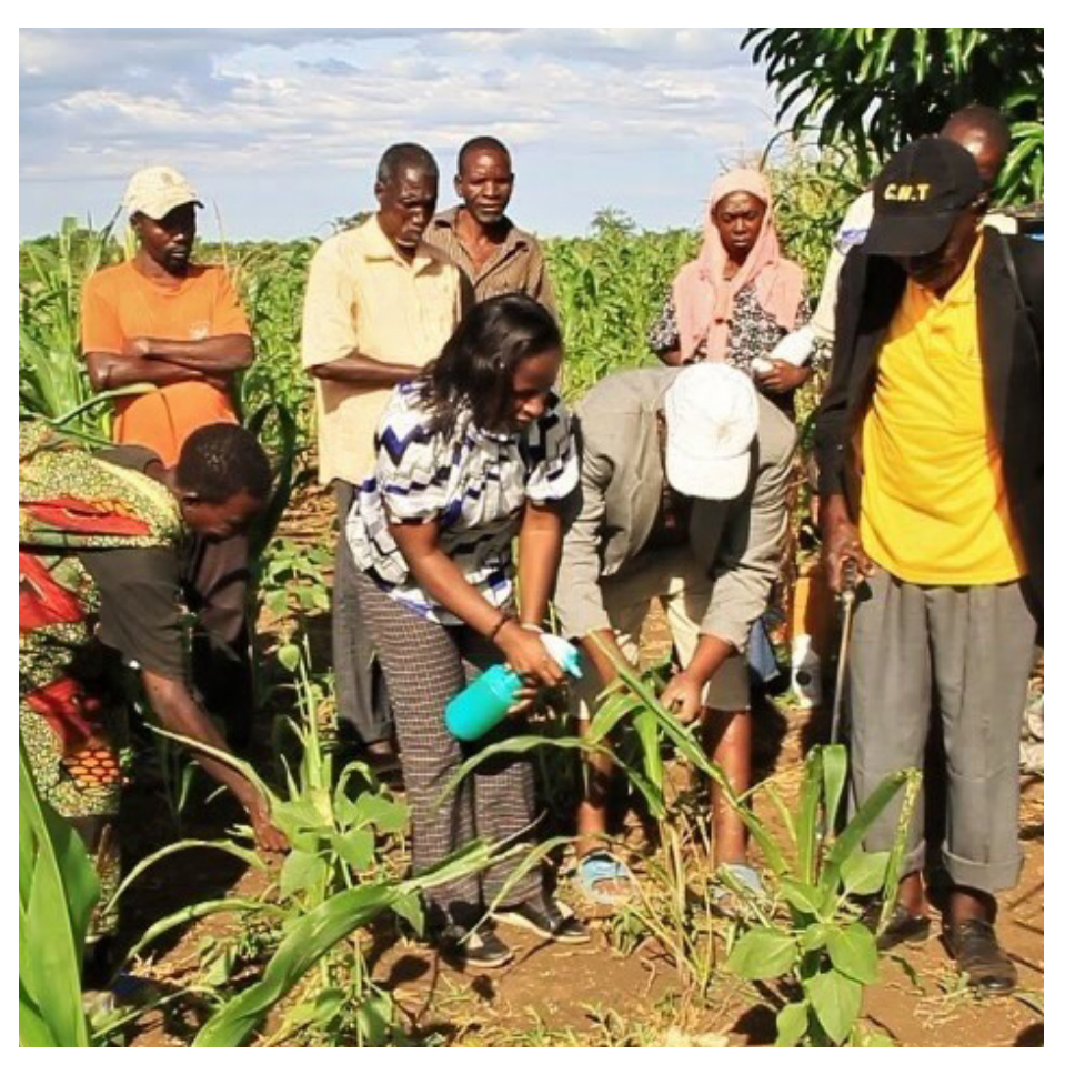
Researchers and farmers conducting Vuruga Biopesticide field testing.

armyworm (FAW) pest which due to its ability to fight FAW. threatens food security and livelihoods in Tanzania.