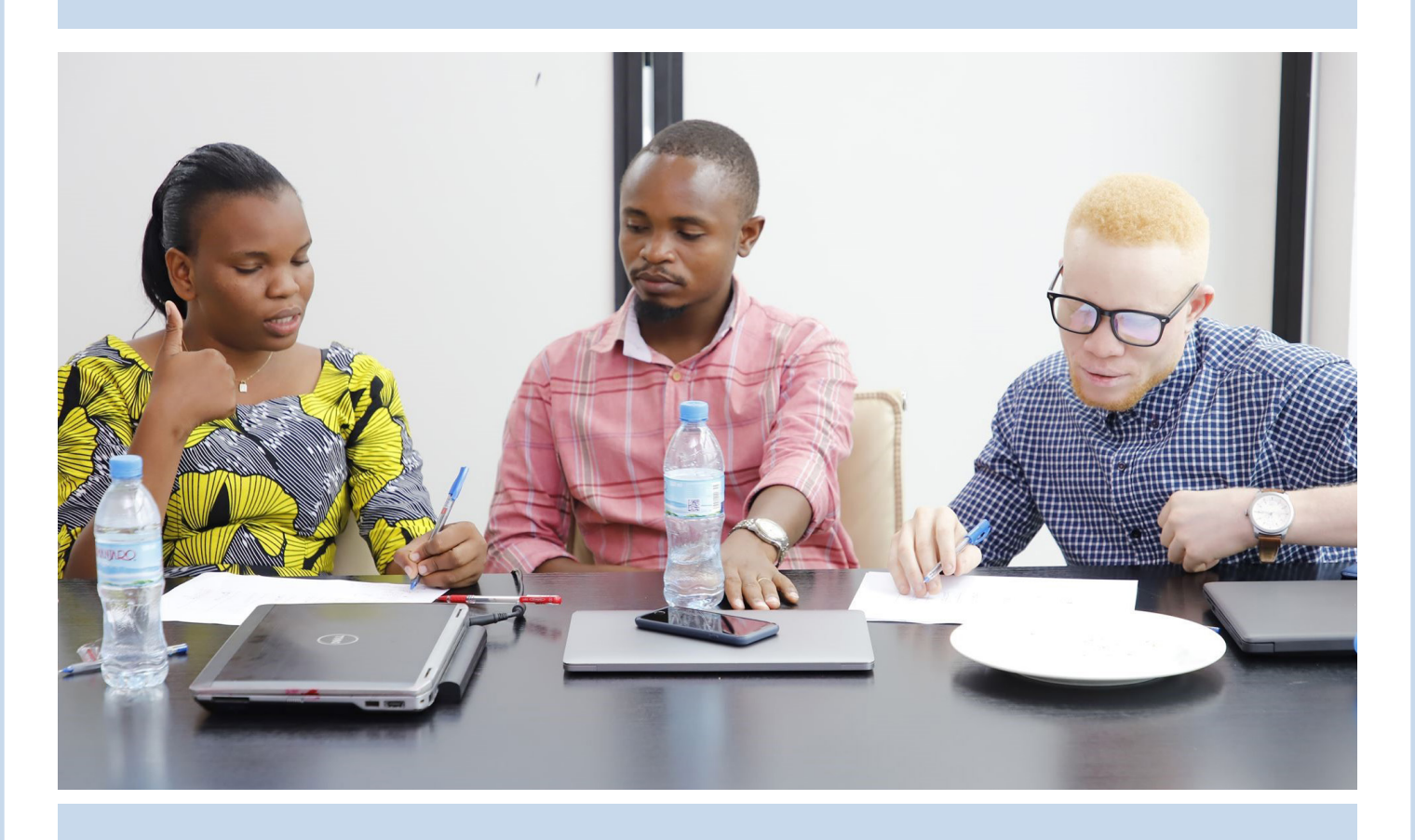
The judges were left with the difficult task of selecting four winning innovations.

Accelerator II reached the end of its start-up incubation in Tanzania climaxing with the highly anticipated virtual Demo Day. Seven teams of innovators vouth battled it out, pitching their digital solutions, products and services to a panel of judges with the hope of being awarded $6,000 of seed funding and further technical support to finetune their into sustainable products and cost-effective business solutions.