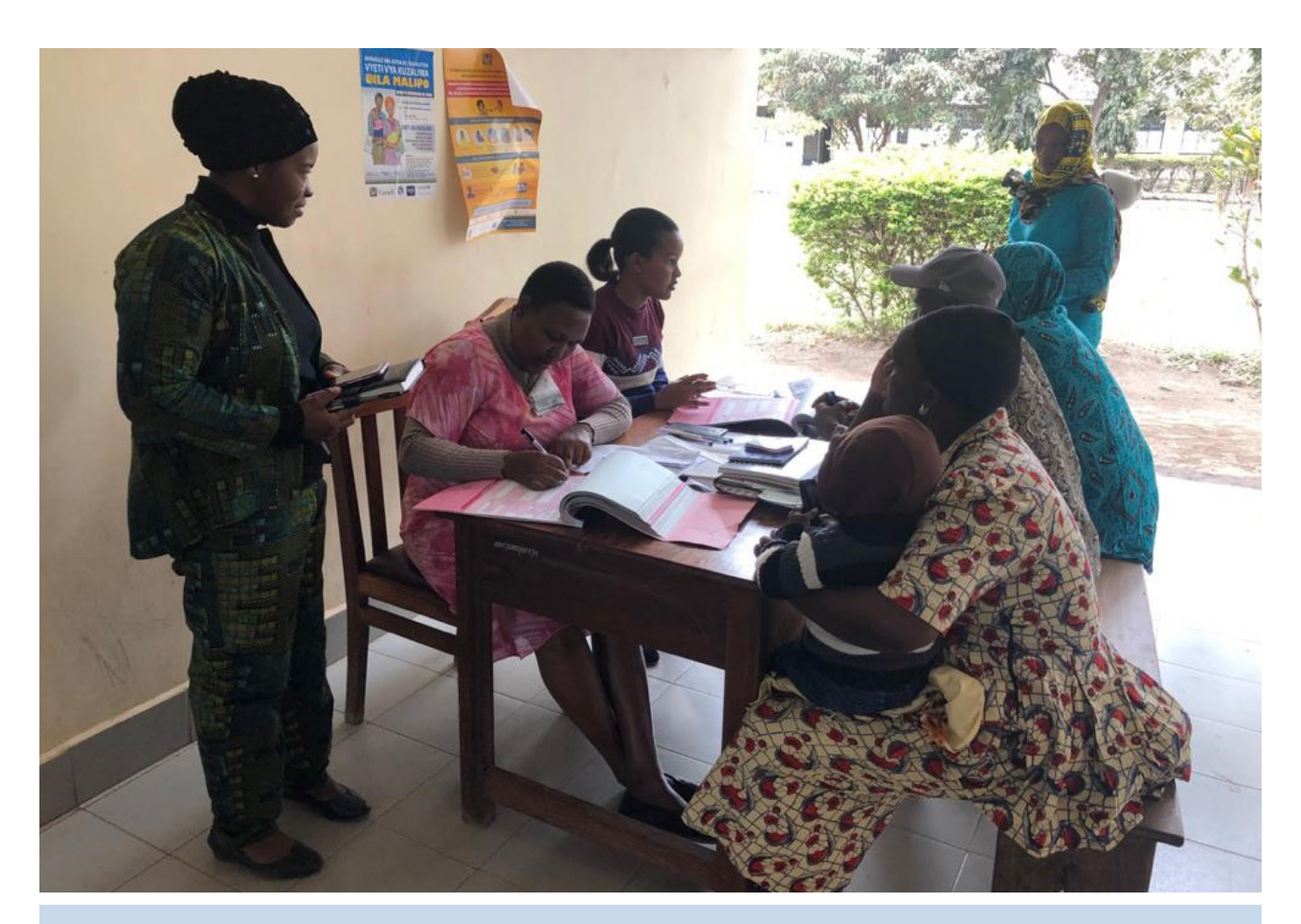
The simplified system makes birth registration more accessible to communities. Where before registration could only take place at the district headquarter for each region, not registration points, like this one in Hai district in Kilimanjaro region, are established at health facilities.

than 80% from a baseline of regions in Mainland Tanza-The progress has been quite less than 10% as per Census nia. chil- 2012. Data also suggests that dren in September 2016 to parents have saved nearly The new birth registration more than 5 million children USD8 million due to fee-waiv- system has bridged to-date; from 3 regions in ers. The new system is being rural-urban divide, improving 2016 to 18 regions today, cited as one of the best exam- access to the most marginalreaching 90 per cent or more ples of human-centered CRVS ized communities to register in every single region within design. The funding for the their children, and continues three to four months of the system has helped the Gov- to tackle gender-related barlaunch. Plans are ongoing to ernment to establish a sus- riers relating to birth regiscover all 26 regions in main-tainable model of birth reg-tration. It addresses the core istration aimed at reaching issues of 'accessibility' and more than 5 million girls and 'affordability' which has been The rollout of the new sys- boys under the age of five a major barrier in the birth tem has helped raise the in 18 regions. The funds will registration system in Tanzaoverall certification rate for also be used to replicate the nia.