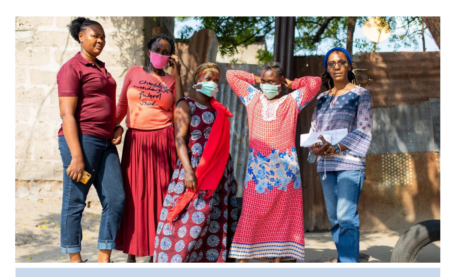
A group of women and coordinators from the Tanzania Network for People who Use Drugs (TaNPUD).