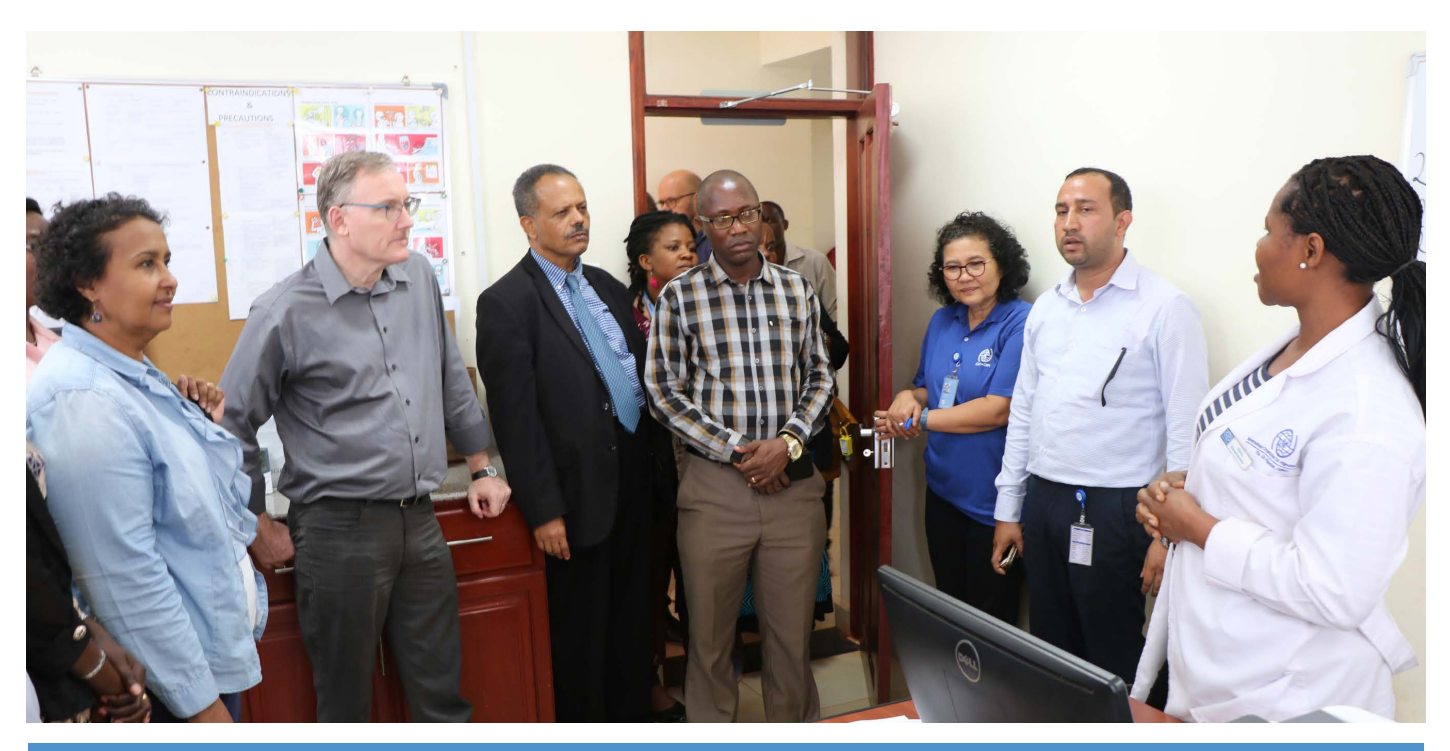
Here the delegation is being given a tour of the International Organization for Migration (IOM) Refugee Processing Centre in Kasulu District. The centre has Interview, Medical, Cultural Orientation, & other units & is set up to relocate 50,000 refugees to America, Canada & Australia by 2027. After this ten-year period, it will be handed over to the government.