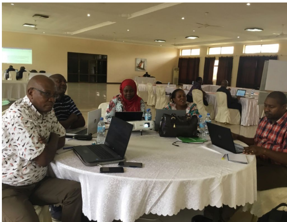
Team of technical experts from Ministry of Health reviewing the SOPs 3.

IOM Tanzania works closely with the UN agencies and has recognized Points of Entry (PoE) Pillar Lead within the UN Response to public health events in the country. Specifically, IOM Tanzania provides leadership on strengthening PoE surveillance, Infection Prevention, and Control (IPC) and Water, Sanitation and Hygiene (WASH) measures, in addition to supporting the Risk Communication and Community Engagement (RCCE) and Logistics Pillars.