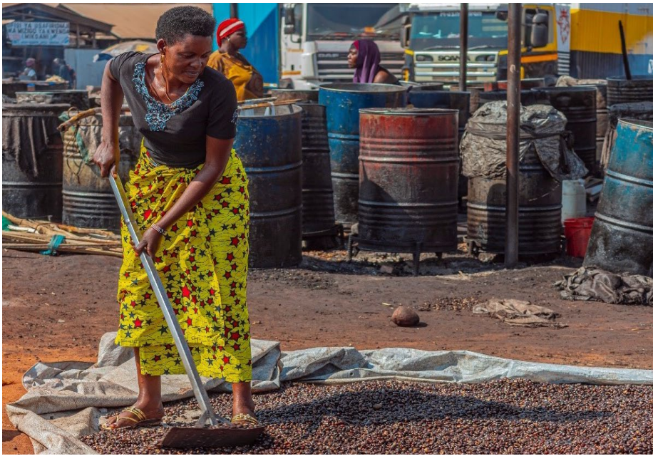
A woman trader from SIDO drying kernel nuts using sun dryer ready for oil processing before UNCDF support.

Historically palm tree has been traditional crop in Kigoma, it produces palm oil for cooking and kernel oil for soap manufacturing. In Kigoma Ujiji Municipality that is where SIDO industrial park situated, most of the kernel produced in Kigoma rural are processed at SIDO, it is estimated that 3 Kg of kernel nuts make 1 liter of oil. It takes 4-7 days for an aggressive woman to dry 660 kg of kernel which produce 220 liter of oil, daily capacity at the park is 3 tons per day per one machine. UNCDF through Kigoma Joint Programme supported SIDO industrial park to completely transform how the kernel nuts are dried and clarified by providing a modern machinery for drying