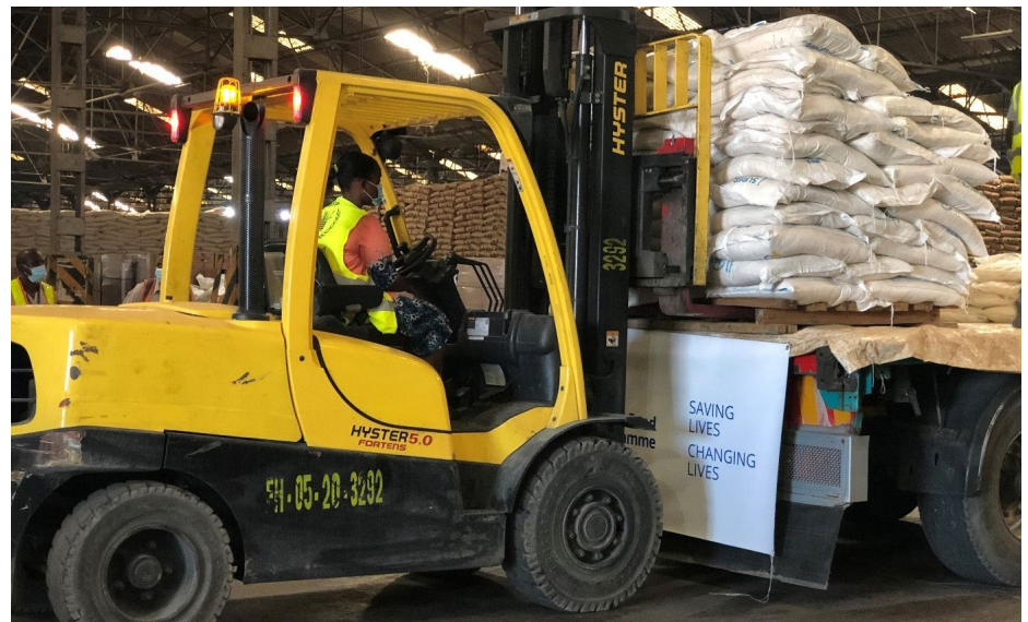
A port official, loading food assistance at the WFP Dar port from Korea donation’s to refugees’ operations.