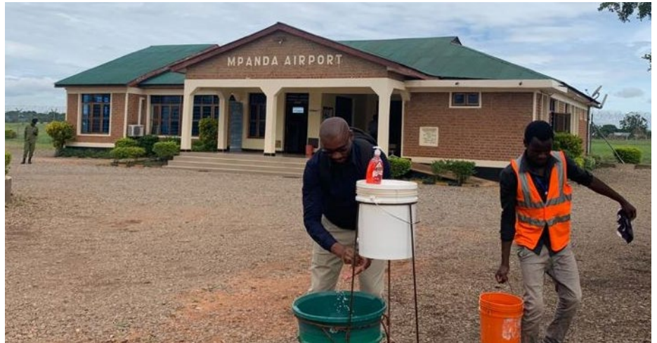
Observance of infection control and prevention protocol at points of entry is critical for breaking the circle of transmission of infectious diseases including COVID-19.

With the rise in frequency and urgency of infectious disease alerts across borders and locally, the Ministry of Health Community Development Gender, Elderly and Children (MOHCDGEC) has been working with the World Health Organization (WHO) and partners to improve surveillance at points of entry (POE) at ports, airports and ground crossings.