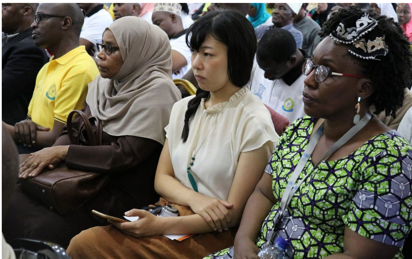
Participants of the WAD commemorations in Zanzibar including representatives from the government, and UN agencies.