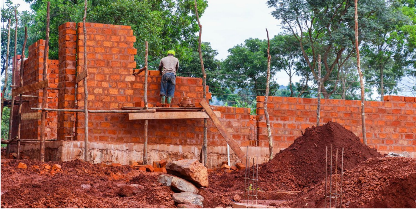
Ongoing construction of the Kabingo aggregation centre, under the agriculture theme of the Kigoma Joint Programme.