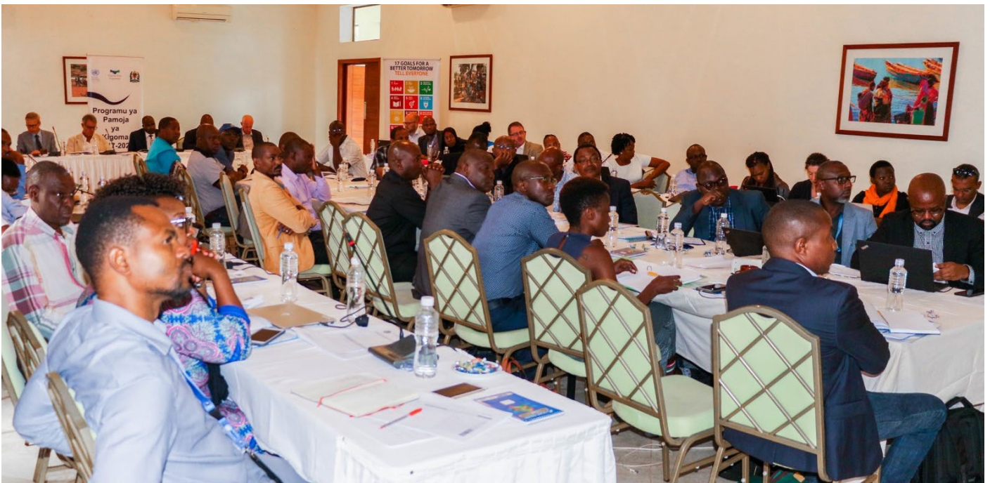
Members of the Steering Committee following up on the presentations of implementation status of the Kigoma Joint Programme.