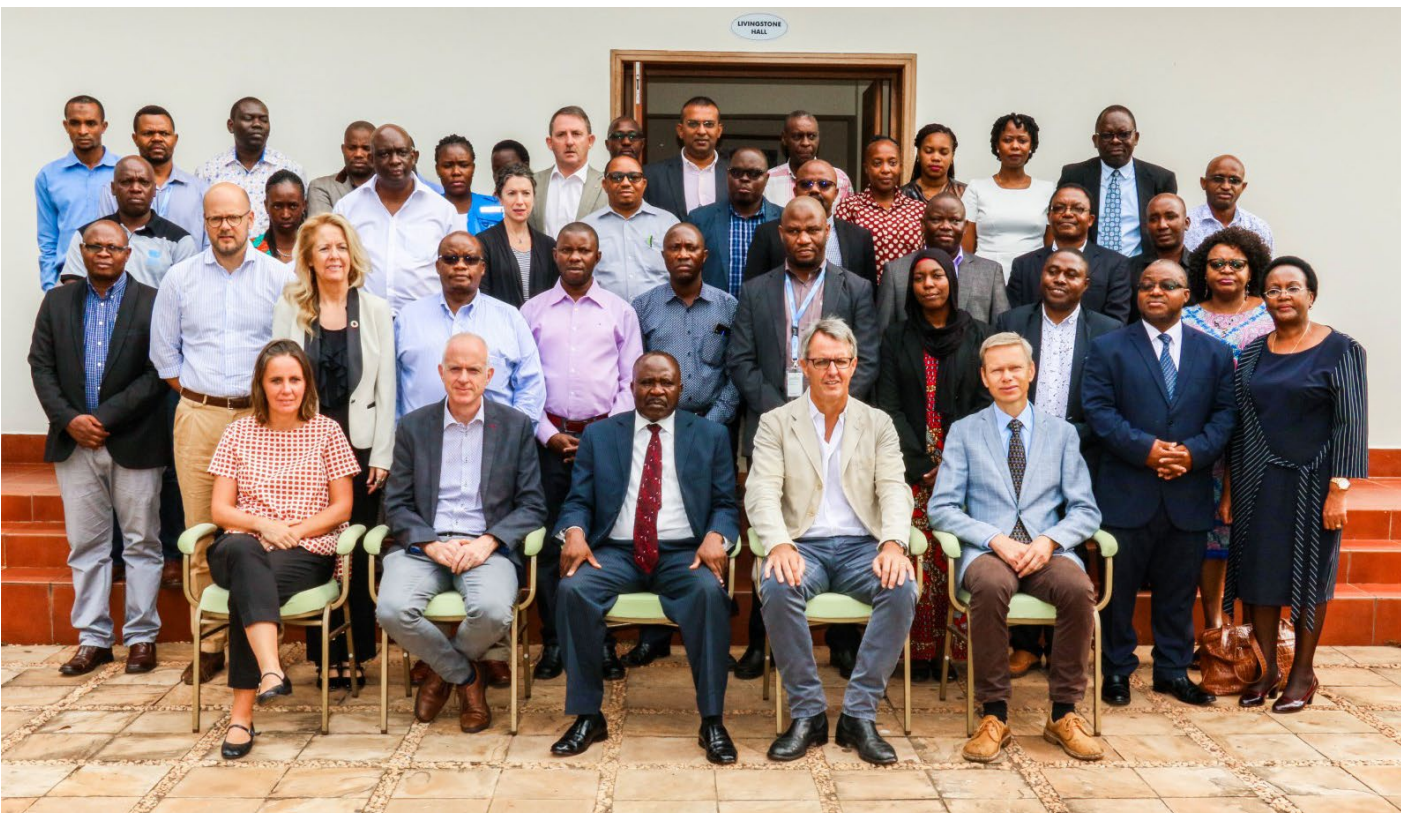
A group photo of the delegation (Officials from Irish, Norwegian and Swedish Embassy, government, and United Nations) during the Steering Committee which took place in Lake Tanganyika Hotel, in Kigoma Town.