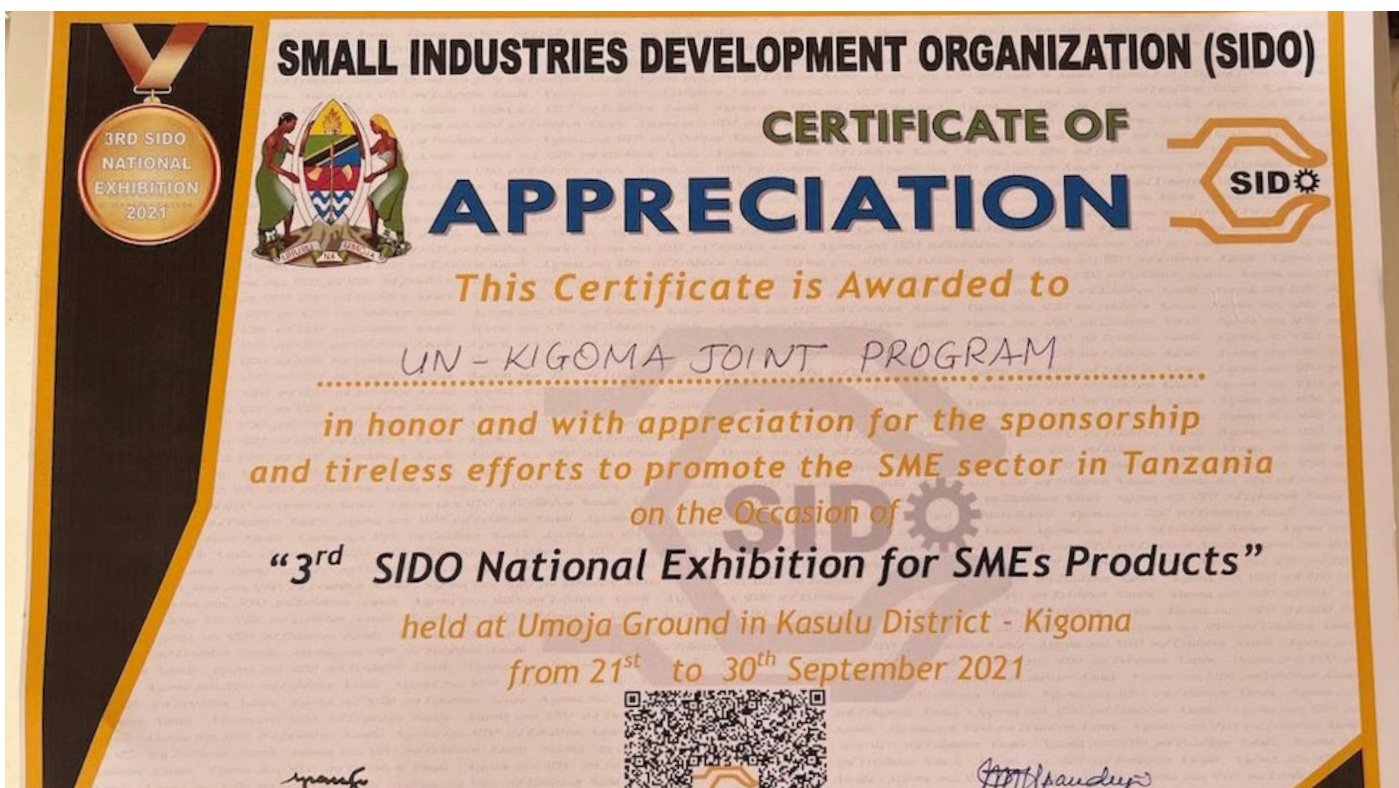
A Certificate of Appreciation given to the Kigoma Joint Programme for its support to facilitate the 3rd SIDO National Exhibition for SMEs.