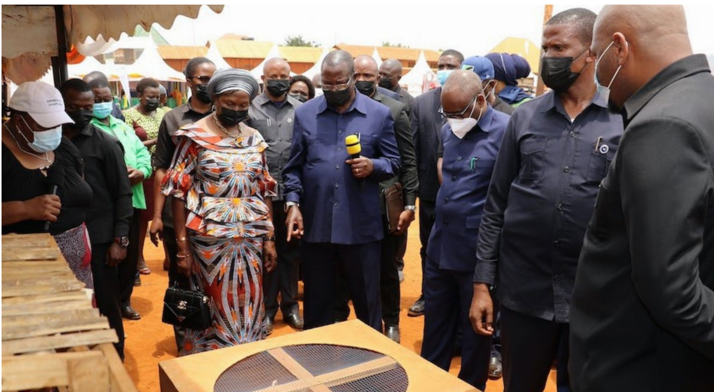
The Vice President inquiring on the capacity of the chick brooding technology and if the technology can be scaled up and implemented at the national level.