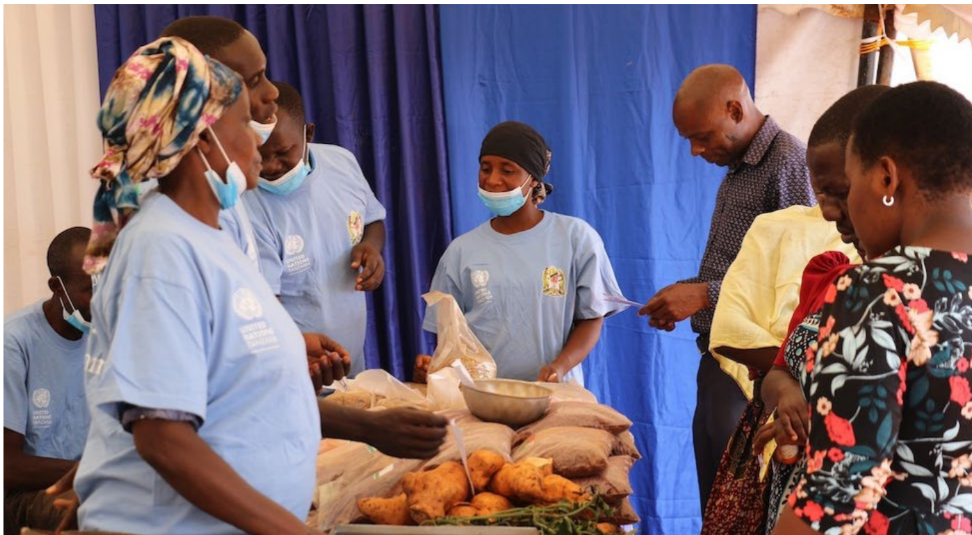
Beneficiaries under the Kigoma Joint Programme briefing visitors on their products, as a result of capacity building activities on seed production at QDS grade(Quality Declared Seed) under the supervision of Tanzania Official Seed Certification Institute. The produced seeds were graded as 98% pure seed with 99% germination rate.