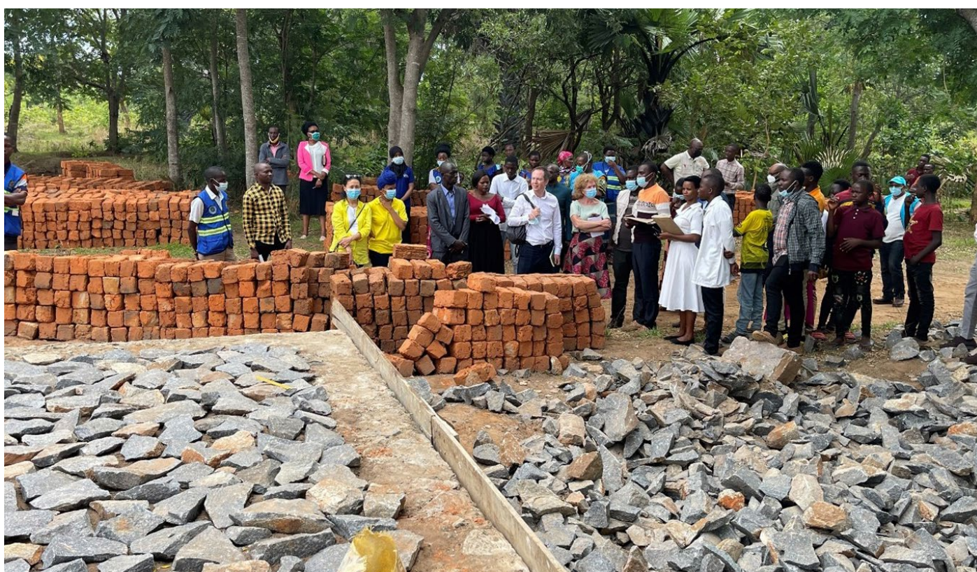
Delegates from the Embassy of Ireland and UN agencies getting updates on the ongoing construction of the maternity wing at Mtego wa Noti in Uvinza District.