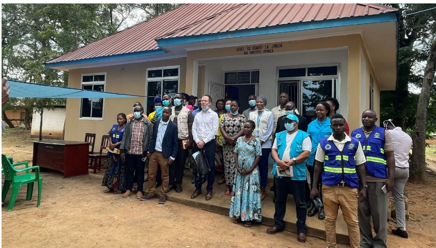
Delegates from Embassy of Ireland along with District government officials at the Police Gender and Children Desk in Uvinza District, Kigoma