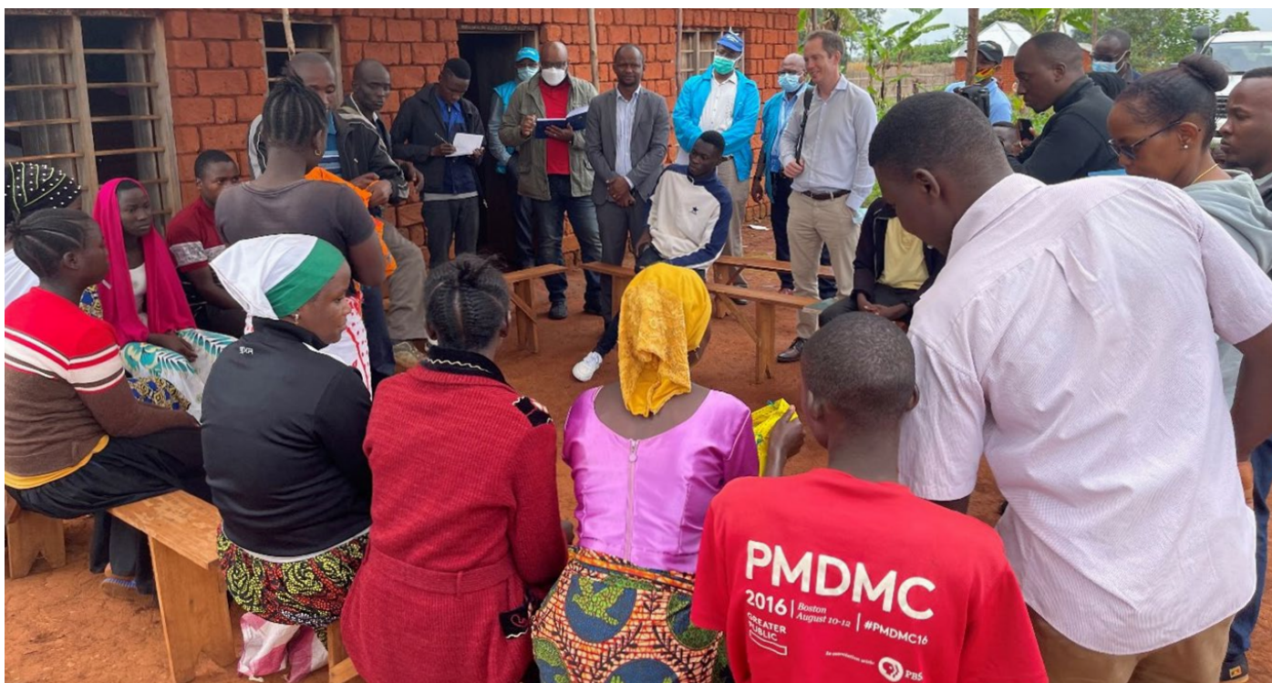
Beneficiaries of a Cash Plus Programme exchanging ideas with the Irish delegation.