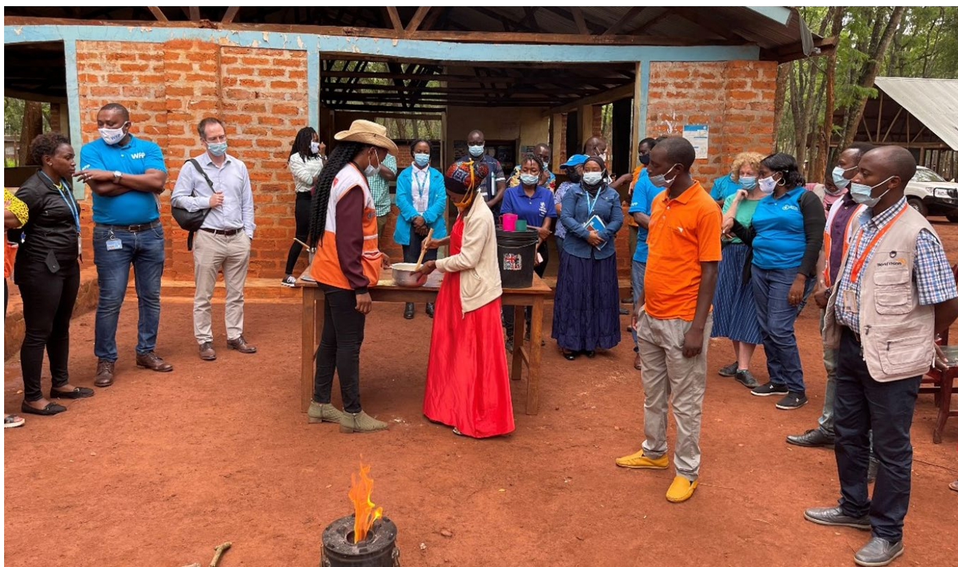
A Nutritionist from World Vision and a Refugee Parent demonstrating preparations of a super cereal plus to parents with children with severe malnutrition as part of a supplementary feeding programme to treat moderate acute malnutrition, prevent severe acute malnutrition, prevent chronic malnutrition (stunting), and addressing micronutrient deficiencies amongst children.