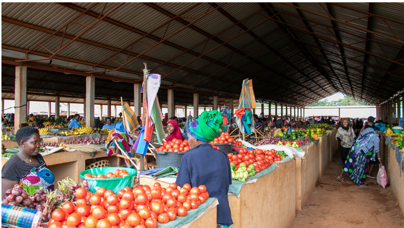
Women entrepreneurs displaying their products on the new stalls which provides a clean and safe environment.