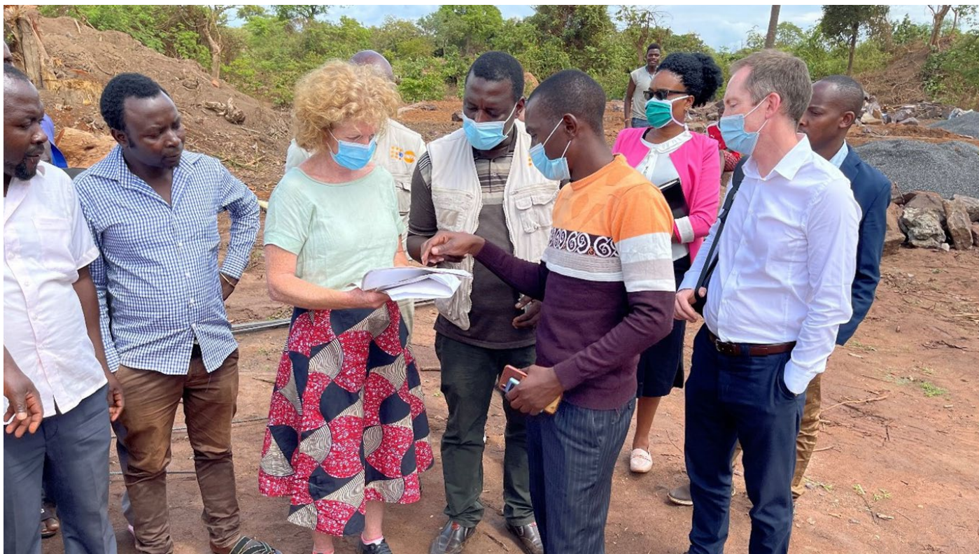
Kigoma Regional Commissioner (center) commended the Kigoma Joint Programme for its support to Kigogo village. "Apart from providing safe and clean water, the Kigogo project also improves protection of women and children against violence by bringing water supply near their houses," he said.