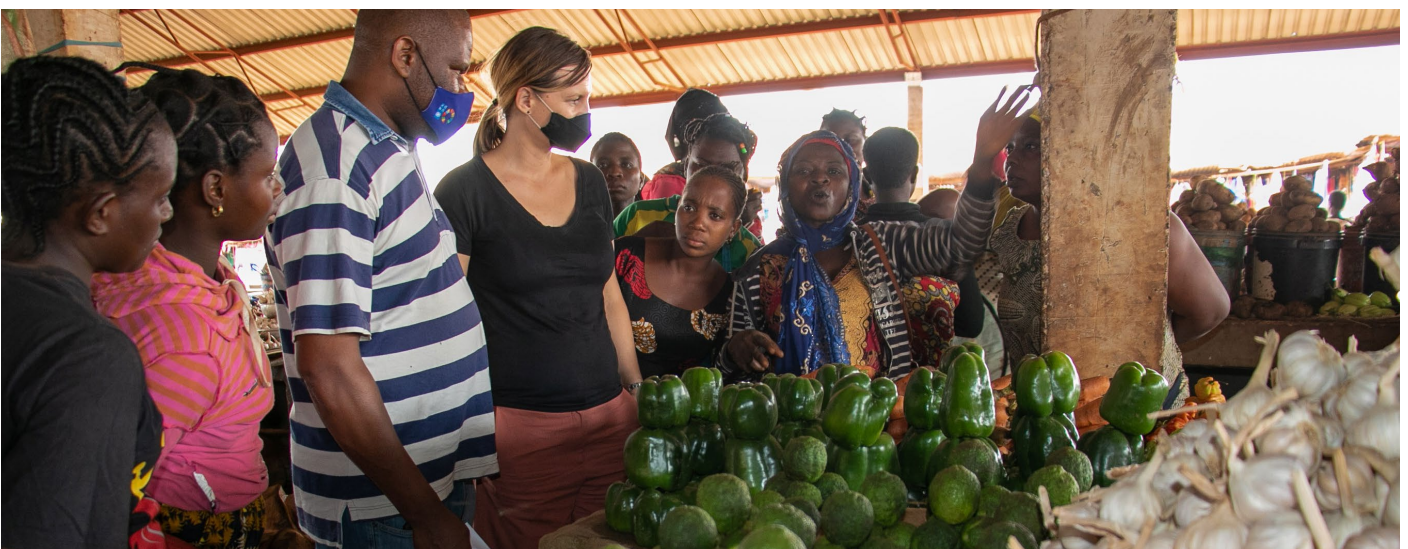
"Now we have an improved and hygienic environment to sell our vegetables and fruits." said one of the women entrepreneurs at Sofya market while briefly explaining the benefits gained after construction of market stalls.