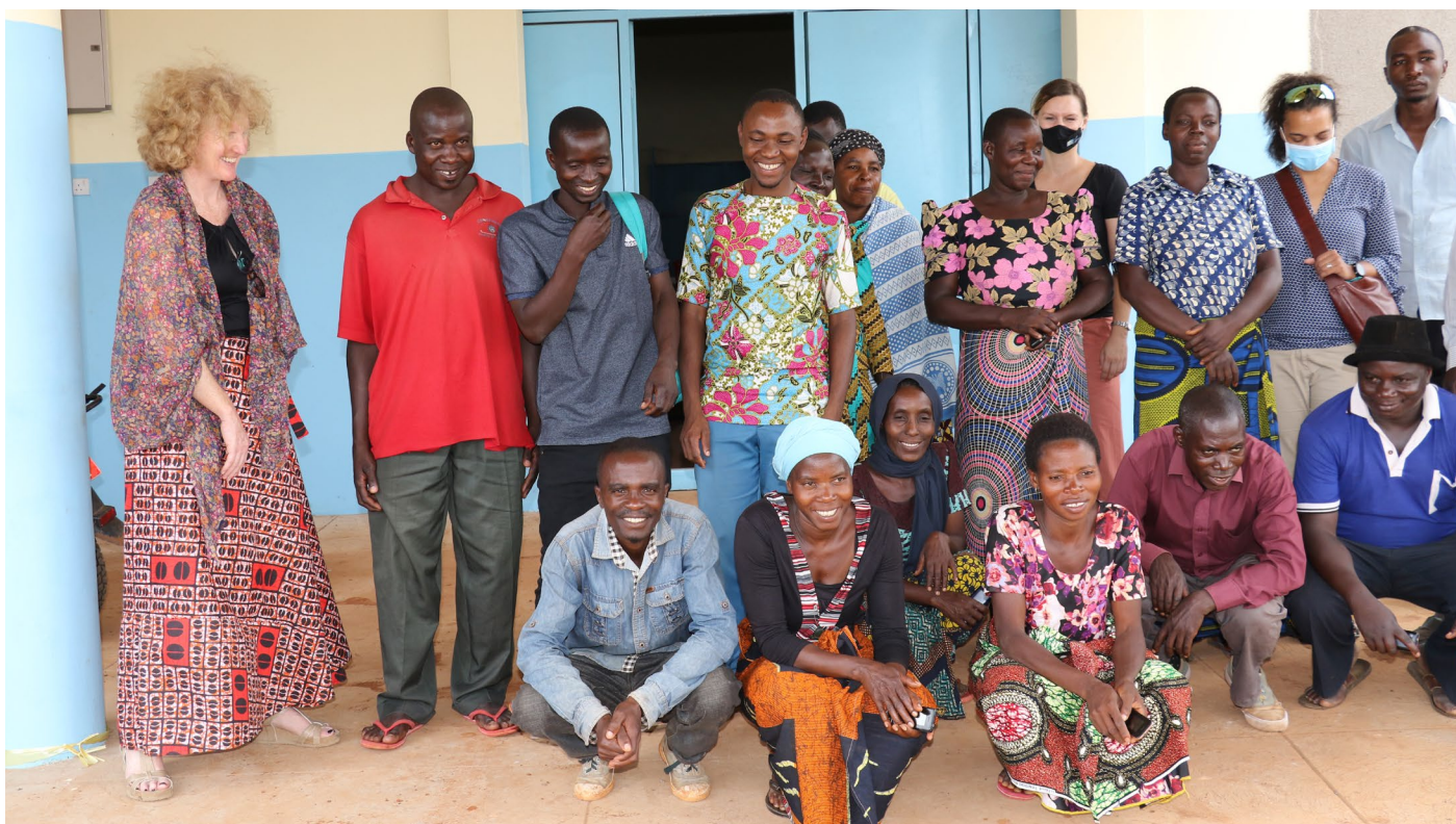
Some members of Mvugwe AMCOS in a group photo with Embassy delegation.