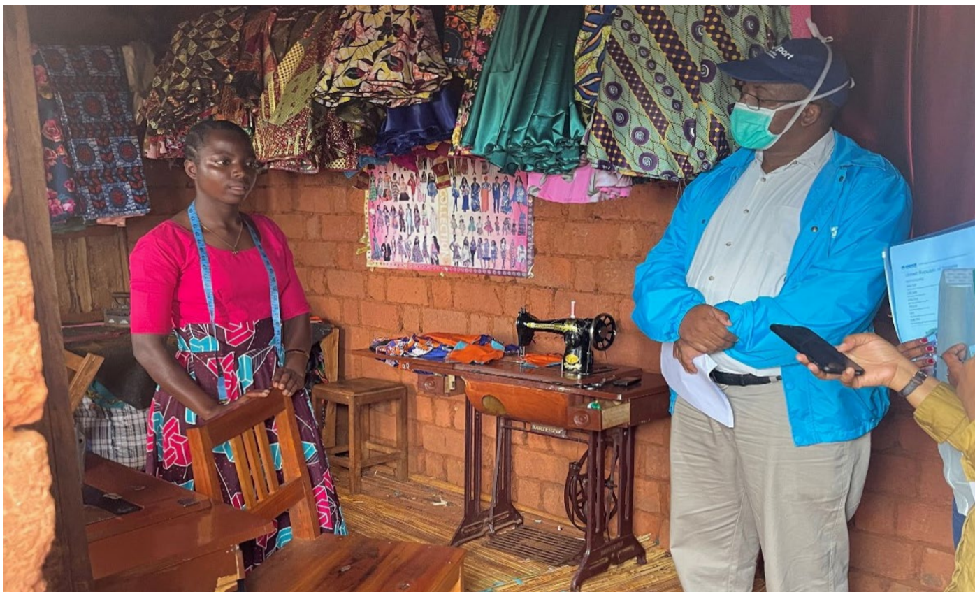
A beneficiary of Cash Plus Programme briefing mission members on positive impact of the programme in improving adolescents' income. So far, the Cash Plus programme has reached a total of 3491 adolescents with Livelihood enhancement and Sexual reproductive health and HIV training.