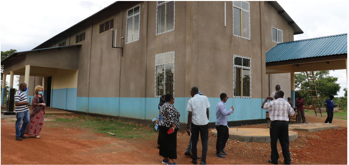
The delegation touring the completed Mvugwe Aggregation Center

Mvugwe aggregation centre which was constructed as part of the Kigoma Joint Programme (KJP), is capable of storing 640 tonnes of crops and will help farmers in Mvugwe village reduce post-harvest losses. The center will benefit more than 4000 women and 3000 youths are engaged in selling and cultivating maize, beans, rice, banana, cassava, and fruits.