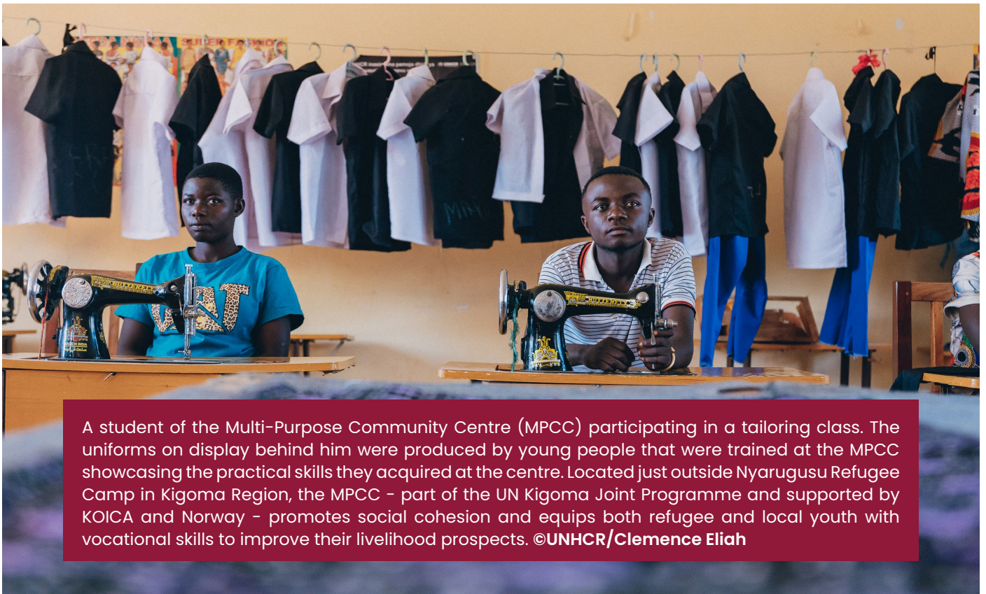
A student of the Multi-Purpose Community Centre (MPCC) participating in a tailoring class. The uniforms on display behind him were produced by young people that were trained at the MPCC showcasing the practical skills they acquired at the centre. Located just outside Nyarugusu Refugee Camp in Kigoma Region, the MPCC - part of the UN Kigoma Joint Programme and supported by KOICA and Norway - promotes social cohesion and equips both refugee and local youth with vocational skills to improve their livelihood prospects.

21,000 households in seven water-challenged villages across Dodoma, Singida, and Mwanza regions have been empowered with access to clean and safe water by drilling boreholes equipped with solar-powered pumps. Besides household use, the new water supply will invigorate agricultural and livestock-keeping activities, thereby amplifying food production and nutrition. It will stimulate the cultivation of high-value fruit trees, including orchards, presenting income opportunities for local youth engaged in group production, marketing, and savings schemes.