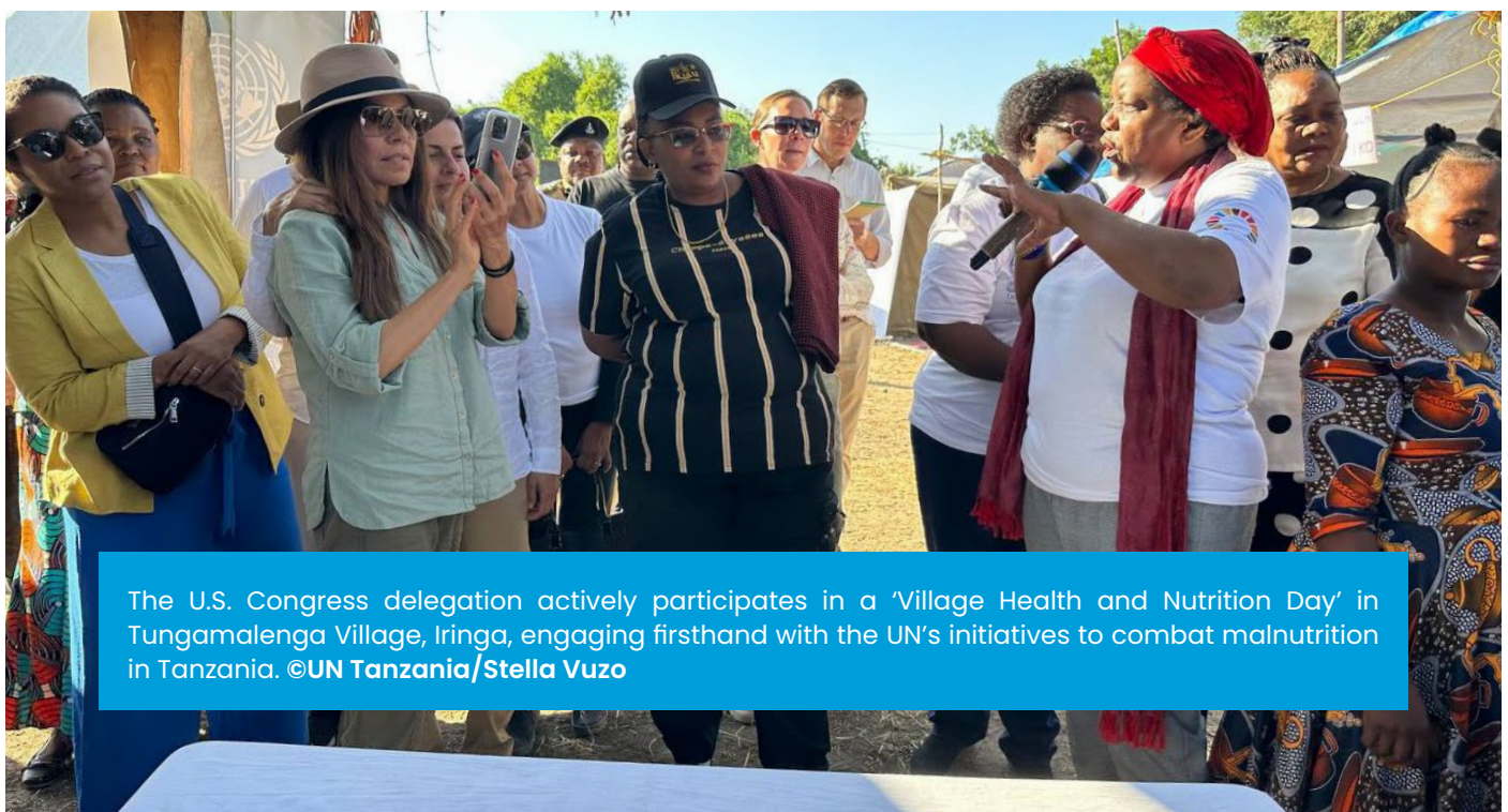
The U.S. Congress delegation actively participates in a ‘Village Health and Nutrition Day’ in Tungamalenga Village, Iringa, engaging firsthand with the UN’s initiatives to combat malnutrition in Tanzania.