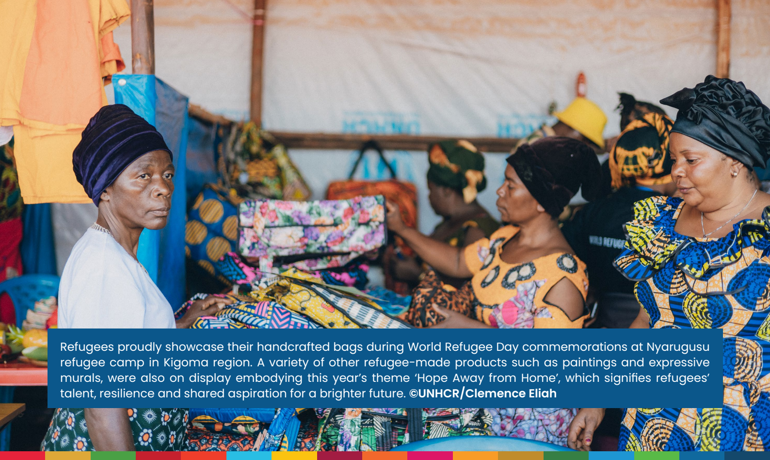
Refugees proudly showcase their handcrafted bags during World Refugee Day commemorations at Nyarugusu refugee camp in Kigoma region. A variety of other refugee-made products such as paintings and expressive murals, were also on display embodying this year's theme 'Hope Away from Home', which signifies refugees' talent, resilience and shared aspiration for a brighter future.