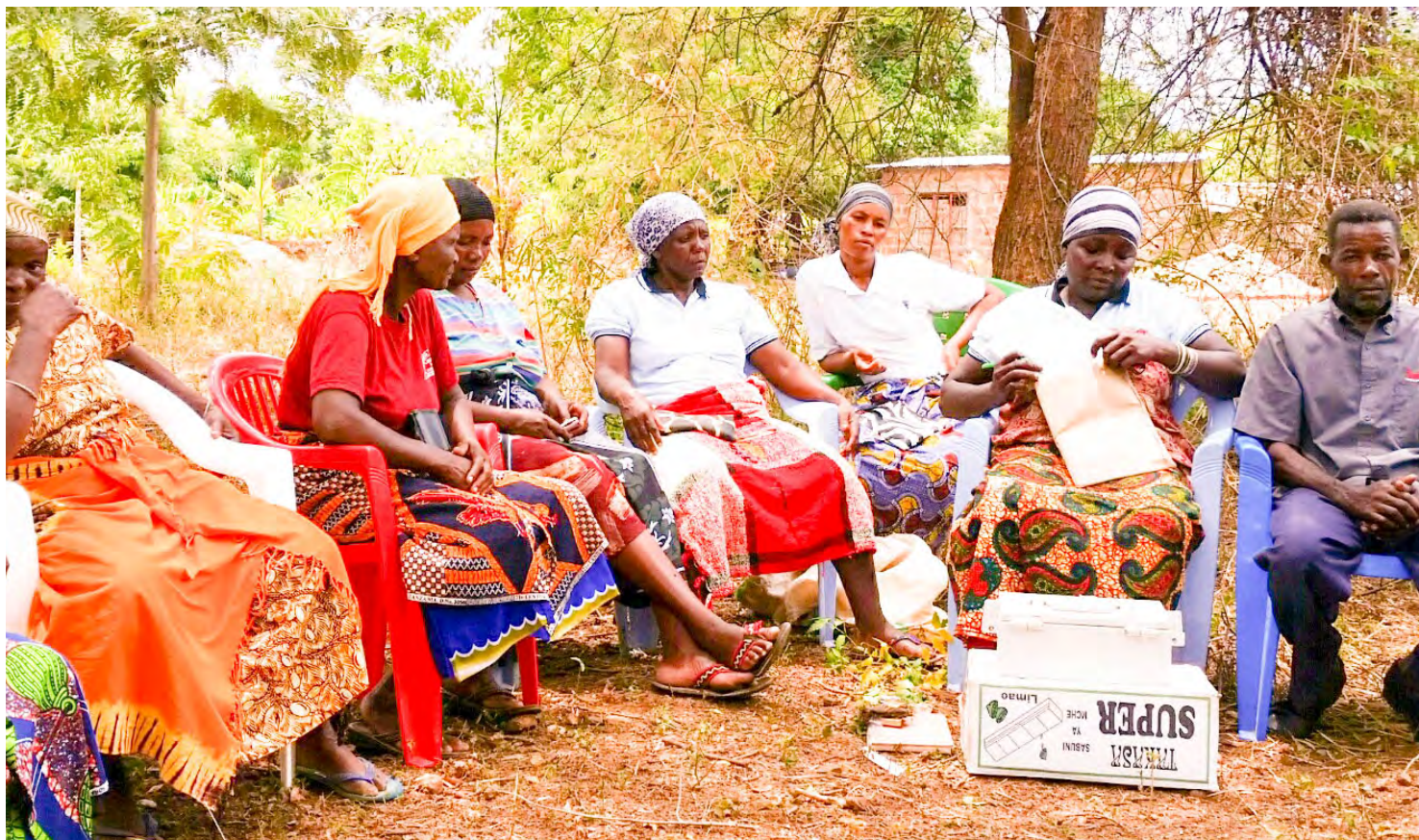
A meeting of one of the women's groups that are part of UNCDF's MircoLead programme.

From 2013 to 2017, the United Nations Capital Development Fund (UNCDF)'s MicroLead programme supported Tanzania's Mwangi Community Bank (MCB), a regional bank serving the Kilimanjaro region, to link informal savings groups to the regional bank. Even though MicroLead funding and technical assistance ended in 2017, the bank continues to expand its work with informal groups.