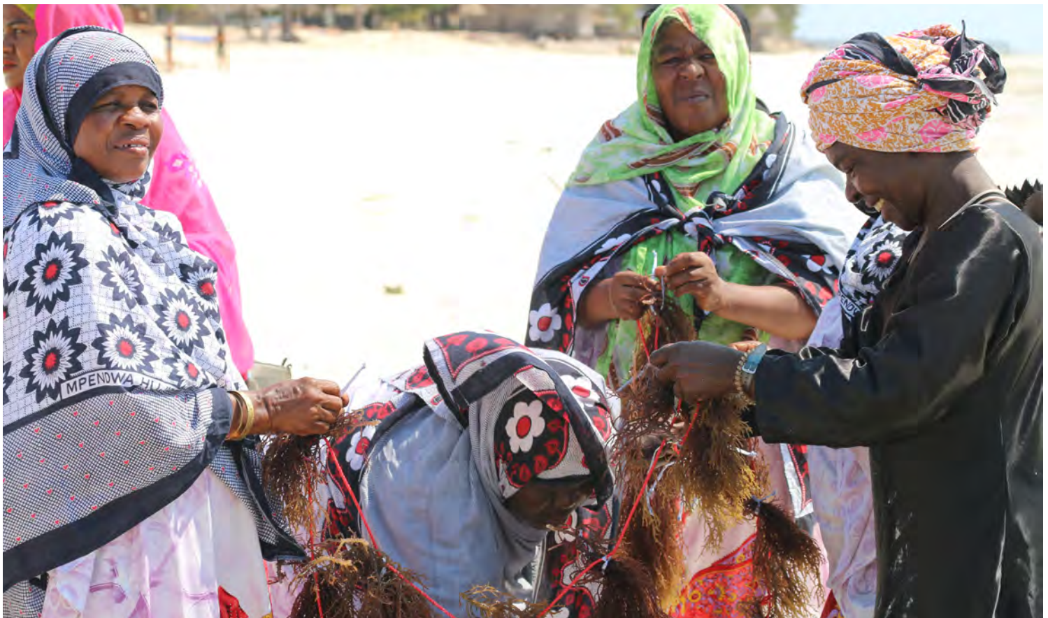
A group of women seaweed farmers demonstrate how they prepare seaweed for planting.