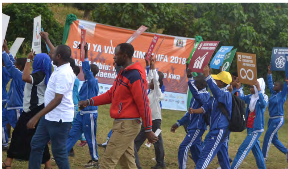
A procession of youth advocate for the Global Goals during International Youth Day celebrations in Tengeru, Arusha. Government and UN officials emphasized that youth participation in development is crucial for achievement of national and international development agendas including the SDGs.