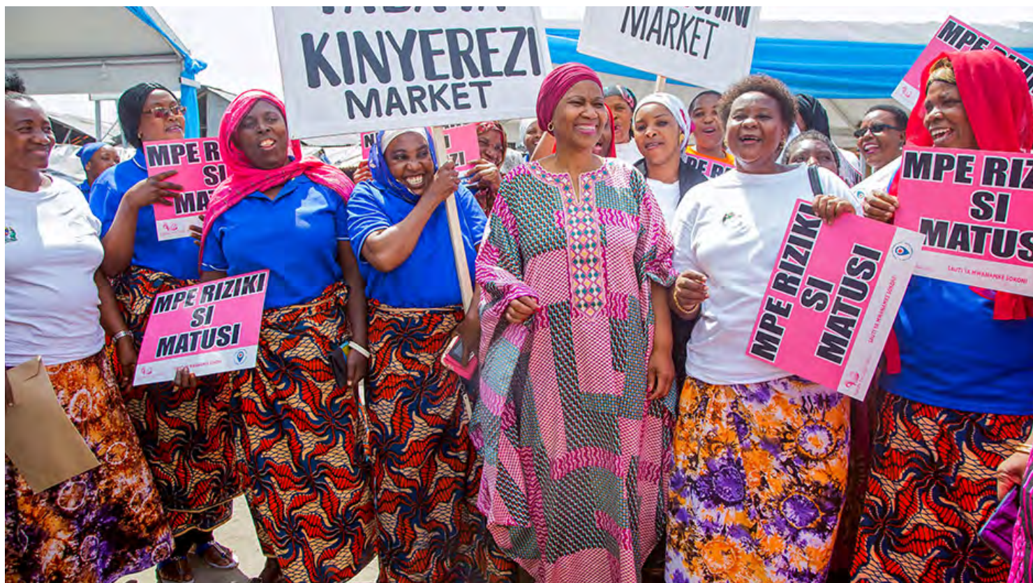
UN Women Executive Director, Ms. Phumzile Mlambo-Ngcuka (centre), with women vendors at Mchikichini Market in Ilala district, Dar es Salaam.

At her meeting with the Tanzania Police Female Network, Dr. Mlambo-Ngcuka discussed issues related to Gender and Children’s Desks. There are 417 desks that have been established throughout the country with support from UN Women and other UN Agencies. She also met with the Deputy Speakers of the National Assembly and the House of Representatives of Zanzibar, along with members of the Women’s Caucuses of the Union Bunge to discuss UN Women’s support to women leaders and parliamentarians.