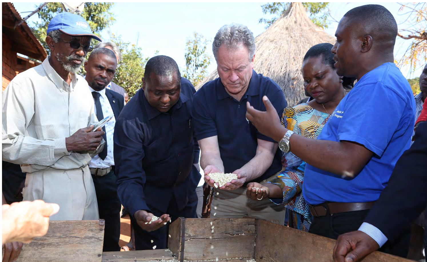
WFP Executive Director, Mr. David Beasley (centre) visits Farm to Market Alliance activities in Matimira Village, Songea Region.

“We have to make sure smallholder farmers have the tools to feed a growing population. If you don’t have food security you can’t have economic security...In Tanzania 75% of the people are farmers, so if the farmers have a problem, your country has a problem,”