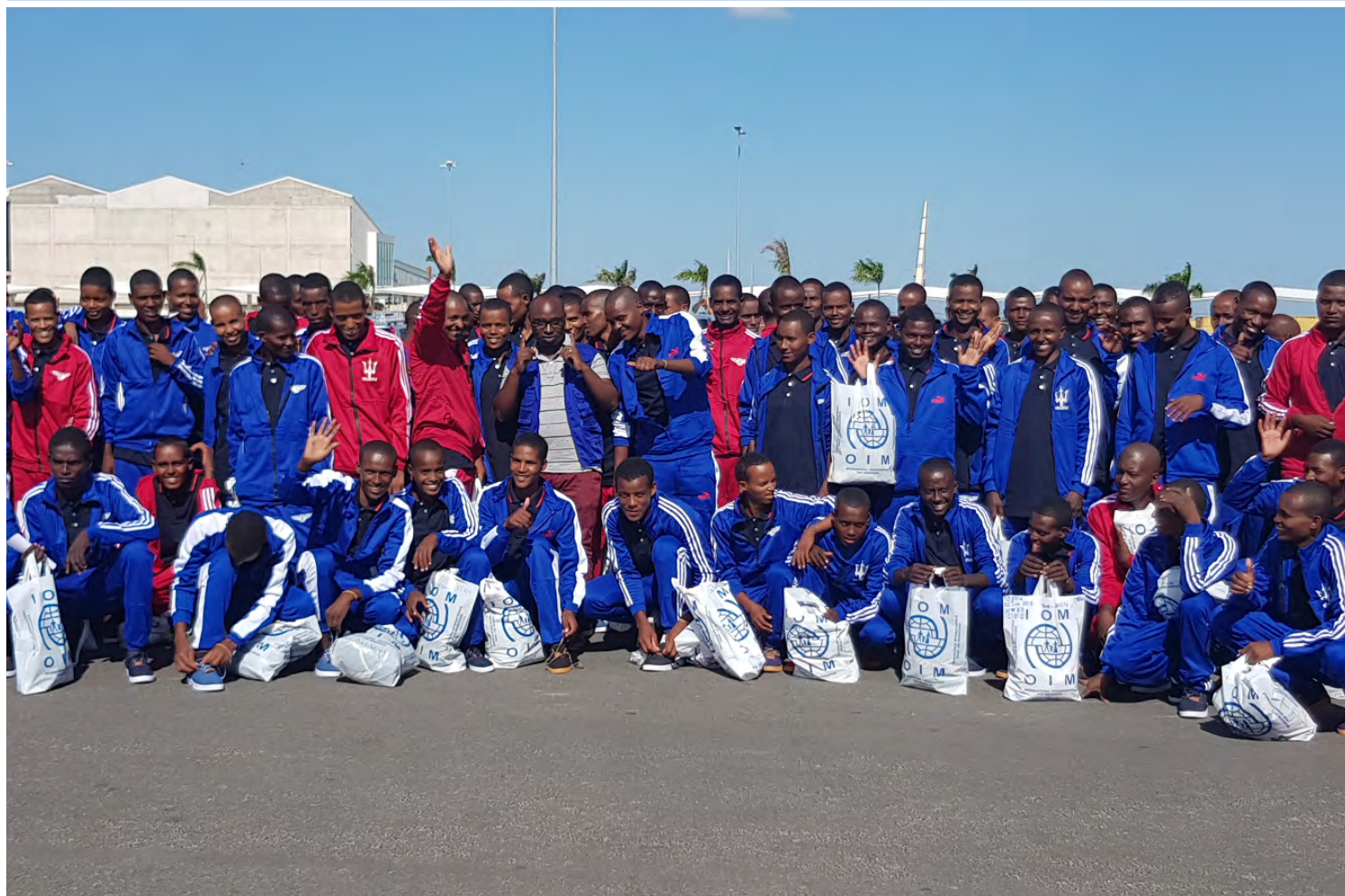
Ethiopian migrants prepare to board a flight back home from Tanzania.

This month the UN Migration Agency (IOM), assisted in the voluntary return of 300 Ethiopian migrants (6 women and 294 men; among them 191 children and 36 medical cases) stranded in Tanzania. The migrants left Tanzania on four different flights in the month of June. The return was made possible through the Better Migration Management (BMM) programme: a regional, multi-year, multi-partner programme co-funded by the European Union (EU) Emergency Trust Fund for Africa and the German Federal Ministry for Economic Cooperation and Development (BMZ).