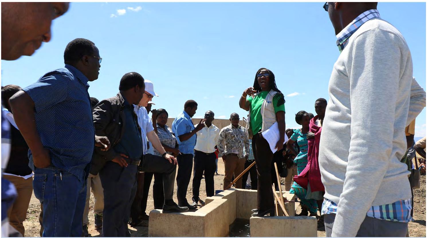
Editors and Journalist are shown one of the irrigation channels that provides water used by communities for various activities such as farming. The irrigation channel was established through WFP's Saemaul Zero Hunger Programme.