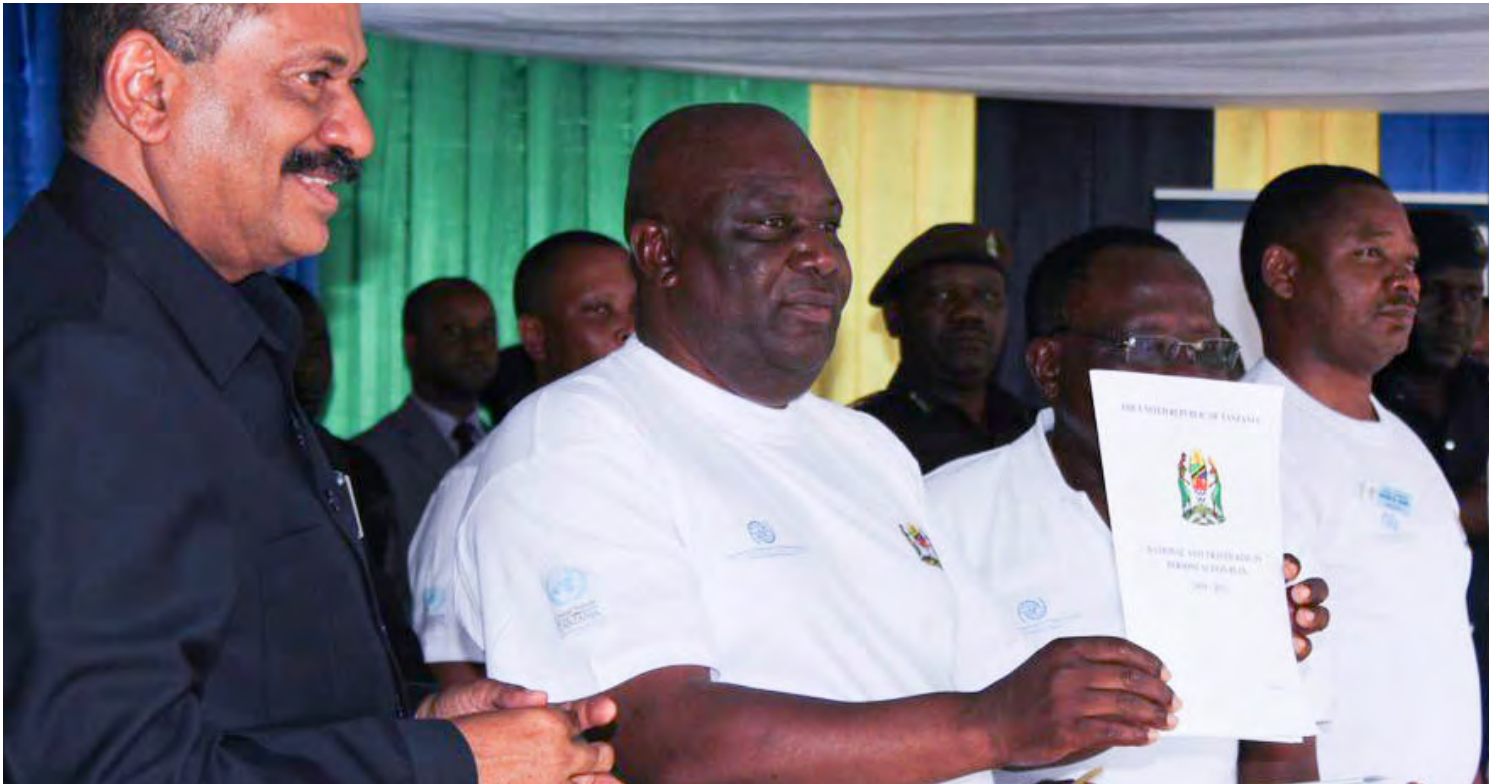
Minister of Home Affairs, Hon. Kangi Lugola (centre), launches the National Anti-Trafficking in Persons Action Plan 2018-2021 during World Day against Trafficking in Persons commemoration which took place in Dar es Salaam. The plan is being supported by IOM and other UN agencies.

The United Republic of Tanzania commemorated the World Day against Trafficking in Persons for the first time ever on July 30th at Mnazi Mmoja grounds.