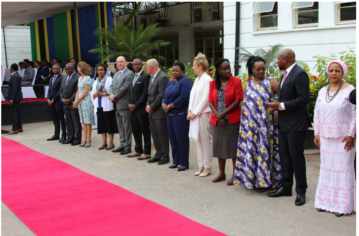
Heads and Representatives of UN Agencies in Tanzania await the arrival of the guest of honor.