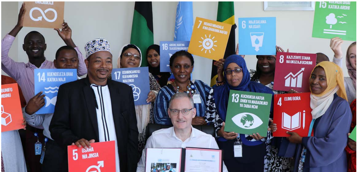
UN Resident Coordinator and UN Zanzibar Sub-office staff celebrate the official signing of the programme document for the Zanzibar Joint Program.