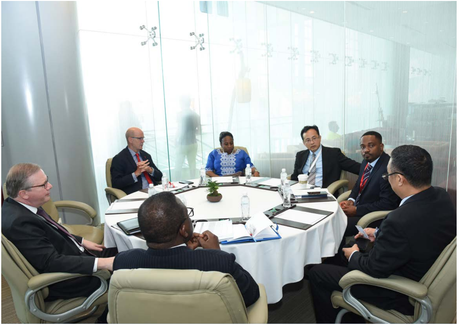
Hon Umyy Ally Walimu (MP), Min of Health, Community Development, Gender, Elderly and Children, of the United Republic of Tanzania on the occasion of the high level conference on Health. The conference was held in Beijing on 15 August 2018

In early September, the Government of the United Republic of Tanzania participated in the 2018 Forum on China-Africa Cooperation Summit in Beijing, China. One of the key themes that the Forum dealt included Health and the Tanzania Delegation for the high-level Health Forum was headed by the Minister of Health, Community Development, Gender, Elderly and Children, Hon. Umyy Mwalimu. In her remarks, Ms. Mwalimu focused on, among other things, strengthening collaboration between Tanzania and China on sustainability in health, including the local production of medicines in Africa, strengthening health systems and developing public health worker capacity as es-