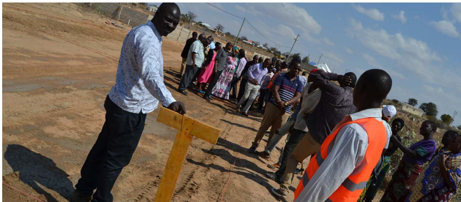
Participants at the SIYB/LBT, ToT workshop in Dodoma during practical training on road construction using Labour Based Technology (LBT).

The International Labour Organization (ILO) in collaboration with the Prime Minister's Office – Labour, Youth Employment and people with Disability, Tanzania, organized a training of trainers (ToT) workshop for about 40 project partners from in Dodoma in early September. Participants were drawn from the five districts in Dodoma region, relevant Ministries, partner organizations and Technical and Vocational Education Training (TVET) institutions. Among the areas covered during the training included – introduction to 'Start and Improve your Business' packages and enterprises development, introduction to Labour Based Technology, registration of contracting firms, road condition survey for effective planning, road rehabilitation and design standards.