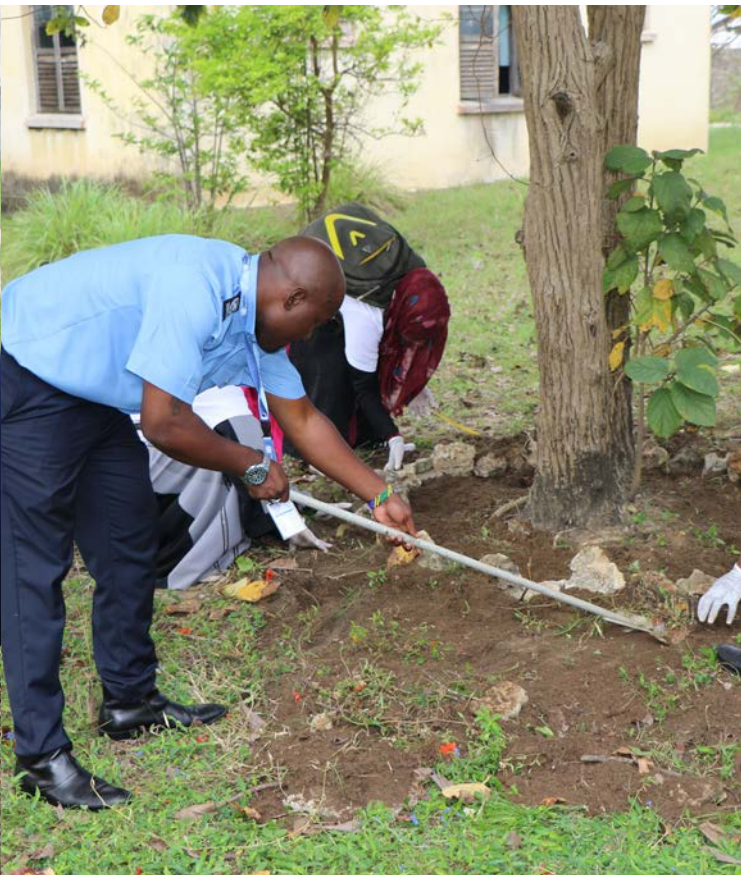
Zanzibar Youth participating in outreach Sebleni which is the compound where the community of elderly persons reside. There are currently 31 residents on the compound.