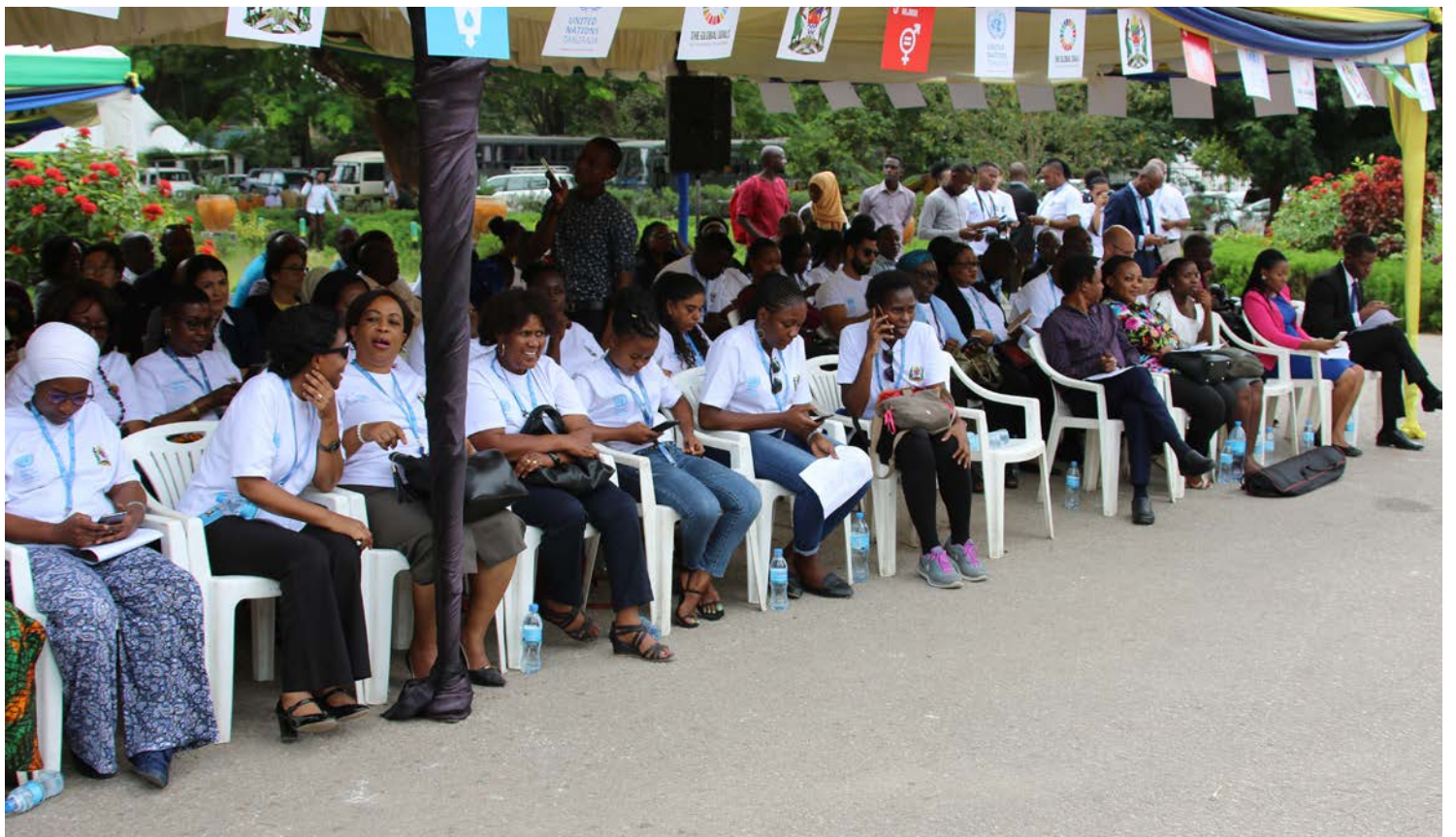
The theme for this year's UN Day Commemorations was 'Youth Empowerment and Innovation for Achievement of the SDGs'. In addition to UN Staff, the Flag-Raising Ceremony at Karimjee was attended by government officials, over 300 youth, development partners, civil society, the media and other stakeholders.