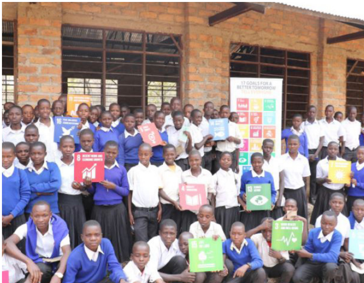
Students from Mugunzu Secondary School take a group photo after the Sustainable Development Goals (SDGs) awareness raising in Kakonko DC.

The Kigoma Joint Programme (KJP) is an area-based UN joint programme that cuts across multiple sectors to improve development and human security in Kigoma. The programme involves 16 different The 16 participating UN agencies working together across 6 themes which are sustainable energy and environment; youth and women's economic empowerment; violence against women and children; education with a focus on girls and adolescent girls; WASH (Water, Sanitation and Hygiene) and agriculture with a focus on developing local markets. While the major focus on the programme is on these six themes,