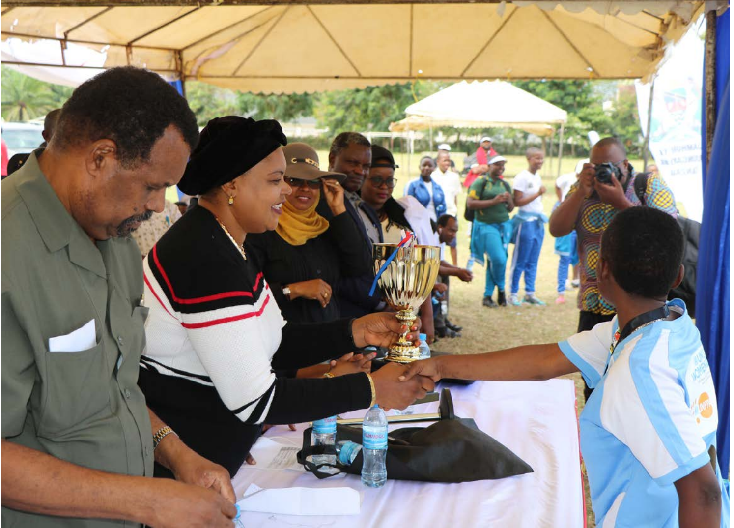
The Minister of State in the Prime Minister's office Hon. Jenista Mhagama handing over the trophy to the winner among the three teams that participated in the football game at the youth bonanza at Popatral grounds in Tanga Region.

In partnership with the government of the United Republic of Tanzania, the United Nations supported and participated in national activities in Tanga region including a youth symposium, exhibition and sports bonanza during this year's National Youth Week commemorations. Under the national theme of Safe Spaces for Youth, the aim of the UN's support was to ensure that the voices of young men and women are better represented in national dialogue for peace building in Tanzania. Additionally, the activities aimed to raise awareness among youth on their potential to contribute to the Sustainable Development Goals (SDGs) and national development priorities.