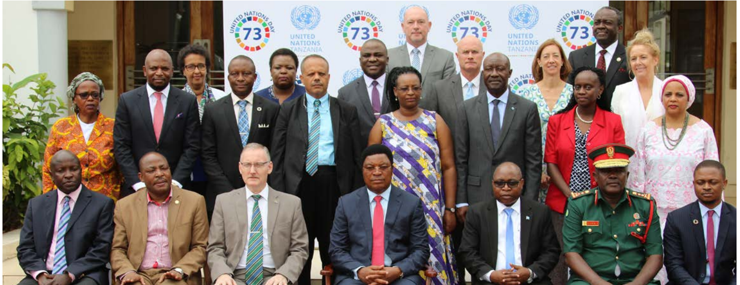
Guest of honor, Prime Minister Kassim Majaliwa Majaliwa (seated centre) with Heads and Representatives of UN Agencies in Tanzania.

UN Staff and youth came together to provide the elders living at the residence with basic health services, in addition to cleaning their surroundings, and providing them with meal. The outreach put the spot light on the elderly as a critical group most likely to be left behind unless deliberate efforts are made to improve the quality of their lives.