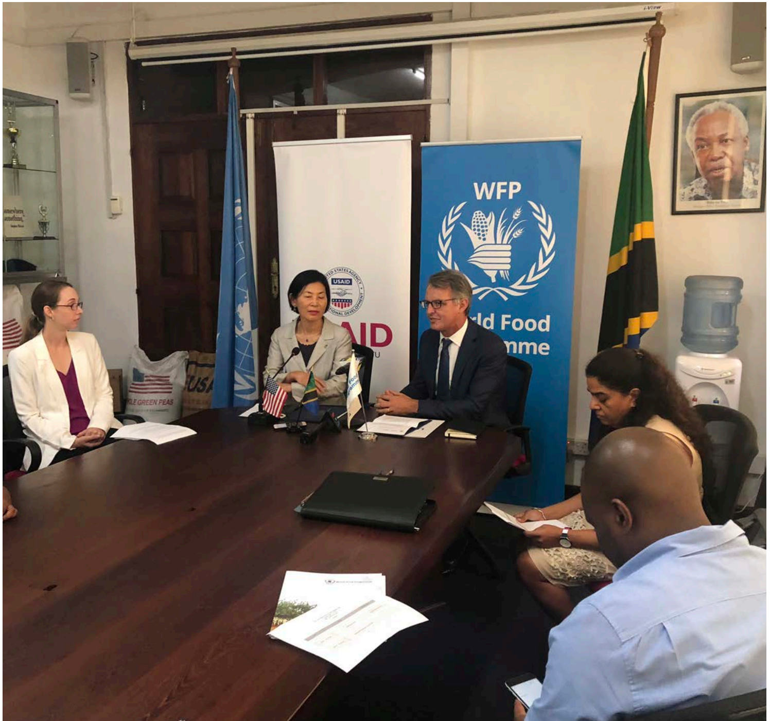
This contribution, along with support from other donors, enables WFP to return refugee food rations to 100% based on minimum daily kilocalorie requirements.

WFP assistance is the main source of food for refugees. WFP also runs a Supplementary Feeding Programme in all three camps to provide additional nutrition support to pregnant and lactating women, children under five years, people with HIV/AIDS and hospital in-patients. In addition, hot meals are served to newly arriving refugees at transit and reception centres and high energy biscuits provided to those in transit.