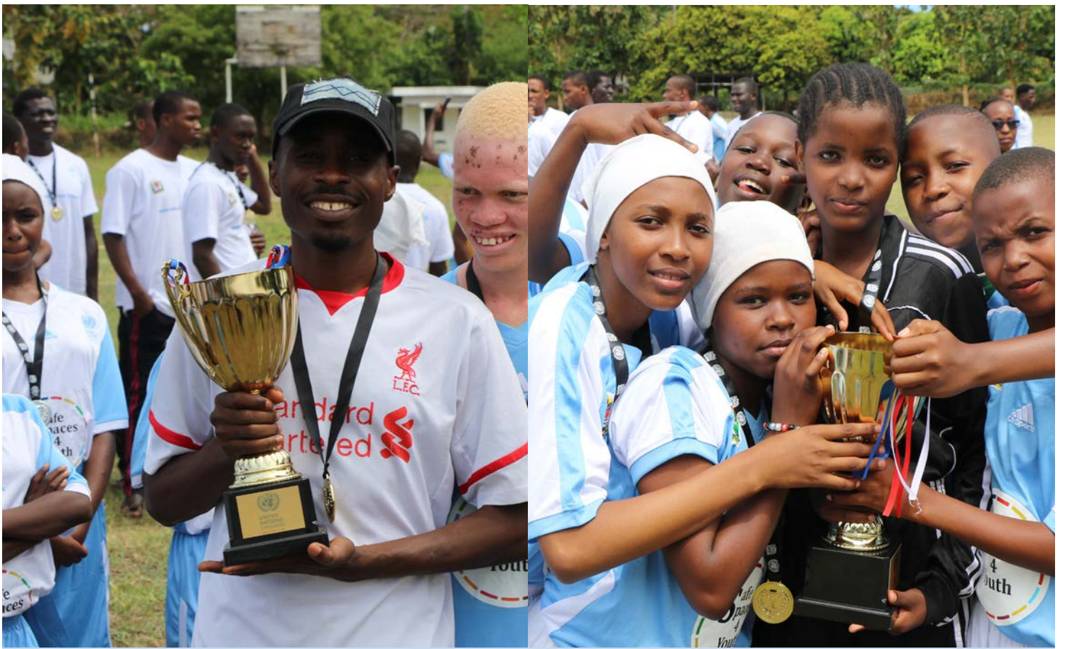
Team captain and youth that participated several games at the Youth Bonanza cheer up with their trophies after emerging winners.