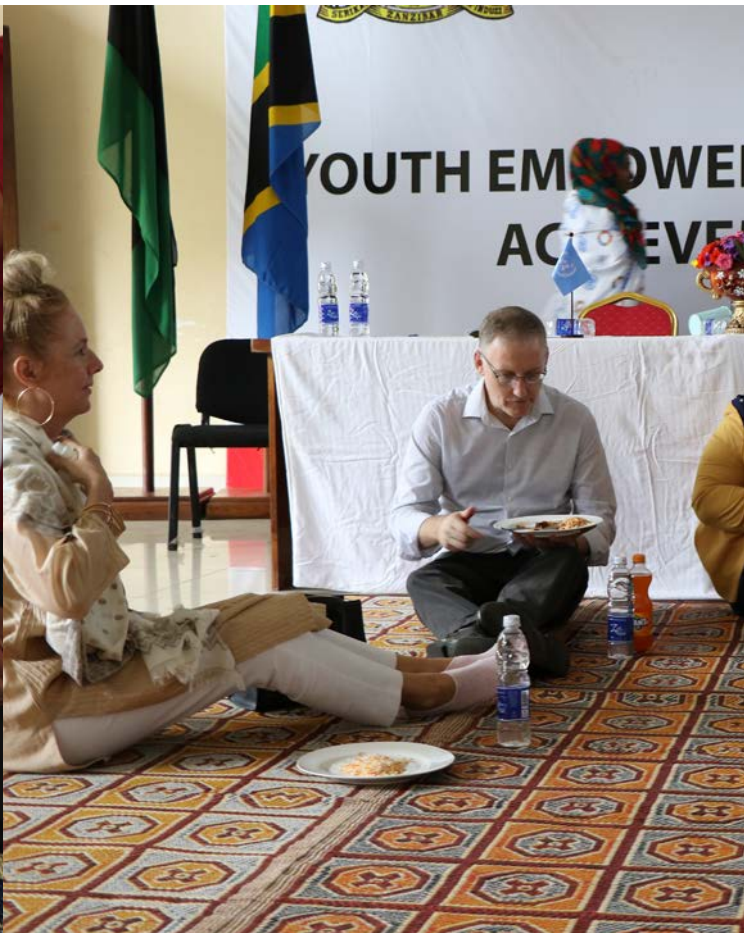
Government and UN Officials, the elderly and youth shared a meal at the end of the outreach which was part of UN Day celebrations in Zanzibar.