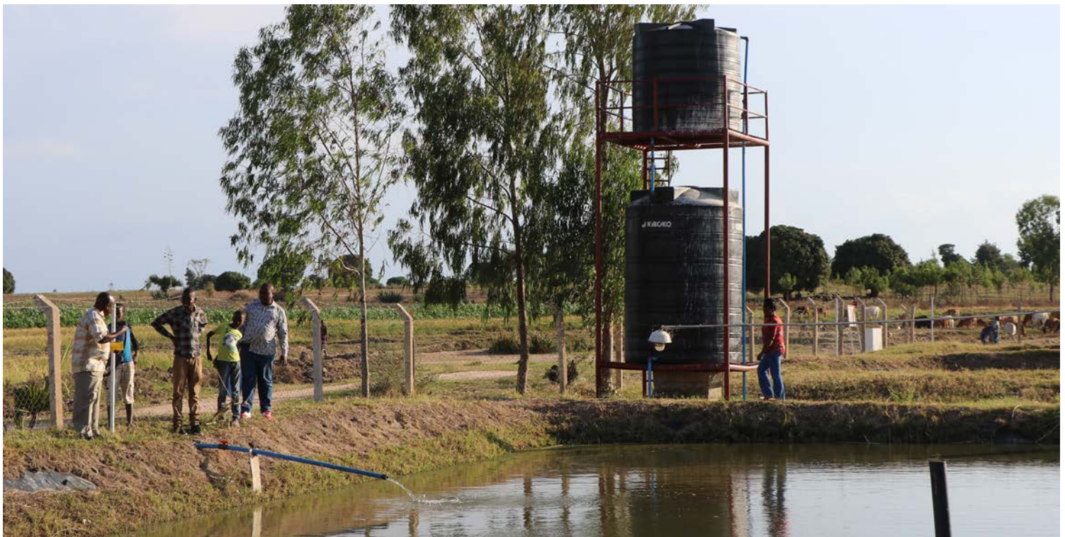
The Delegation visited one of the United Nations Development Programme (UNDP) supported fish projects' in Magu district Mwanza Region.