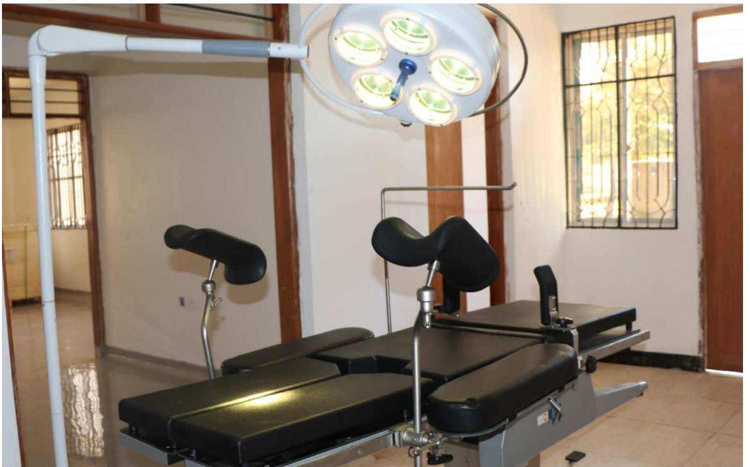
One among labour beds donated by United Nation Population Fund (UNFPA) as part of the support to maternal and new born health.