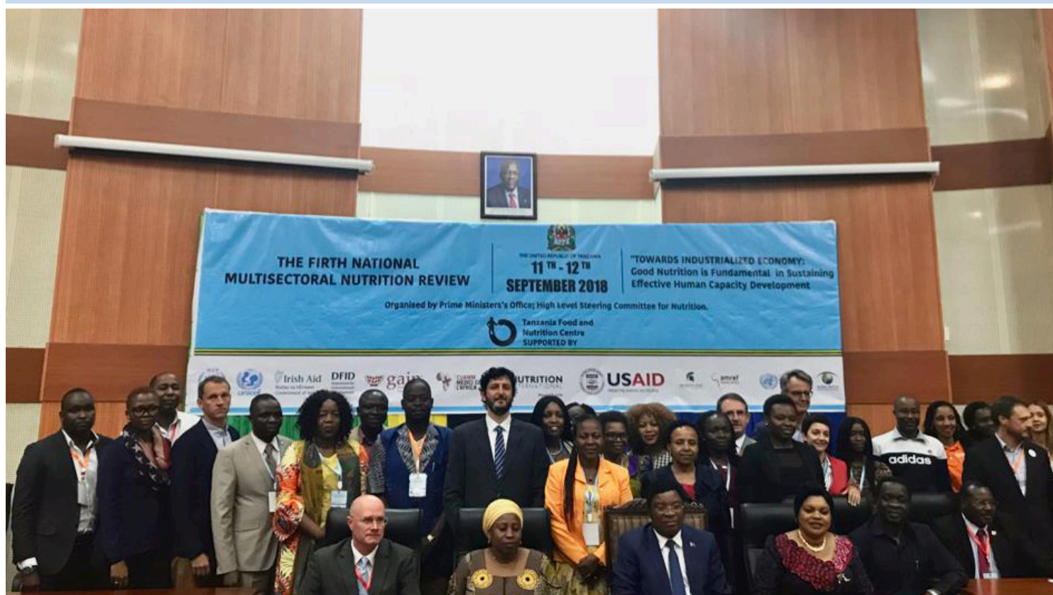
Prime Minister of Tanzania, Honorable Kassim Majaliwa with other Ministers from nutrition-relevant sectors and Representatives from UN Agencies and other Development Partners during the opening ceremony of the JMNR 2018.

Convened by the Prime Minister's Office (PMO) through the High Level Steering Committee on Nutrition (HLSCN), the fifth Joint Multisectoral Nutrition Review (JMNR) was held in Dodoma in mid-September. It was organized by the Ministry of Health, Community Development, Gender, Elderly and Children (MoHCDGEC) through the Tanzania Food and Nutrition Center (TFNC), and supported by UNICEF and other partners. Since 2014, the JMNR has been an inclusive and multisectoral platform to jointly review and analyze the progress of nutrition in Tanzania every year. Under the theme Towards Industrialized Economy: Good Nutrition is Fundamental in Sustaining Effective Human Capital Development, the fifth JMNR was an opportunity to review progress and challenges on the implementation of the second year of the National Multisectoral Nutrition Action Plan (NMNAP) of 2016-2021, and its Common Results,