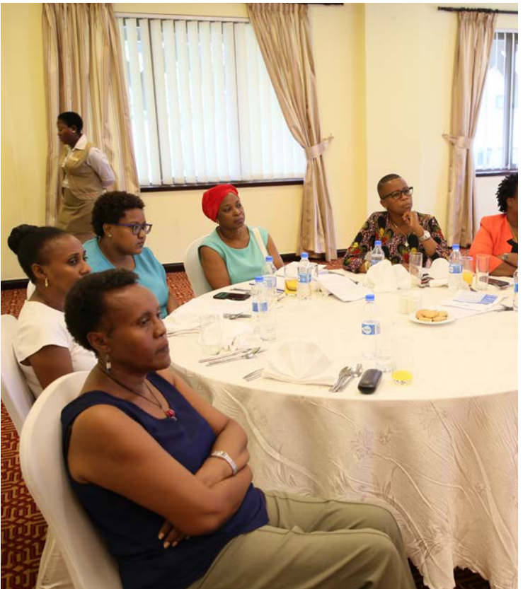
Some of the UN Executive Associates, and Personal Assistants during the session