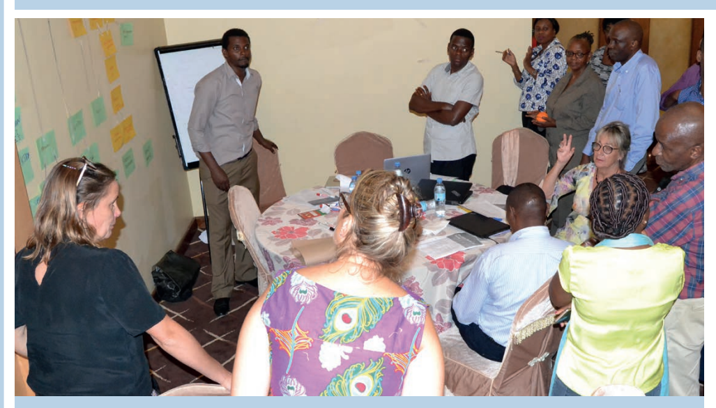
Members of the UNDAP II Economic Growth and Employment Outcome Group attend a training on Market Systems Development Approach.

n late February, the International Systems Labour Organization organized a three-day training enhanced for UN agencies who are members of the Economic Growth and Plan 2016-2021 UN agencies in this outcome chain development for group are UNDP, UNCDF, UN employment. Women, ILO, FAO, IFAD, UNIDO, UNCTAD. UNOPS. Environment and IOM.