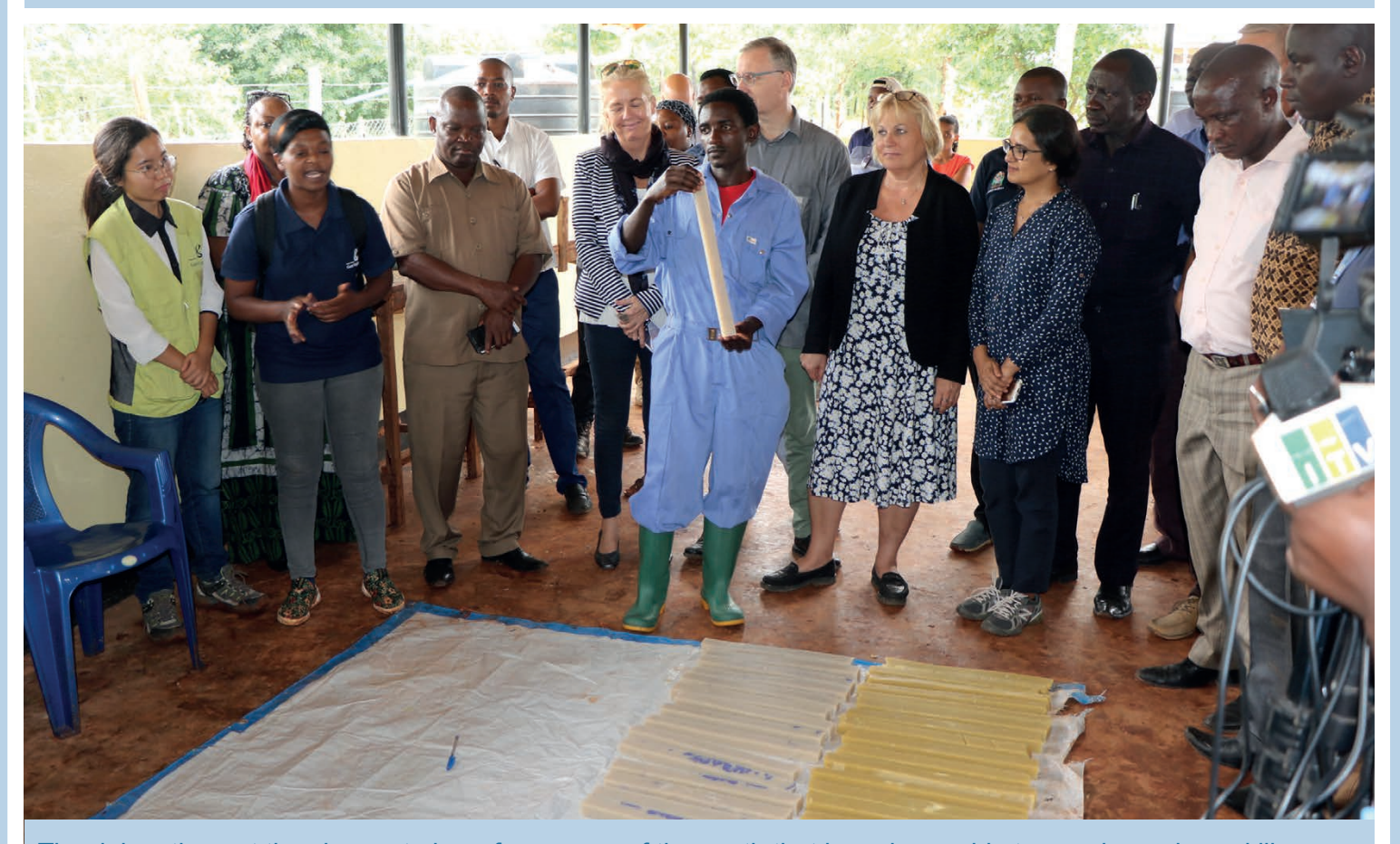
The delegation got the chance to hear from some of the youth that have been able to acquire various skills through the Kasanda Multipurpose Community Centre (MPCC) located just outside of Mtendeli refugee camp in Kakonko region. Through the MPCC, local residents and refugees benefit from classes offered on carpentry, sewing, soap making and ICT.