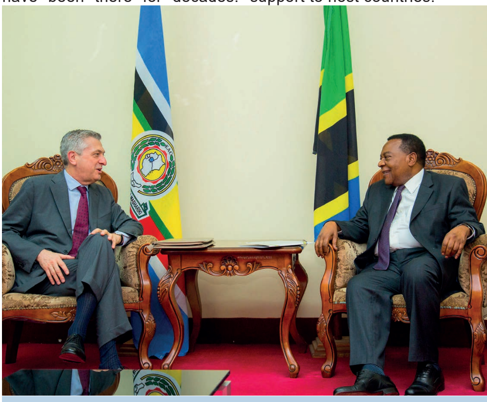
The High Commissioner of UNHCR, Mr. Filippo Grandi (left) meets with the former Minister of Foreign Affairs and East African Cooperation, Hon. Dr. Augustine Mahiga (right).

per cent are from the Democratic Mr. Grandi praised Tanzania for Republic of Congo. The vast supporting the Global Compact majority live in camps close on Refugees, an approach which to the border areas and many calls for greater international have been there for decades. support to host countries.