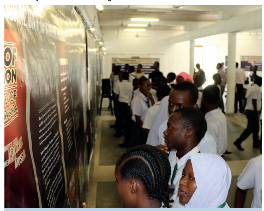
Students from Chang'ombe, Kibasila and Azania Secondary schools viewing an exhibition on the Holocaust prepared by the UN Information Centre (UNIC) titled 'State of Deception'.

heUnitedNationsInformation to learn from them, from History the day and encouraged students and support actions to strengthen democratic values and human rights wherever we are," said Mr.