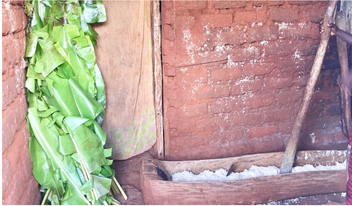
Cassava flour being processed before being used to make 'ugali' by members of Songambe Savings Group in Nyarugusu Refugee Camp.

One year and half after they first met, these 20 refugees are more resilient in a supportive family-like atmosphere.