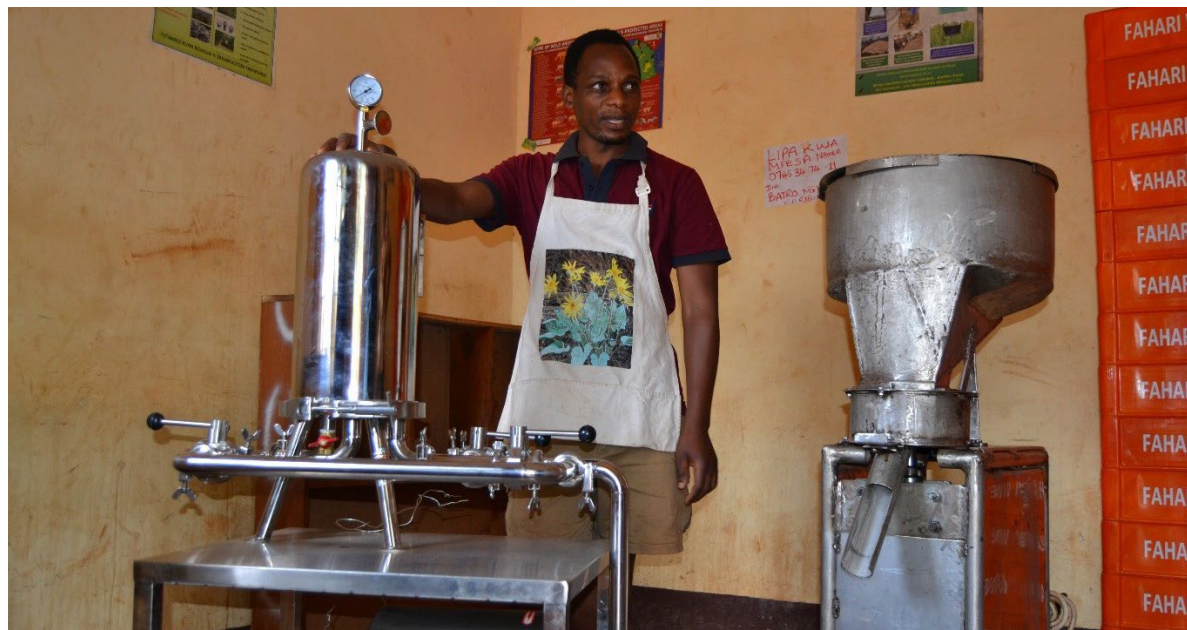
Members of the Msuasoo Economic Development group purchased wine processing machinery through funding support from ILO and UNDP through the Kigoma Joint Programme.

Beneficiary groups also report the scaling up of their business through the purchasing of possessing machinery and employment of workers outside the group. Twiyambe Group currently employs 6 workers including a security guard while the wine making group has increased their team of five members to include manufacturing assistants, security and distributors. Furthermore, both groups report an increase in production as they have begun to apply the teaching, they received during business development training. The wine-making group has been able to capitalize on the local market by manufacturing wines in different sizes and prices ranging from "Our demand at the moment is higher than we can