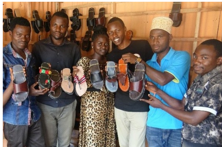
Kasulu Youth Revolution (Kayore) Group showcasing their products

In April 2019, 12 groups owned enterprises in Kasulu District Commission, Kasulu Town Council, Kibondo and Kakonko districts in Kigoma region went through a two days in-store coaching session to help them gain more knowledge and experience of doing business better and smart. The session touched on three specific areas: Business Model Development, Business Governance and Financial Management.