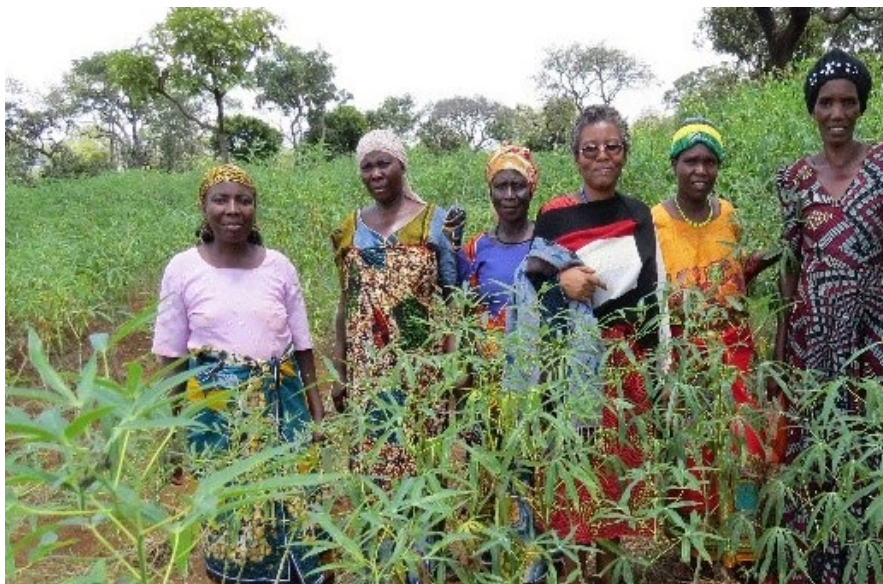
Some members of Ukhery group proudly posing at their 15 acres cassava farm