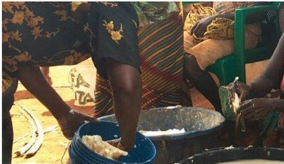
Members of Sogambele Savings Group mixing cassava pulp before making 'ugali' in Nyarugusu Refugee camp, in Kasulu district, Kigoma region.