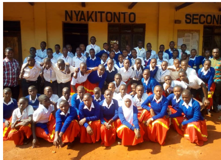
A Group photo of the Safe Space - TUSEME Youth Club members from Nyakitonto Secondary school along with their club patrons.

He added, female students are more actively participating in class and school activities with increased confidence.