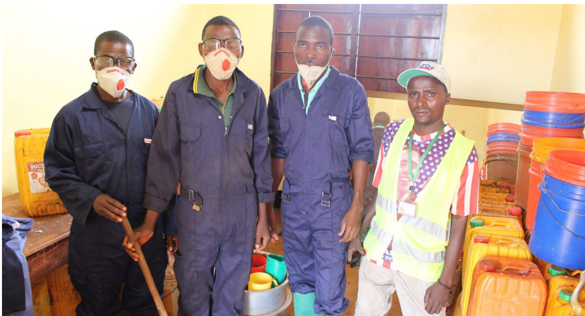
Students of the Multi-Purpose Community Centre (MPCC) outside Nyarugusu Refugee Camp who have been trained in soap-making with one of their facilitators from Good Neighbours. The MPCC is managed by UNHCR and was constructed with support from KOICA and Norway.

N yNyarugusu refugee camp is one of the largest refugee camps in Tanzania. It is located in the western province of Kigoma, Tanzania, about 150 km east of Lake Tanganyika.