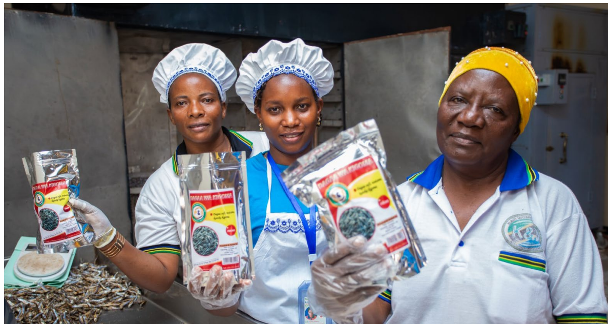
Members of Kazi Women's Group, shareholders of the Petro & Sons Company Limited, in Kigoma showing the final packaged product of dried sardines (know as 'dagaa') in Kiswahili. The women provide the raw sardines and also play a huge role in the value-addition process.