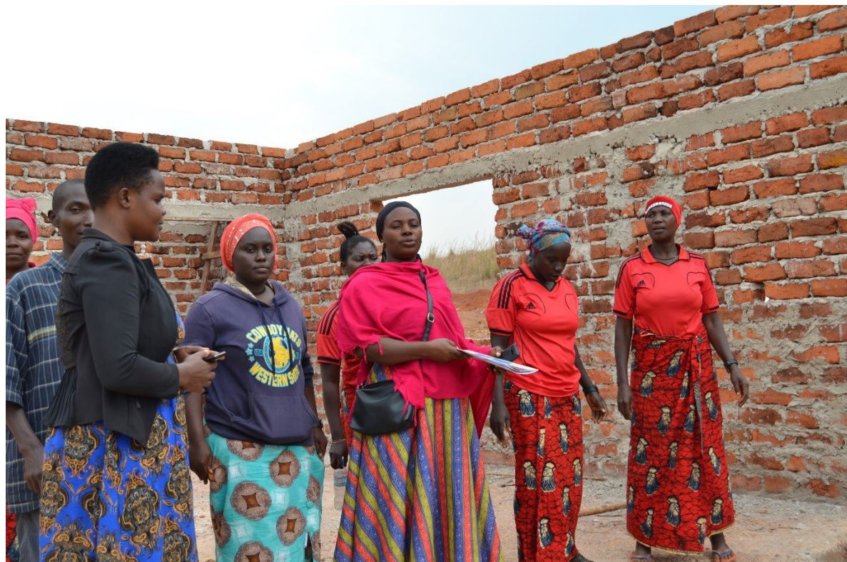
Twiyambe Women's Group members at their grain processing facility/warehouse which is being constructed by funds received from UNDP and ILO through the Kigoma Joint Programme.

"When we were trying to host some of our group gatherings and function, we saw there was a lack of venues for meetings and social engagements in our town (Kakonko). There is a town