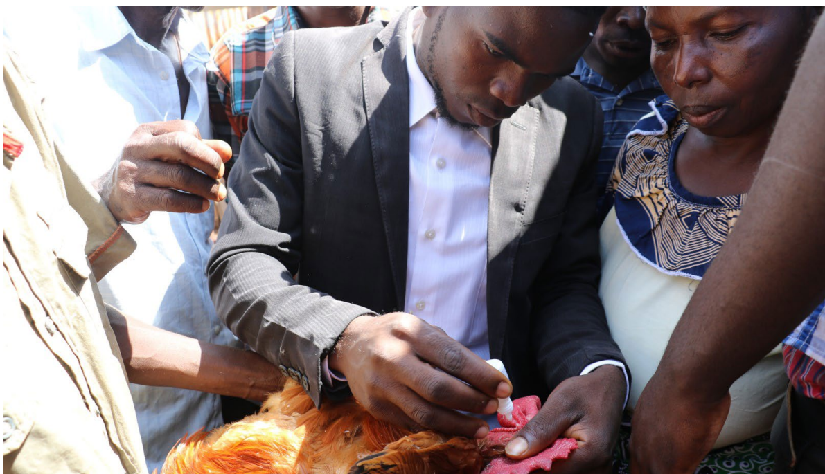
A participant gives a vaccination against Newcastle disease to a chicken using a I-2 Vaccine in Kakonko a FAO training.