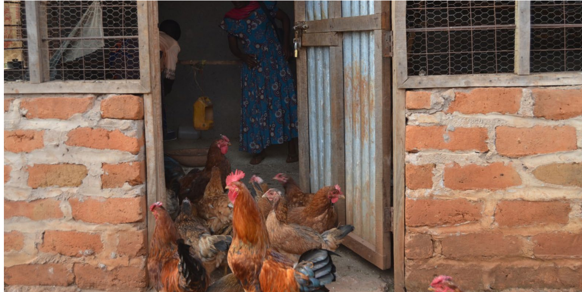
A member of the Azimia Group shows her group's chicken coup which is part of their successful mixed farming initiative in Kibondo District.

Through the grants received from UNDP and ILO, the group has made