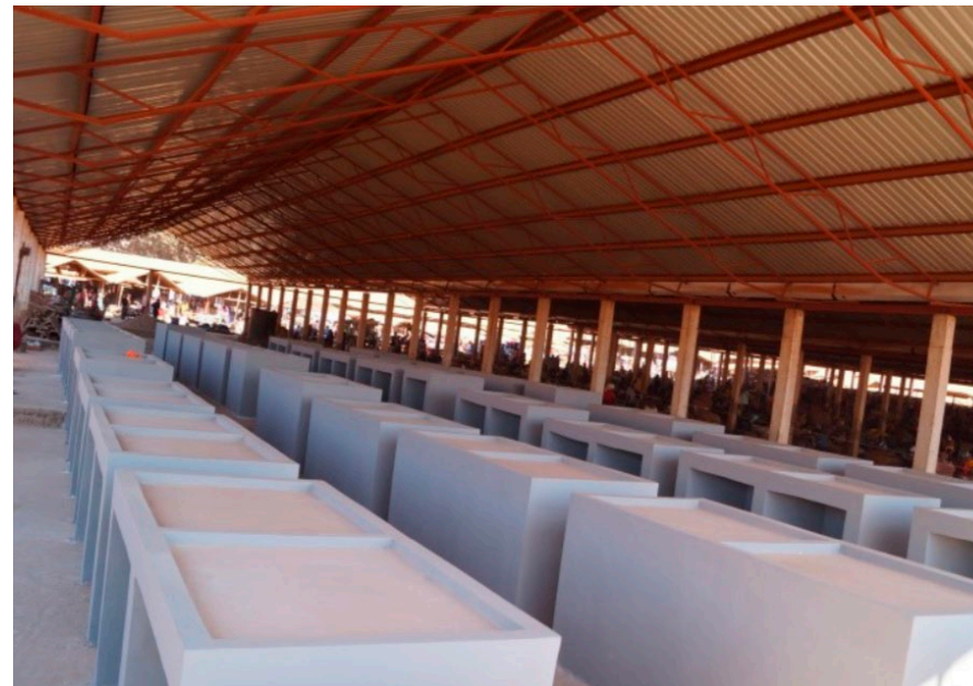
These 110 newly constructed stalls will provide a safer and cleaner business environment at Sofya Market.