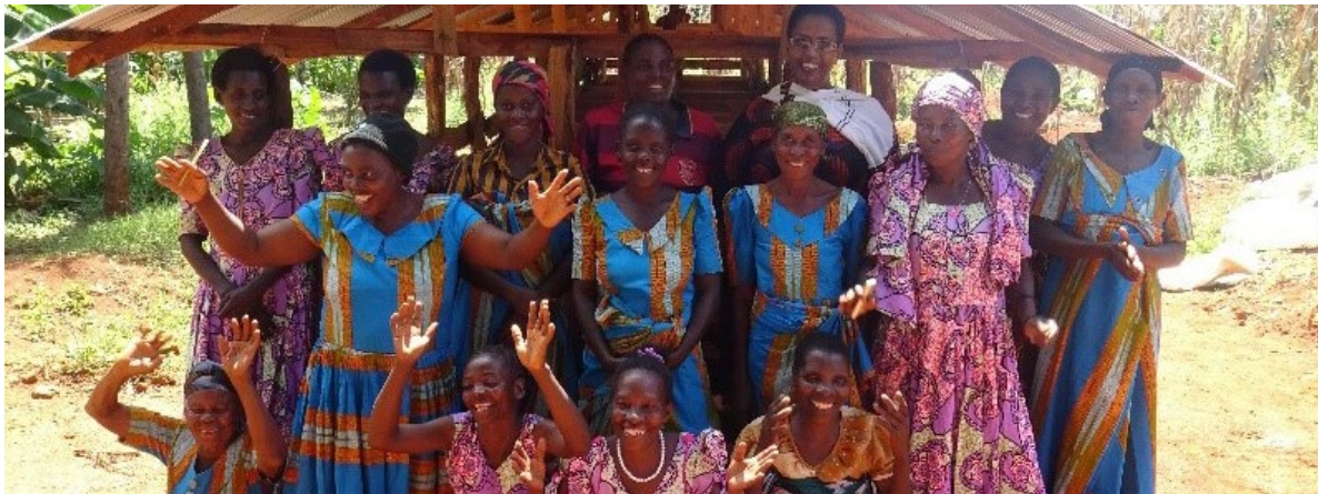
Tushirikiane Women Group members in a photo at their project area where they have a pig farm

W omen and youth are the most economic dependent people in Tanzania. Empowering these groups is very important to advance their growth so that they gain economic independence. To ensure this is realised, UNDP in collaboration with ILO are jointly supporting economic activities for Women and Youth Groups with a focus on access to finance for small scale investment.