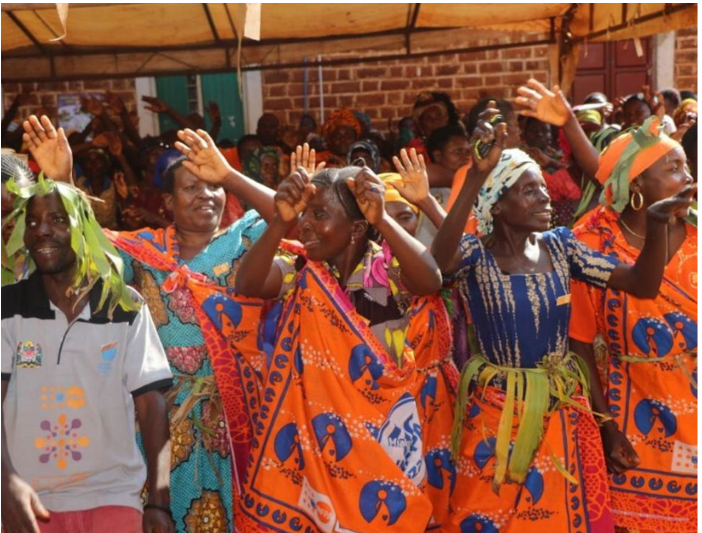
Pregnant women can now access timely and skilled care during pregnancy, delivery, and in the weeks following birth at the newly constructed maternity ward at Muzye Dispensary.

UNFPA continues to support efforts to accelerate progress towards zero preventable maternal deaths by 2030, ensuring that no one is left behind in the implementation of national and global development goals in Tanzania.