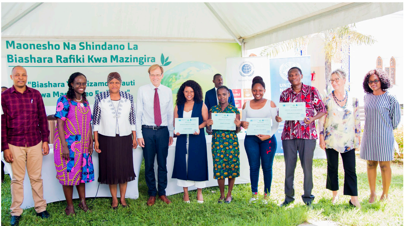
The eight finalists of the Green Challenge Competition were selected from four different categories - Green Business (manufacturing or service), Green Agribusiness, Renewable Energy and Waste Management and Recycling.