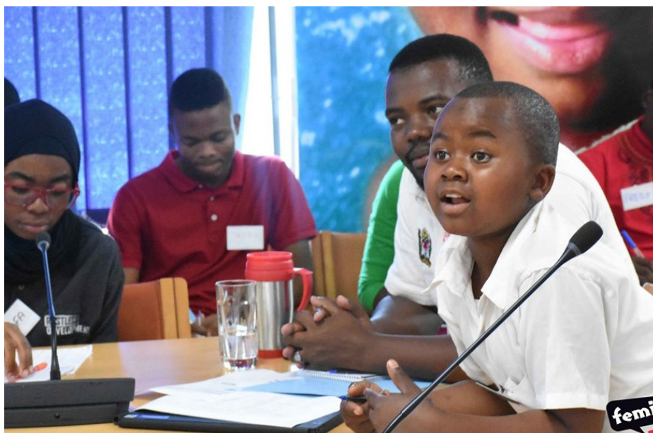
Children in discussion at one of the consultative meetings in Mbeya.

The Agenda development process, subsequent advocacy meetings with influencers, and the Youth Summit all facilitate the meaningful participation of young people in decision-making processes, a key part of Generation Unlimited's work in Tanzania. Children and young people are now demanding a new framework, one that views children as stakeholders rather than beneficiaries, of the law and the state, but as stakeholders, who know what they need and want in terms of policies, priorities and delivery plat-