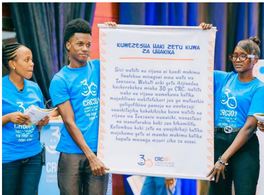
Children and Young People's Agenda champions launching the Agenda at the CRC@30 climax event.

Children and young people in Tanzania have started a movement to ensure that their voices are heard at some of the highest levels of decision-making in the country. In January, nearly 300 children from various youth networks and platforms participated at the Youth Summit, organized by Femina Hip in collaboration with UNICEF.