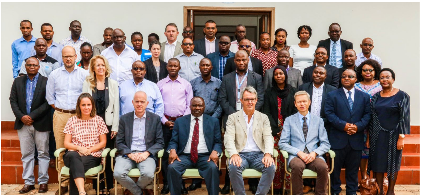
A group photo of the delegation (Officials from Irish, Royal Norwegian and Swedish Embassy, Government, and United Nations) during the Kigoma Joint Programme Steering Committee Meeting which took place in Kigoma Region in February.