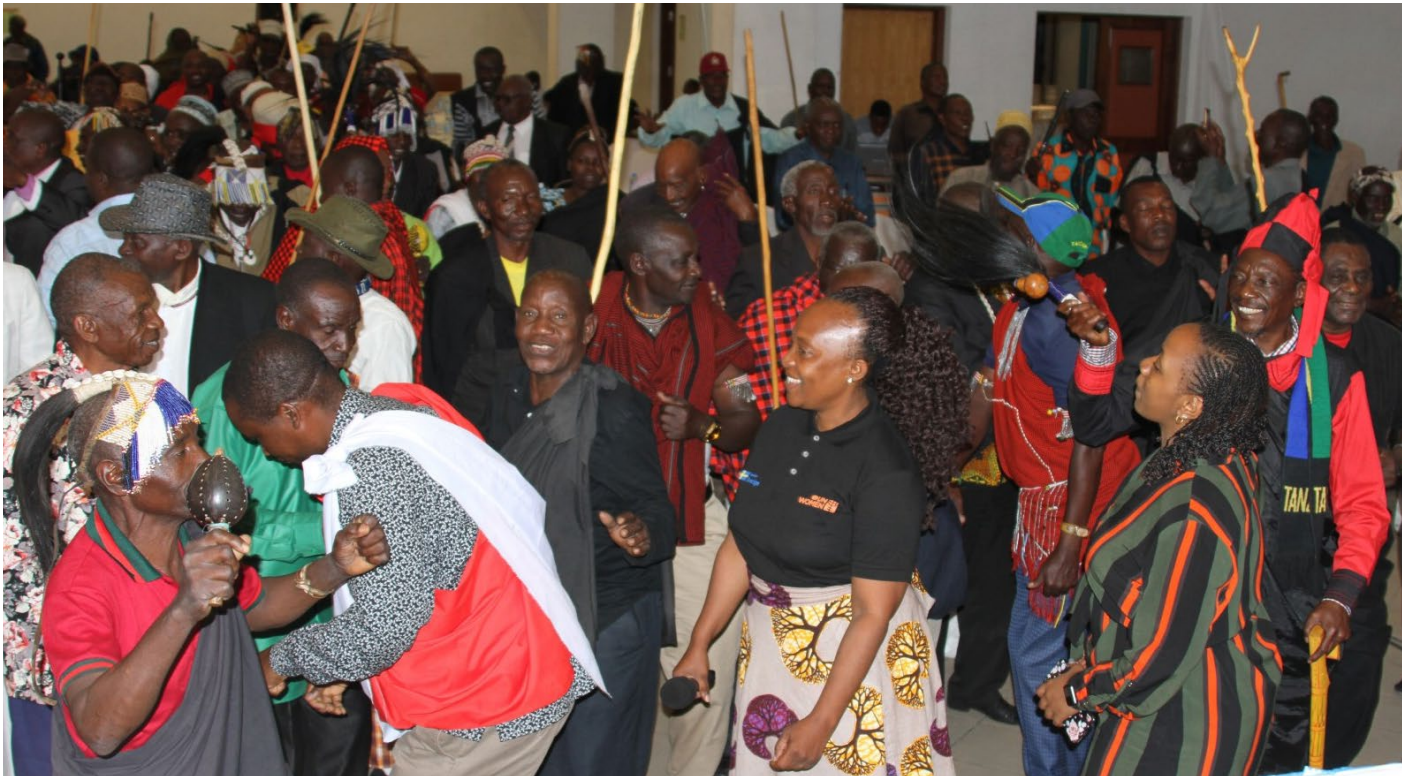
Traditional leaders from nine different regions across the country committed to intensifying efforts to end violence against women and girls at the community level.