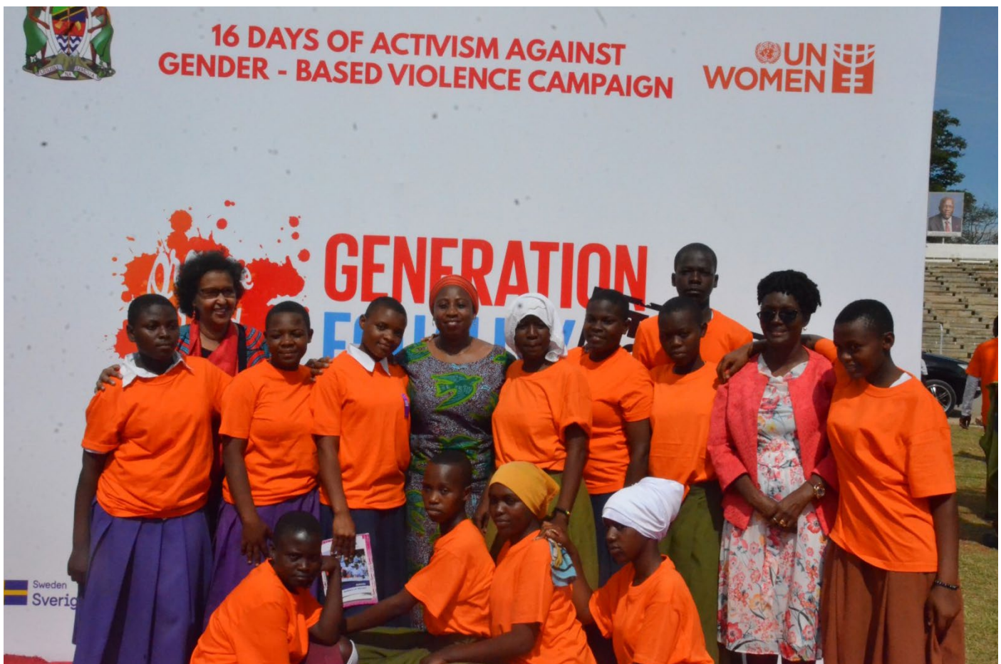
Hon. Umyy Mwalimu, Minister of Health, Community Development, Gender, Seniors and Children, and Ms. Hodan Addou, UN Women Representative, share a moment with girls who attended the launch of the 16 Days of Activism Against Gender-Based Violence Campaign in Dodoma.

On 25 November 2019, Hon. Umyy Mwalimu, Minister of Health, Community Development, Gender, Elderly and Children, launched the 16 Days of Activism in Dodoma – a global campaign which runs from 25 November, the International Day for the Elimination of Violence Against Women, to Human Rights Day on 10 December – pledging the Government’s continued