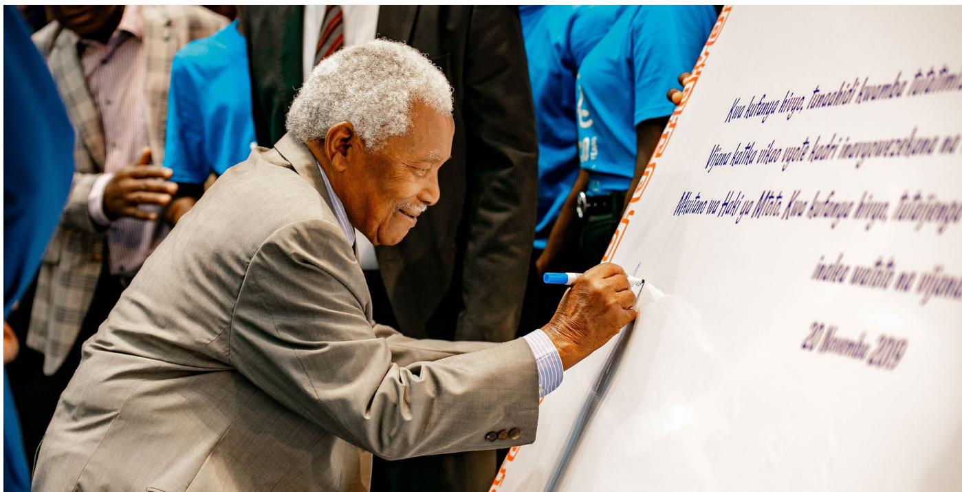
Children launched 'The Children & Young People's Agenda' and leaders, including Former President H.E. Ali Hassan Mwinyi, signed a pledge to reaffirm their commitment to supporting child rights in Tanzania. President Mwinyi ratified The Convention on the Rights of the Child in Tanzania in 1991.