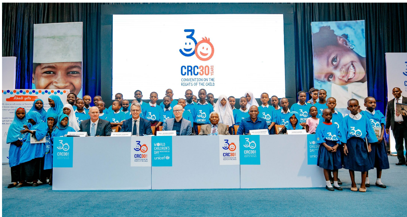
Children and young people look to government to intensify efforts to advance child rights in Tanzania.