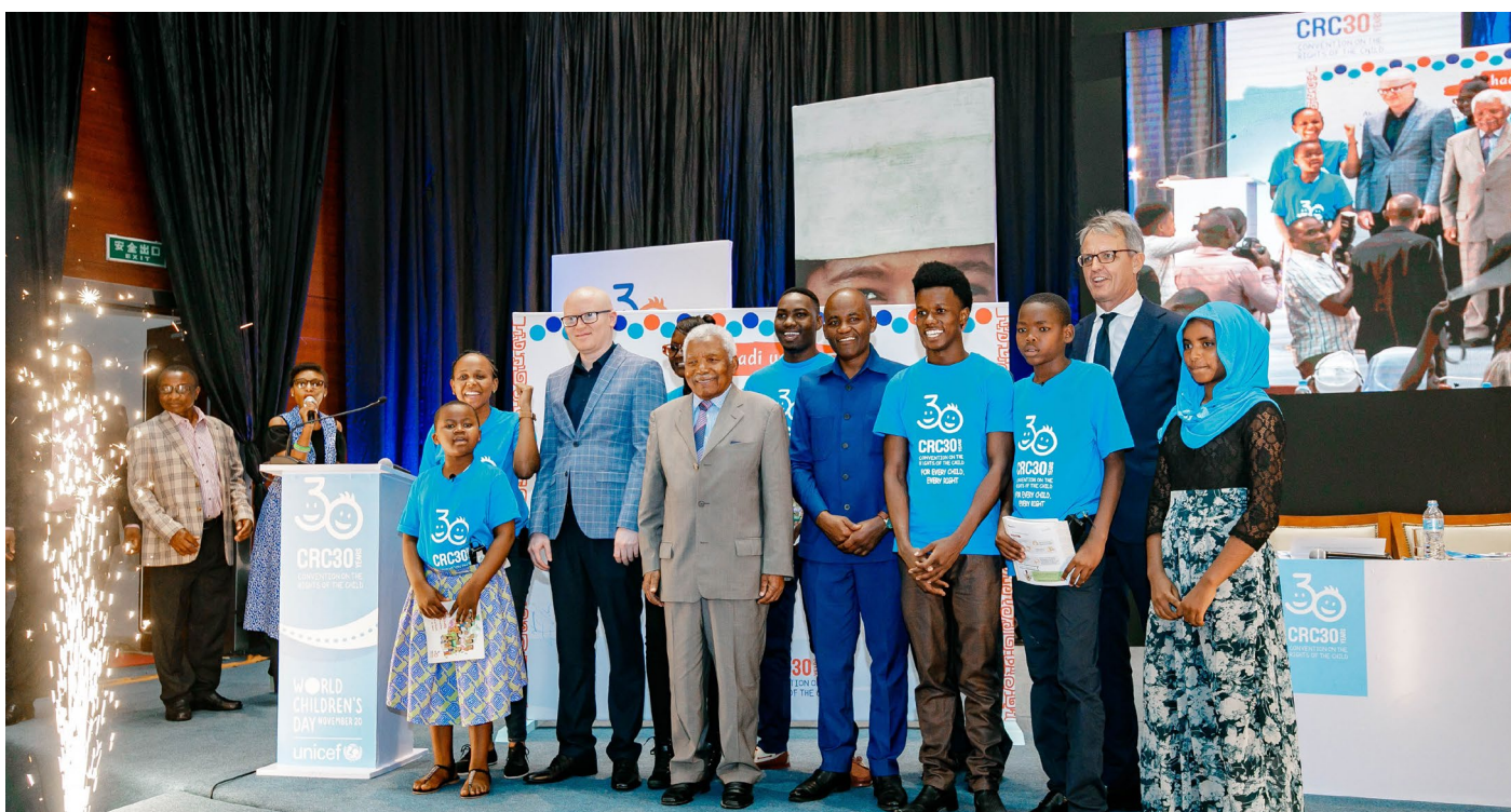
Former President Ali Hassan Mwinyi reaffirm his commitment to supporting child rights in Tanzania, 30 years after he ratified The Convention on the Rights of the Child.