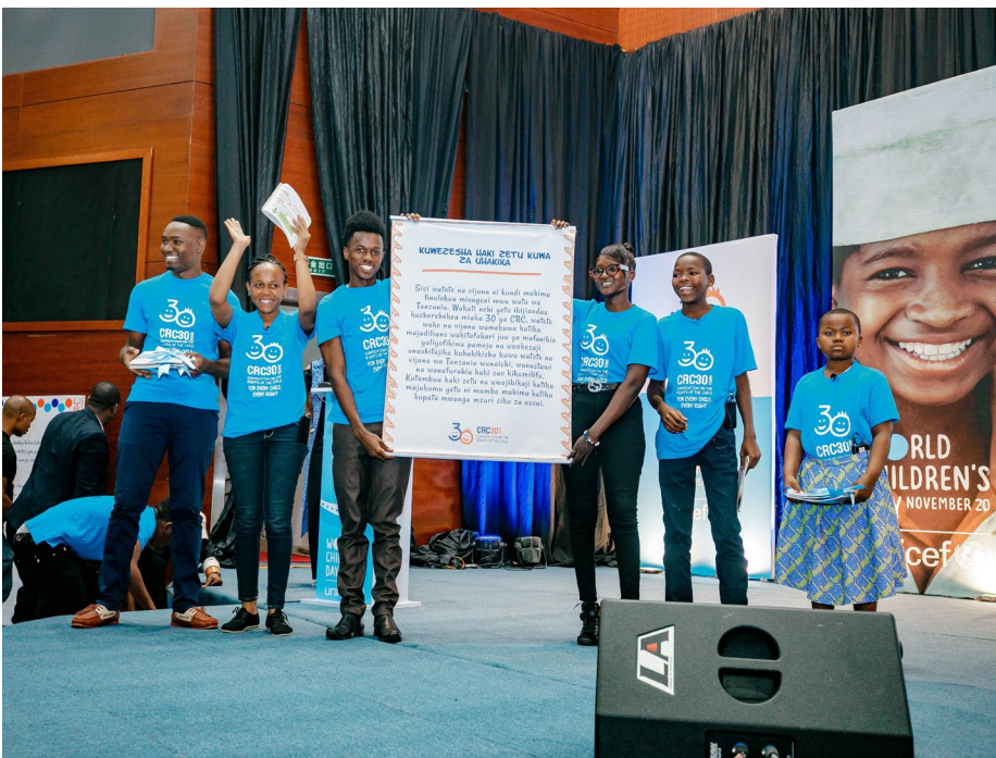
Children and young people ask leaders and stakeholders to sign their pledge and commit to advancing child rights in Tanzania.

As part of the commemorations, Mimi Mars, a famous musician, launched a special song “Watoto Tualinde” which she had composed for the children of Tanzania, and six buildings Umoja House, Canadian High Commission, National Microfinance Bank HQ, National Housing Corporation HQ, UN House and the UNICEF office “went blue” on 19 November as part of the global Go Blue campaign to celebrate 30 years since the signing of the CRC and to raise awareness about the issue of child rights.