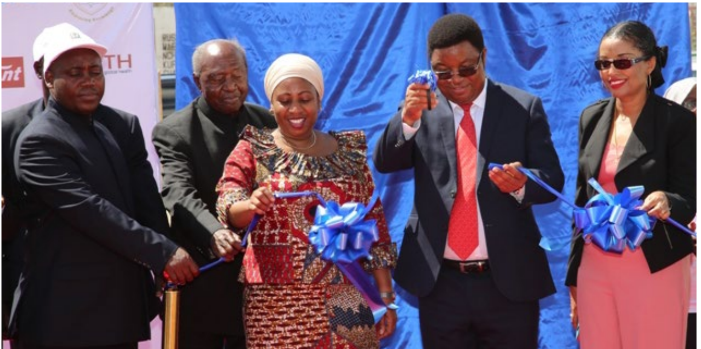
Hon. Kassim Majaliwa, Prime Minister of the United Republic of Tanzania, launches a new national programme to tackle non-communicable diseases in Tanzania. He is joined by Hon. Umyy Mwalimu (left), Minister of Health, Community Development, Gender, Elderly and Children, and Dr. Tigest Mengestu (right), WHO Country Representative to Tanzania.

I n a bid to prevent and control the rising threat of non-communicable diseases (NCDs), a new national NCD programme was recently launched in Dodoma by Kassim Majaliwa, Prime Minister of the United Republic of Tanzania, which underscores the contributions that individuals and communities can make to prevent NCDs.