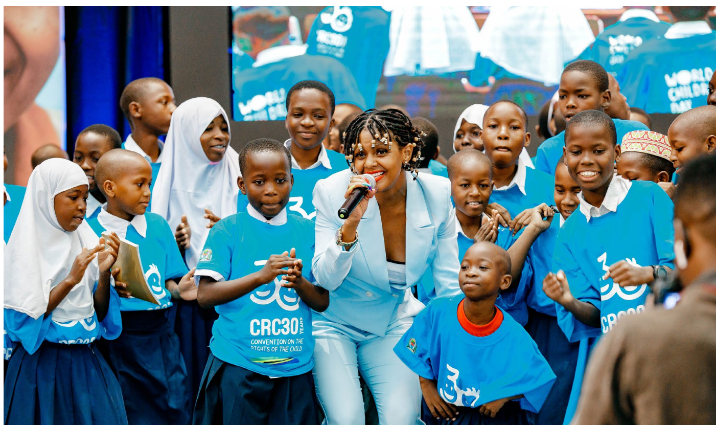
Tanzanian singer Mimi Mars is joined by children on stage while making a surprise performance. She sang “Watoto ni taifa la kesho!” – a song she wrote for the children of Tanzania to mark 30 years of the Convention on the Rights of the Child.