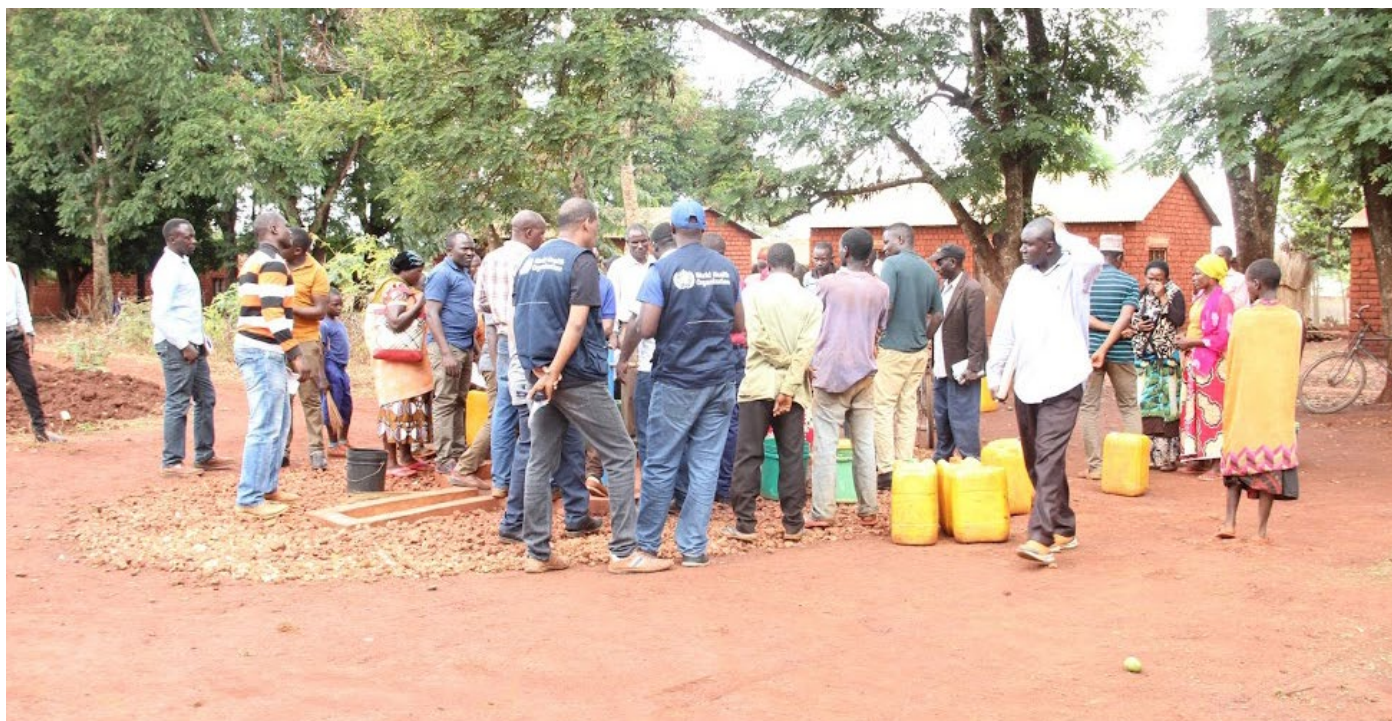
Water quality monitoring is essential to ensure a safe and clean supply of water for communities in Kigoma.