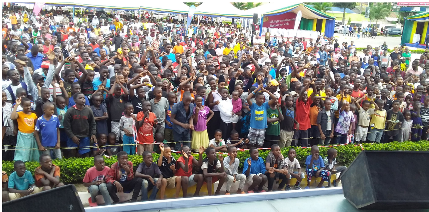
More than 2,000 people visited the grounds of the Rock City Mall, Mwanza, during World AIDS Day celebrations.

Throughout the week of WAD celebrations implementing partners, civil society and development partners exhibited their work in the grounds of the Rock City Mall in Mwanza, attracting more than 2,000 visitors who were able to learn more about HIV and AIDS. A total of 2,265 people used the occasion to test themselves for HIV, while others donated blood or were screened for cervical cancer.