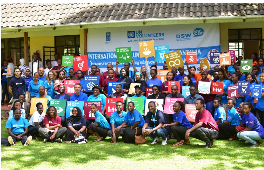
United Nations Volunteers and volunteers from various NGOs take a group picture with UN Officials during International Volunteer Day commemorations in Arusha. Over 250 volunteers from a variety of different organizations took part in the commemorations.

I nternational Volunteer Day (IVD), celebrated annually on December 5th, is an opportunity to promote volunteerism, support volunteer efforts, and recognize volunteers' contributions to the implementation of the Sustainable Development Goals (SDGs).