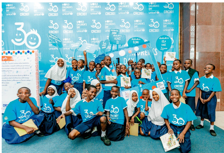
Tanzania's children "Go blue": Children #GoBlue for World Children's Day celebrations! 2019 marked the 30th anniversary of the Convention on the Rights of the Child, a unique opportunity for world leaders and stakeholders to re-commit to advancing child rights in the country.