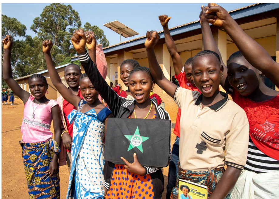
UNFPA is supporting girls in Kigoma to reach their full potential.