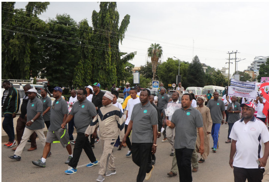
World AIDS Day Week 2019 opens with a charity walk through Mwanza for the national AIDS Trust Fund.

She also called for a well-coordinated, multisectoral and strengthened collaborative HIV response to reach the three zeros by 2030 zero new