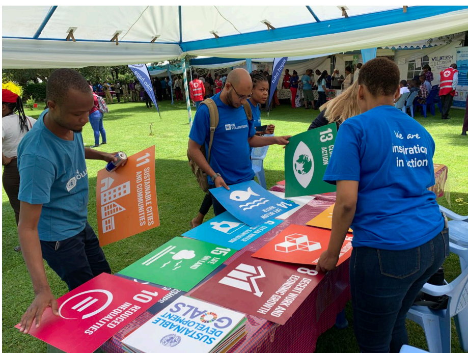
UN Volunteers offering community outreach services through SDGs exhibition booth during the International Volunteer Day in Arusha.

Over 350 volunteers including community and youth volunteers from higher learning institutions, youth volunteer peer educators and UN Volunteers attended the celebrations in Arusha to speak about their experiences, with attendees joining in with tree planting and picking up litter in the hospital grounds.